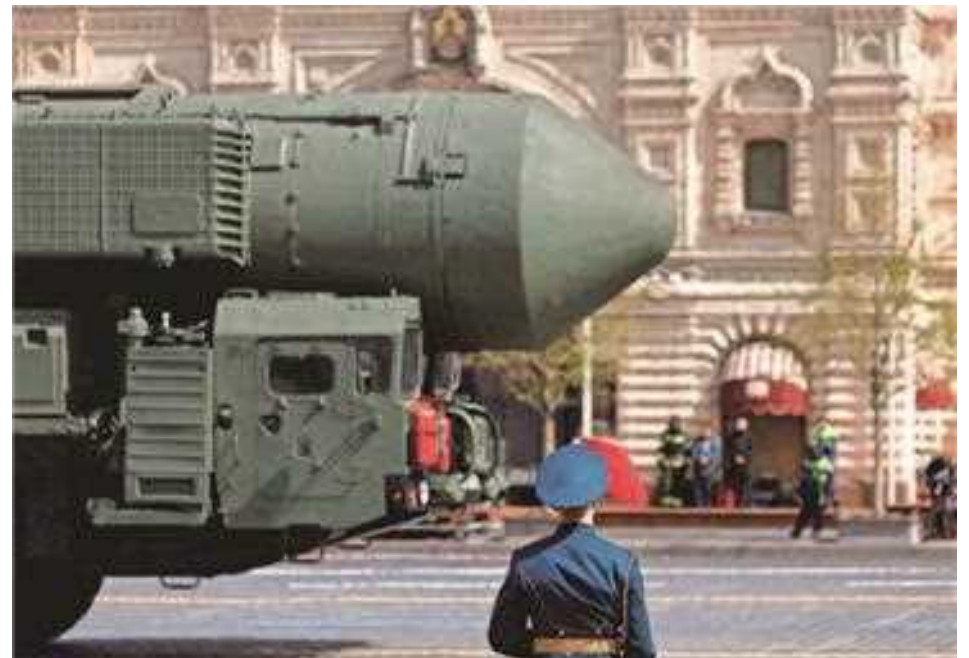
A Russian intercontinental ballistic missile system drives past an honor guard during a military parade in Moscow’s Red Square in 2022. President Vladimir Putin said nuclear use was an extreme measure and Russia had always approached the issue responsibly.