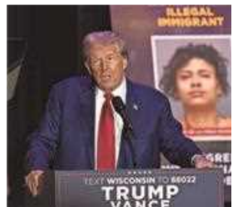
Donald Trump speaks Saturday in Prairie du Chien, Wis., where a Venezuelan who was in the U.S. illegally was detained in September for allegedly sexually assaulting a woman.