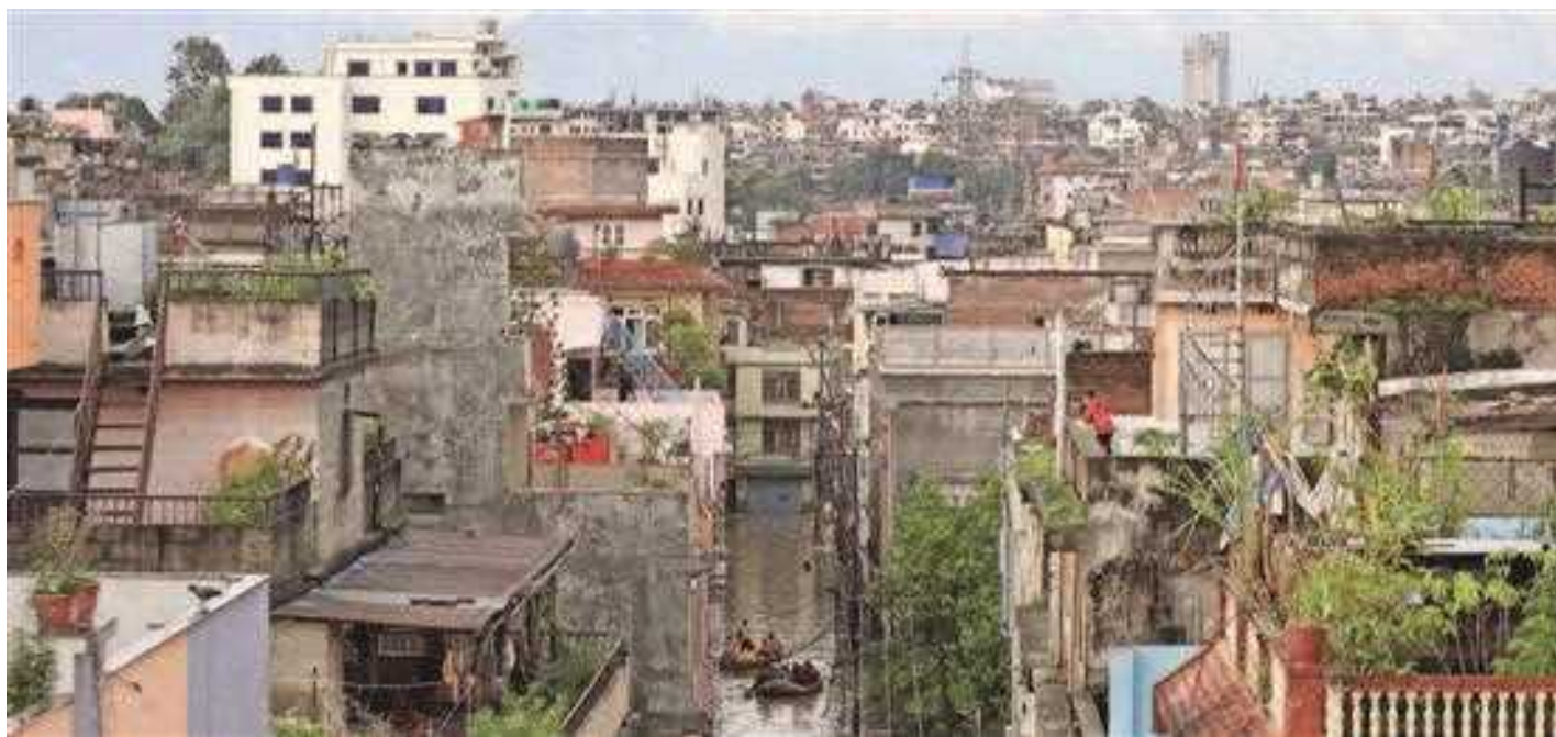
Some parts of Kathmandu, Nepal, reported up to 12.68 inches of rain, officials say.