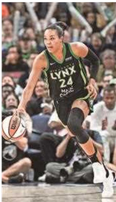
The Minnesota Lynx's Napheesa Collier dribbles against the Phoenix Mercury on Wednesday.