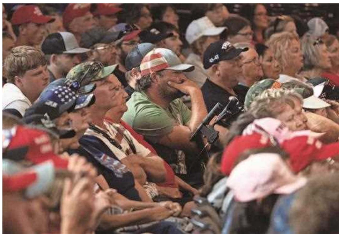
Supporters of former President Donald Trump listen during a campaign event in Prairie du Chien, Wis., on Saturday. Because of security concerns, the event was moved to an indoor facility.

A more populist Trump and Republican Party may pick inexperienced loyalists hostile to Wall Street to lead the agencies, some executives said, although others believe he would pick traditional industry conservatives.