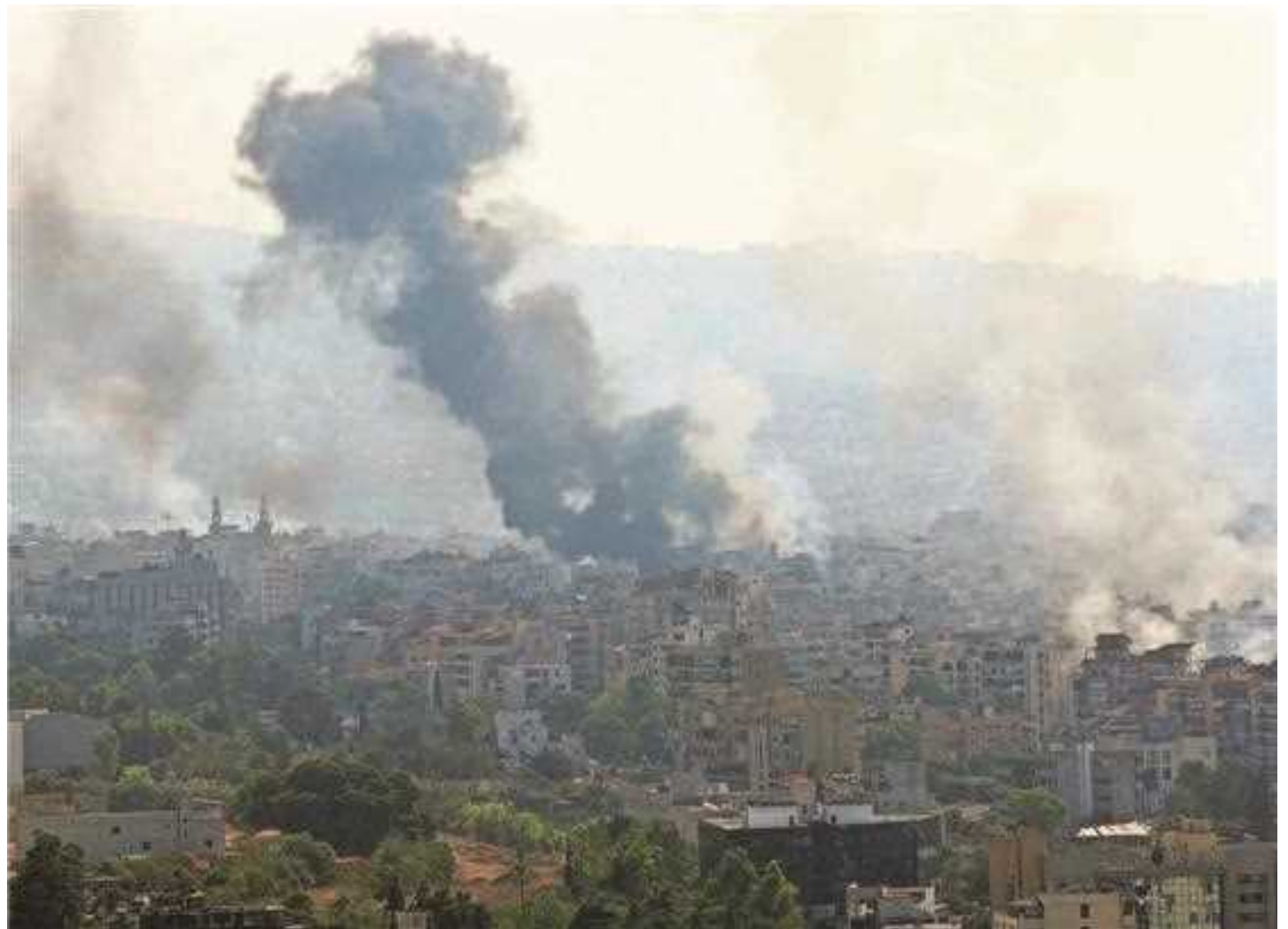
Smoke billows over Beirut's southern suburbs on Saturday amid ongoing hostilities between Hezbollah and Israeli forces.

That is ten times the size of the armory the group had in 2006, during its last war with Israel, according to Israeli