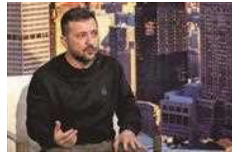
Ukraine’s foreign ministry said President Volodymyr Zelenskyy’s peace formula was “the only way to a comprehensive, just and sustainable peace.”

It called on Switzerland “and all countries that support international law and the UN Charter” not to participate in initiatives that “can only complicate the process of achieving a comprehensive,