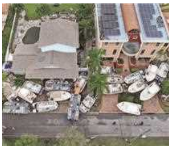
Boats are piled up in front of homes in Treasure Island, Fla., on Saturday after Hurricane Helene hit the area.

"Towns are totally cut off," she said after spending her morning making dozens of calls to friends in the area. "They're using helicopters to get people out of Boone and Asheville."