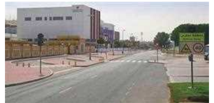
■ The RTA has implemented traffic diversions in surrounding areas and paved parking spaces in front of schools.

Key improvements involved widening streets leading to the schools, creating additional parking spaces, improving entrances and exits, and implementing traffic diversions in