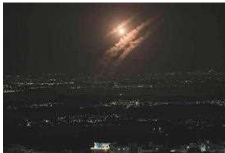
■ This picture taken from the West Bank city of Hebron shows projectiles above the Israeli city of Ashdod yesterday.

of the scale of the operation or its time frame.