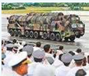
S. Korean president warns North of 'regime end' if it uses nukes

North Korean leader Kim Jong Un would face the end of his regime if he ever used his isolated country's nuclear weapons against the South, Seoul's president said yesterday. — AFP