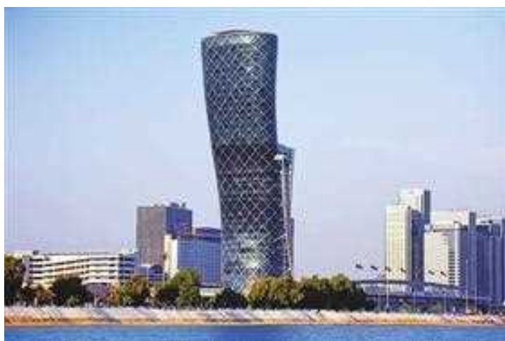
Afra Mubarak Alnofelli/Gulf News

Led by ADH subsidiary Trojan Construction, ADCH is recognised for its commitment to national development. Its track record includes work on iconic UAE projects such as Zayed National Museum and the Guggenheim Museum, and supporting critical infrastructure such as the national rail-