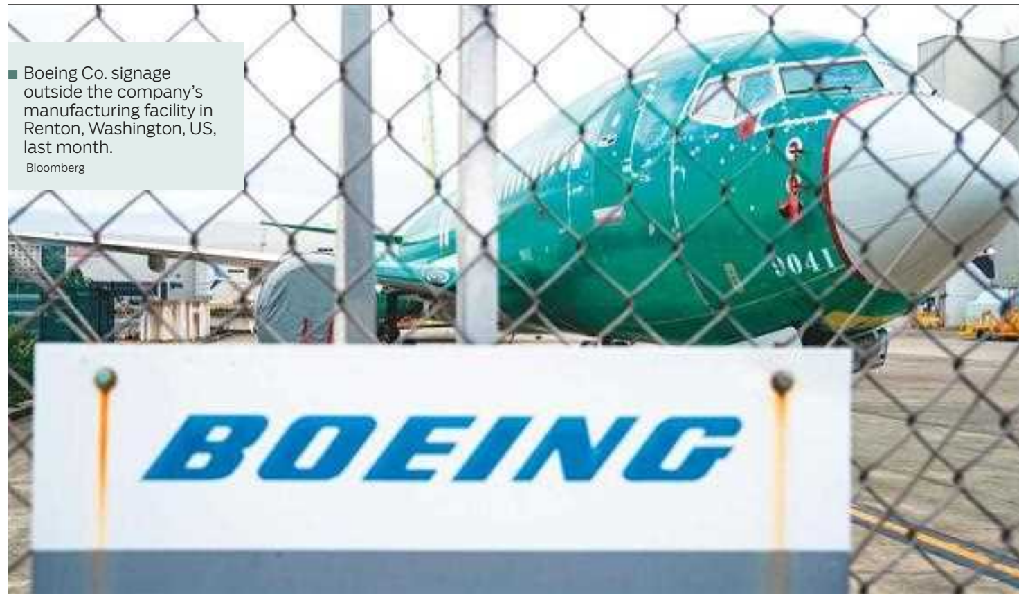
Boeing Co. signage outside the company's manufacturing facility in Renton, Washington, US, last month.