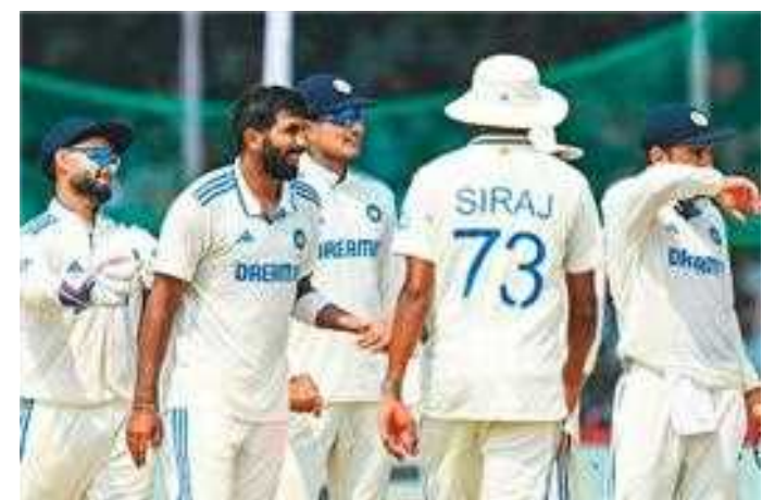
India's Jasprit Bumrah celebrates with teammates after their victory over Bangladesh in the second Test yesterday.

"When Rahul [Dravid] bhai said he was done, we had a fantastic time together. Then life moves on ... With Gautam Gambhir, I've played with him and I know what sort of mindset he has. It's still early days, but it's been very fruitful," Rohit Sharma told the broadcasters after the win. "The batters were willing to take the risk, and we were ready to give ourselves a chance at a result."