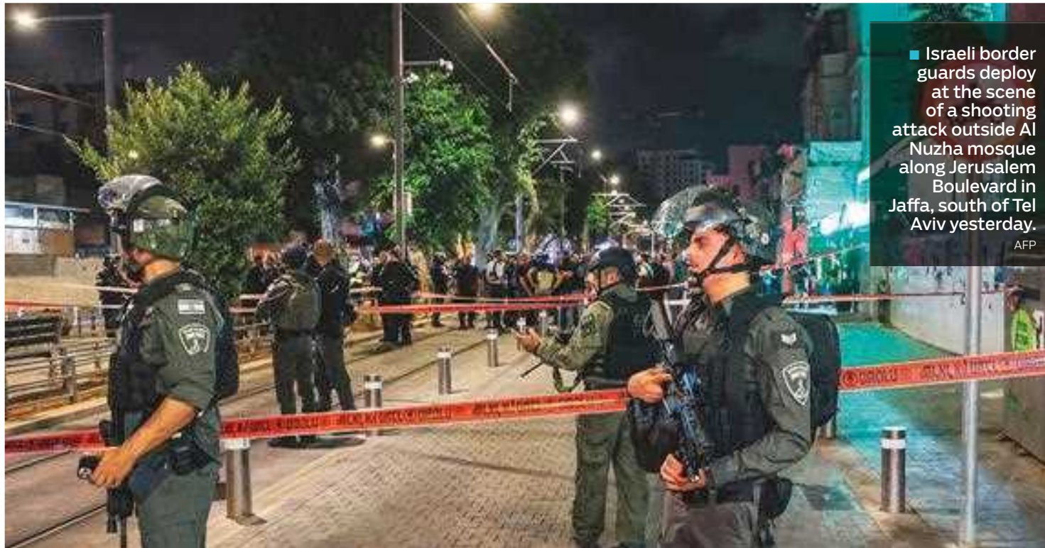
■ Israeli border guards deploy at the scene of a shooting attack outside Al Nuzha mosque along Jerusalem Boulevard in Jaffa, south of Tel Aviv yesterday.