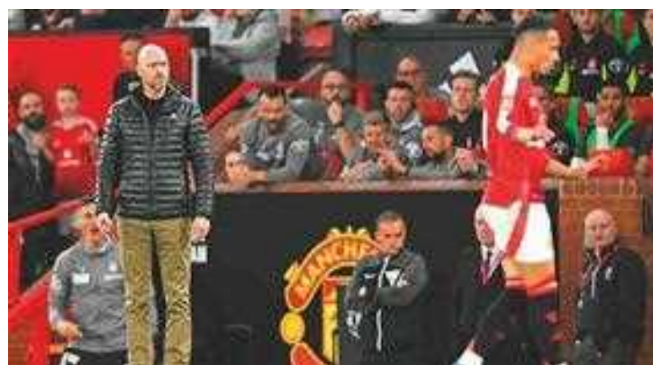
Manchester United's manager Erik ten Hag reacts during the League Cup match against Barnsley at Old Trafford.

In contrast, managers like Arne Slot, Enzo Maresca, and Ange Postecoglou — who have all