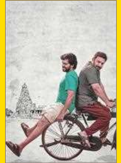
Arvind Swami and Karthi play cousins in Meiyazhagan , a simple film with a rare script about two people finding each other.