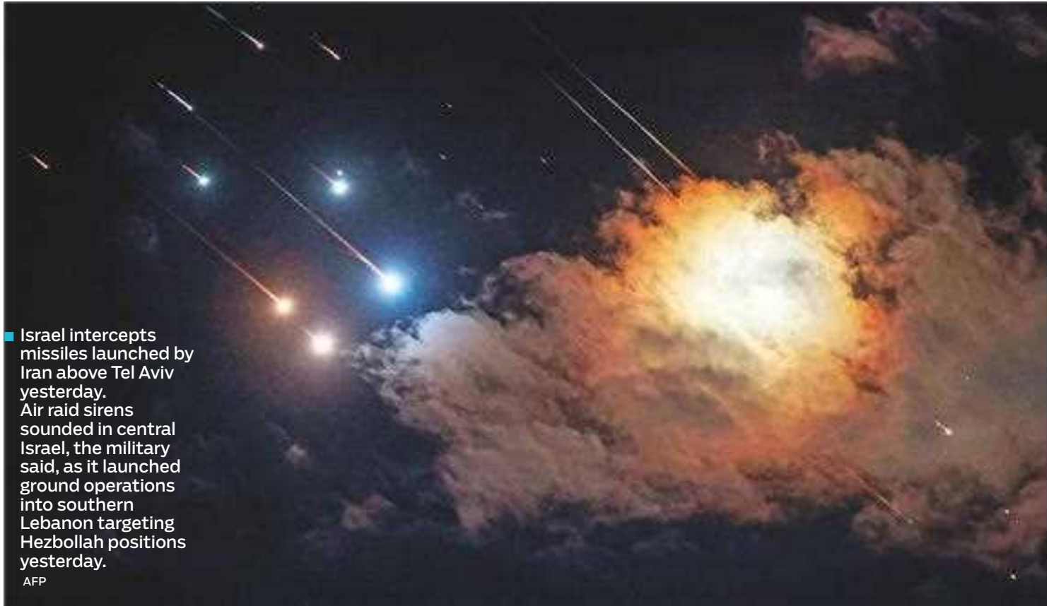
Israel intercepts missiles launched by Iran above Tel Aviv yesterday. Air raid sirens sounded in central Israel, the military said, as it launched ground operations into southern Lebanon targeting Hezbollah positions yesterday.