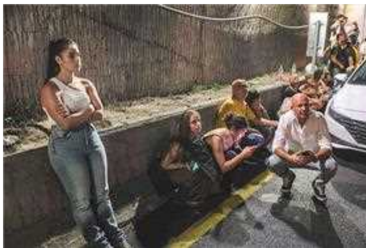
■ People take cover behind vehicles under a bridge along the side of a highway in Tel Aviv yesterday.