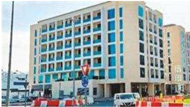
■ The offices of SG IVS Global Attestation Centre will move to office No 302 and 104 in Al Nasr Central, Oud Metha.

If applicants have any grievance or suggestions, they can use the feedback forms available at the centre.