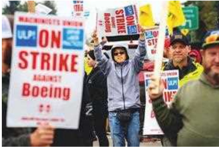
Workers picket outside a Boeing Co. facility during a strike in Everett, Washington, US, on September 16.

The strained situation has been exacerbated by the strike now in its third week that has