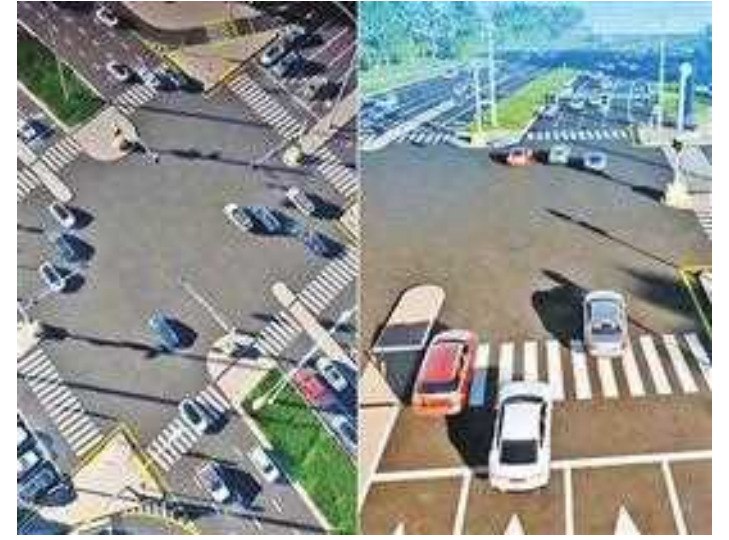
■ New lanes and pathways have been added to the Sultan Bin Zayed the First Street intersection to accommodate 3,500 more vehicles and enhance pedestrian movement.

He stated that the first phase is expected to be completed by the fourth quarter of 2027 at a cost of Dh3 billion, while the second phase is expected to be