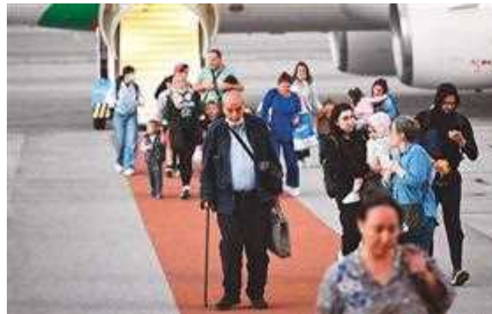
■ Passengers disembark a Bulgarian government evacuation flight from Lebanon, at Sofia airport on Monday.

The Beirut embassy remained operational to help the