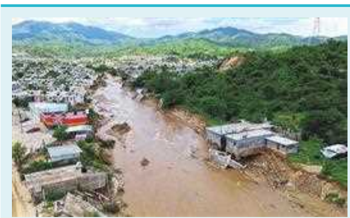
Houses partially destroyed by flooding following Hurricane John in Acapulco, Guerrero State, Mexico, on Monday.

VALDOSTA T he death toll from a devastating storm that battered the southeastern United States climbed to at least 130 on Monday, as the disaster became a hot topic in an already bitter election campaign, with the White House angrily refuting claims it had been slow to respond.