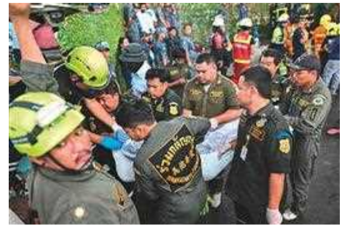
Rescuers carry a victim's body after a fire on a school bus on the outskirts of Bangkok yesterday. AFP

Prime Minister Paetongtarn Shinawatra said the government would pay for the survivors' medical treatment and compensate the victims' families. — AFP