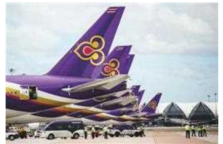
The Thai flag carrier aims to emerge from its court-monitored debt-restructuring plan in 2025.