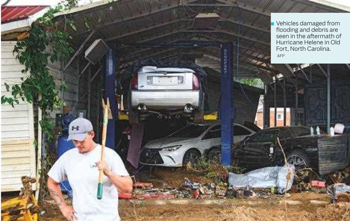
Vehicles damaged from flooding and debris are seen in the aftermath of Hurricane Helene in Old Fort, North Carolina.