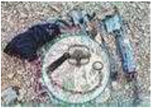
■ The illegal animal traps were found in Fujairah's mountainous areas.