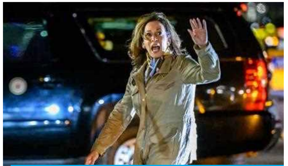
SAN FRANCISCO: US Vice President and Democratic presidential candidate Kamala Harris waves as she walks to a vehicle after arriving at San Francisco International Airport on Sept 27, 2024.

Recent polls have seen Harris eating into Trump's lead on migration with voters, yet it still remains a