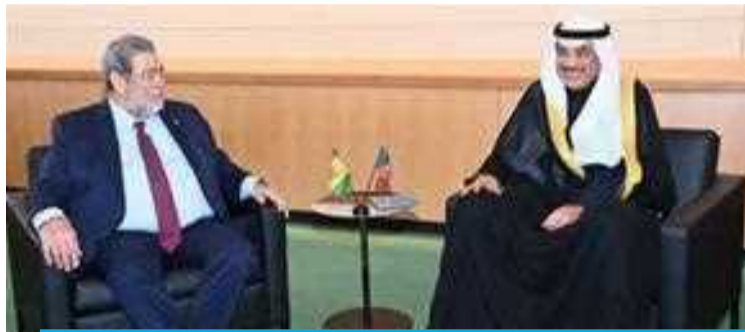
Representative of His Highness the Amir, His Highness the Crown Prince meets with the Prime Minister of Saint Vincent and the Grenadines on the sidelines of the UN General Assembly meetings in New York.