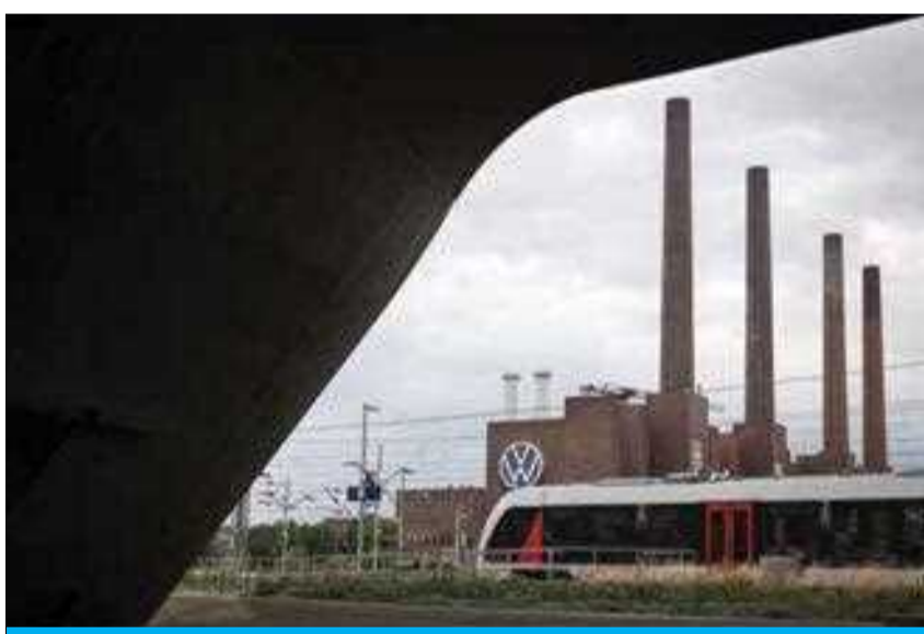
WOLFSBURG, Germany: An RB (regional railway) train leaves the main railway station in front of the power plant at the headquarters of German carmaker Volkswagen (VW) on September 25, 2024 in Wolfsburg.

VW said that it now expected revenues to be about 320 billion euros ($357 billion), after previously fore-