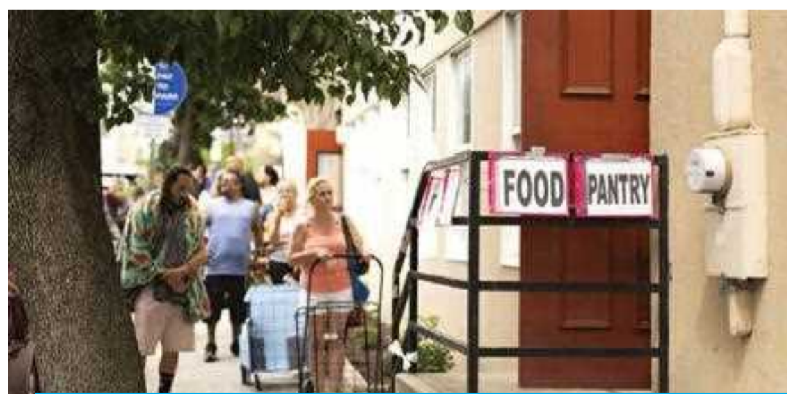
BETHLEHEM, US: People line up at the entrance to the New Bethany food pantry in Bethlehem, Pennsylvania on July 22, 2024.

Food and beverages sales fell. Price-conscious consumers are trading down to cheaper store-brand items. These declines more than offset increases in outlays on other nondurable goods and recreational goods and vehicles. Adjusted for inflation, consumer