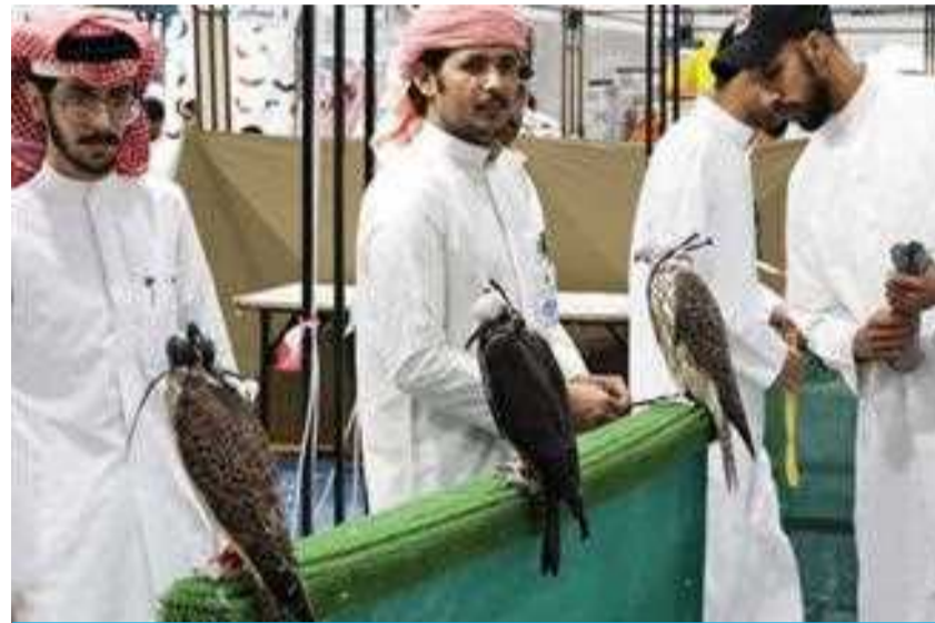
Falcon enthusiasts watch the birds during the Kuwait International Falcon Exhibition on Saturday.

He pointed out that the incidents of fires caused by juveniles and children tampering with a heat source or flammable materials - deliberate act reached 396 fire incidents according to the incident reporting system, with 184 fire incidents caused by deliberate act and 212 fire incidents caused by juveniles and children. — KUNA