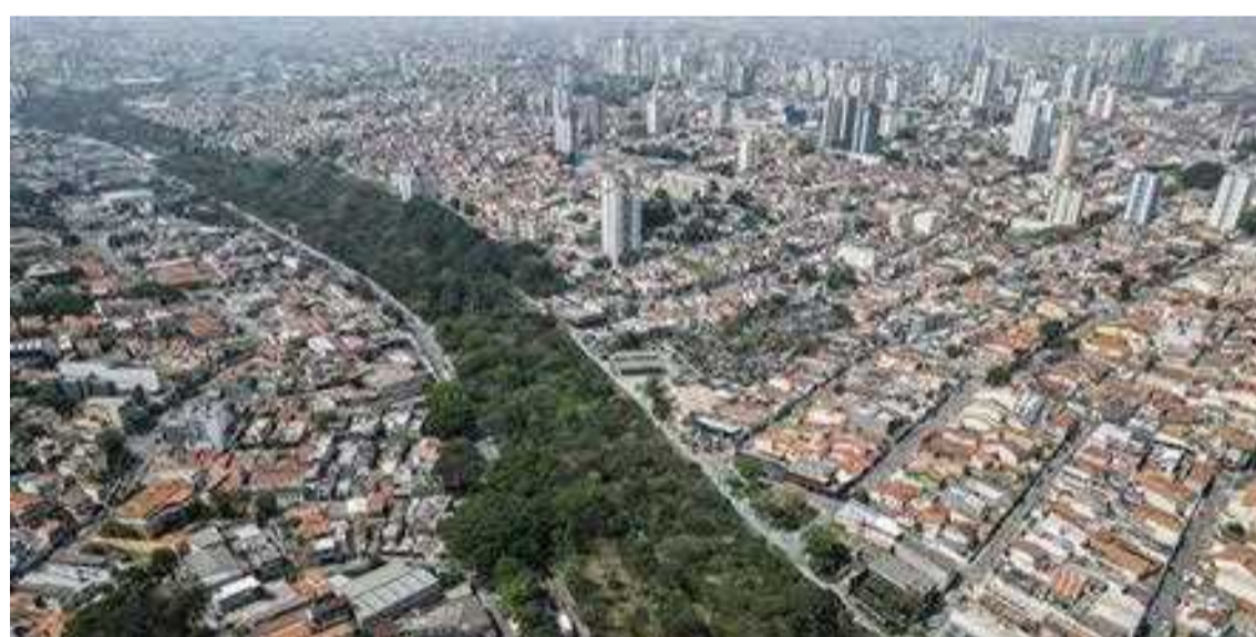
This aerial view shows the Tiquatira Linear Park --officially named Tiquatira Linear Park Engineer Werner Eugenio Zulauf-- in Sao Paulo, Brazil.