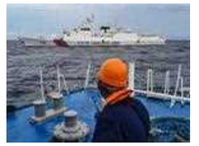
US, Asia-Pacific nations hold exercises in South China Sea