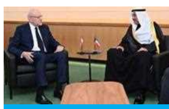
Representative of His Highness the Amir, His Highness the Crown Prince receives the Prime Minister of Lebanon on the sidelines of the 'High-Level Week' in New York.

solution," he said, calling on the international community to mobilize for an immediate ceasefire and the beginning of an irreversible process towards the end of Zionist occupation and the creation of a Palestinian State.