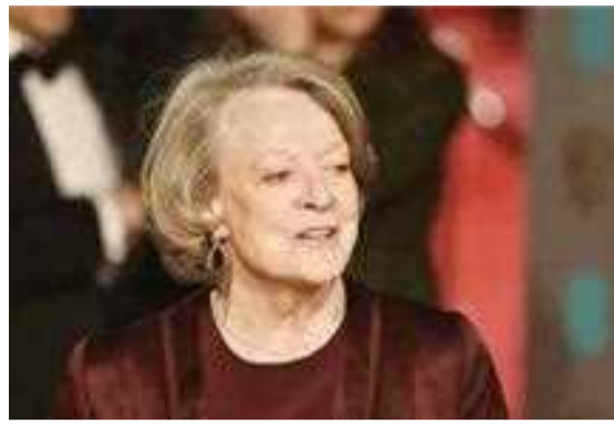
British actress Maggie Smith poses on arrival for the BAFTA British Academy Film Awards at the Royal Opera House in London on February 14, 2016.

She won a best actress Oscar for the 1969 drama "The Prime of Miss Jean Brodie" based on Muriel Spark's novel, and best supporting actress for her role in the 1978 Neil Simon comedy "California Suite". "An intensely private person, she was with friends and family at the end," her sons, both actors, said. "She leaves two sons and five loving grandchildren who are devastated by the loss of their extraordinary mother and grandmother."