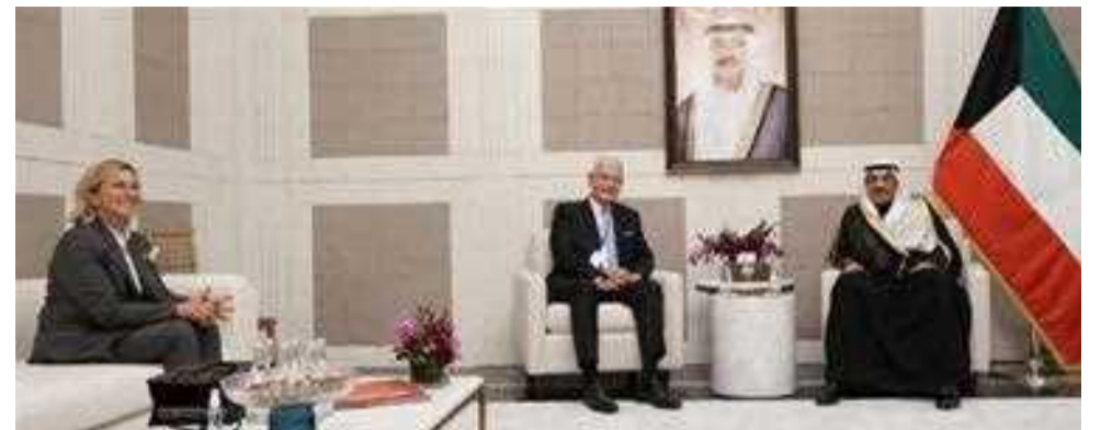
Representative of His Highness the Amir, His Highness the Crown Prince receives the President of the 75th session of the General Assembly, Advisor to the Board of Directors of the Turkish Limak Group and the Chairwoman of the Board of Directors on the sidelines of the United Nations General Assembly meetings in New York.