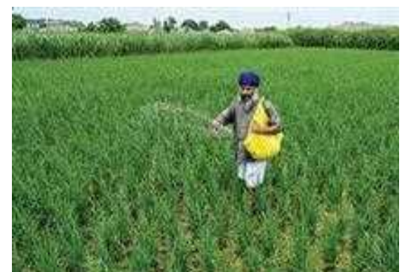
A farmer sprinkles fertilizer over crops at a rice field on the outskirts of Amritsar.

By sharing these essential guidelines, Gulf Bank reaffirms its commitment to fostering a secure banking environment and empowering its customers with the knowledge necessary to protect their financial well-being.