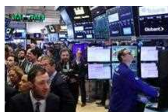
NEW YORK: Traders work on the floor of the New York Stock Exchange during morning trading.

"While the totality of the data will always be important, the burden will be on incoming labor market data to