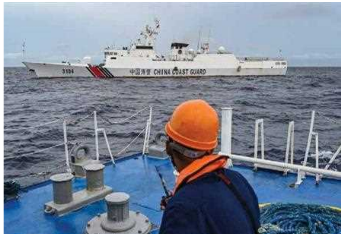
AT SEA: A China Coast Guard ship is seen from the Philippine Coast Guard vessel BRP Cabra during a supply mission to Sabina Shoal in disputed waters of the South China Sea on August 26, 2024.

Beijing said the training activities around the shoal included "reconnaissance, early warning, and air-sea patrols". "Certain countries outside the region are stirring up trouble in the South China Sea, creating instability in the region," the Southern Theater Command said in a statement. — Agencies