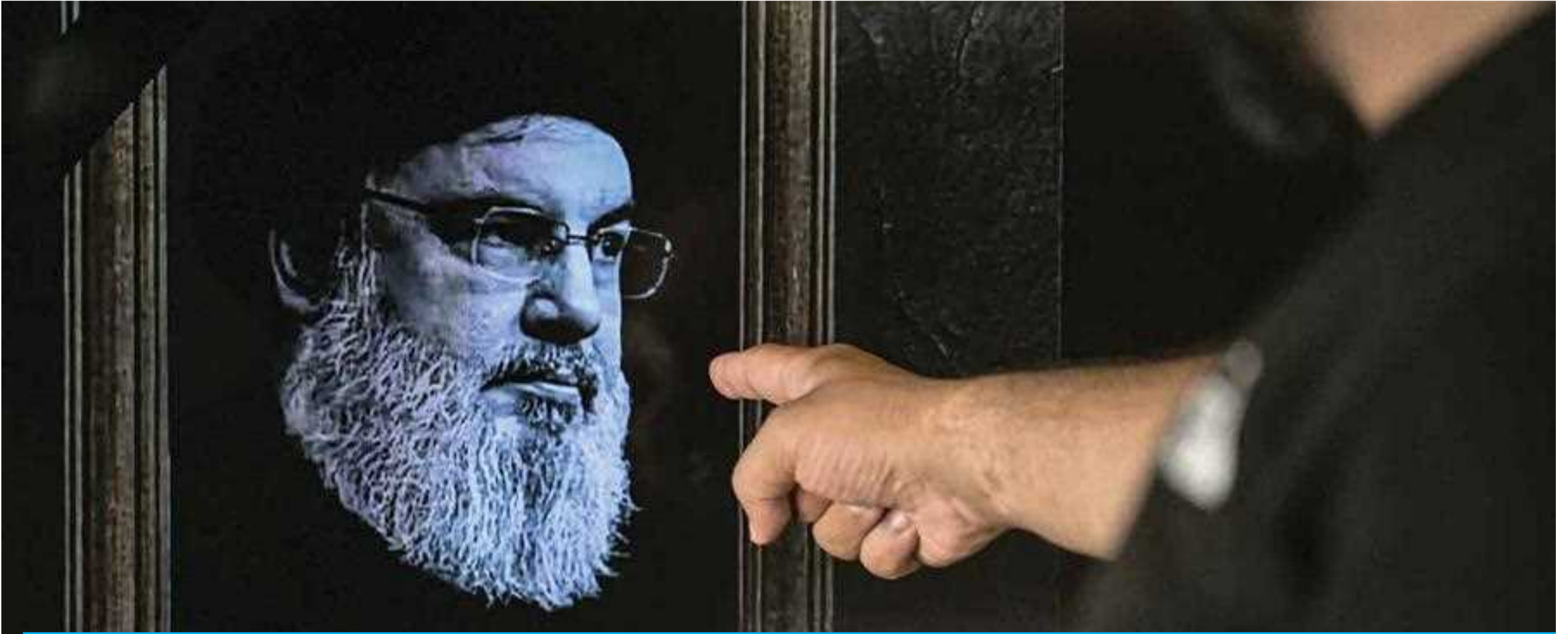
BEIRUT: A man points to a television set displaying an image of the late leader of Hezbollah Hassan Nasrallah with a black stripe for mourning during a broadcast from the private Lebanese station NBN in Beirut on Sept 28, 2024.