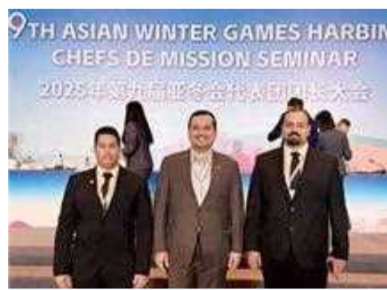
Participants at the meeting of the Organizing Committee of the Harbin 2025 Asian Winter Games.

the International Ski Federation (FIS) currently being held in Switzerland, as the latter agreed to organize the Kuwaiti club for an international championship game next April, adding that "the federation made a promise to grant Kuwait full membership in the federation in its next meeting in 2025.