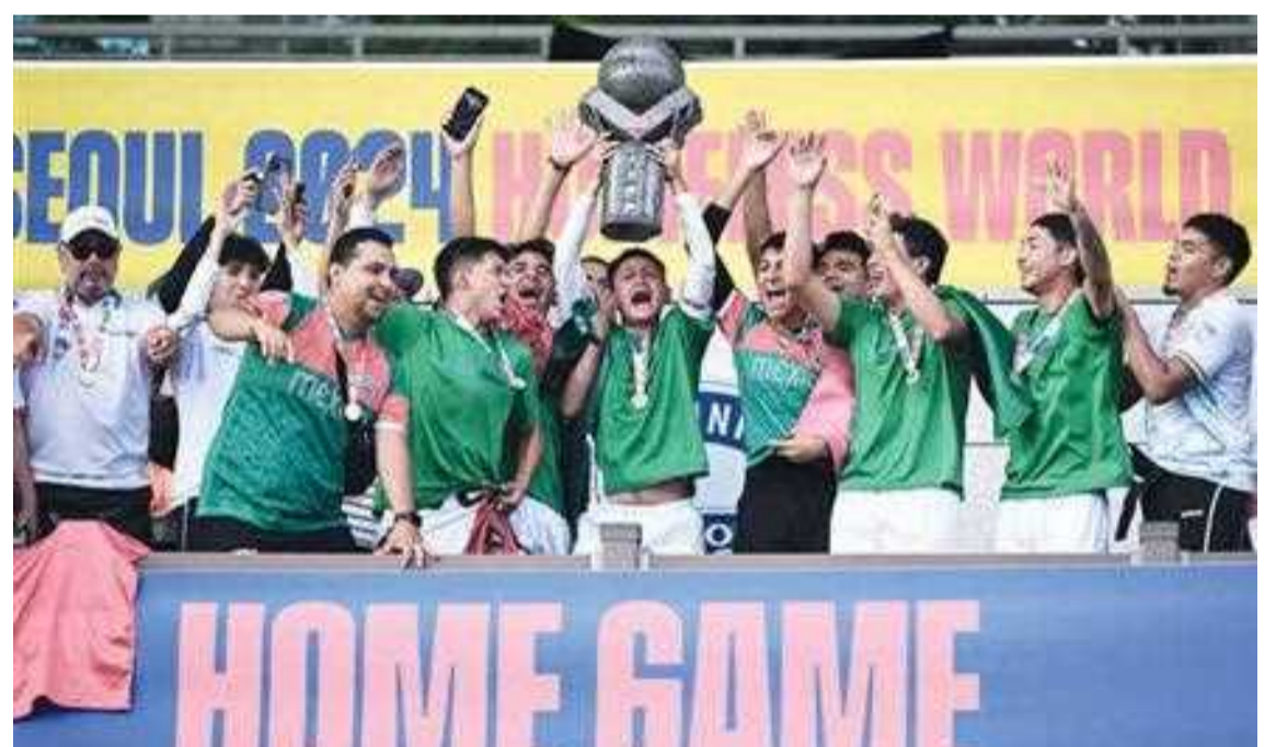
SEOUL: Team Mexico members celebrate their victory with the trophy after winning the men's 4x4 football final match between Mexico and England at the 2024 Homeless World Cup in Seoul.

"FIFA is excited to contribute, because we share the view of the Homeless World Cup