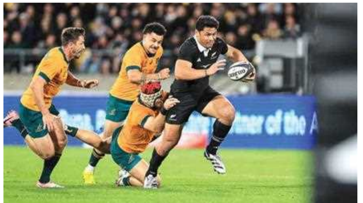
WELLINGTON: New Zealand's Caleb Clarke breaks a tackle during The Rugby Championship and Bledisloe Cup match between New Zealand All Blacks and Australia Wallabies at Sky Stadium in Wellington. — AFP

Wing Sevu Reece capitalized on a break and accurate long pass from centre Anton Lienert-Brown to score, before fullback Will Jordan danced through the defence for his 35th try in 37 Tests. The home side turned down a simple penalty shot at goal on the stroke of half-time and their gamble paid off, with Lienert-Brown's pass sending Clarke through and untouched next to the posts. — AFP