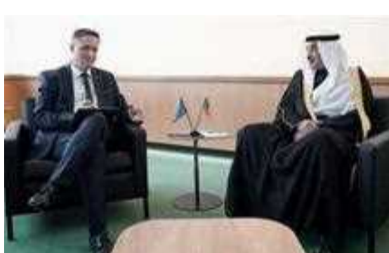
Representative of His Highness the Amir, His Highness the Crown Prince receives the Chairman of the Presidency of Bosnia and Herzegovina.

Meanwhile, UN Secretary-General Antonio Guterres said the UN commits to keeping backing sustainable peace efforts, echoing his call for an immediate Gaza ceasefire. Guterres made the remarks while addressing a United Nations Security Council (UNSC) held late Friday upon Algeria's request on the Middle East situation, including the Palestinian issue. "The key to peace in the region is a political