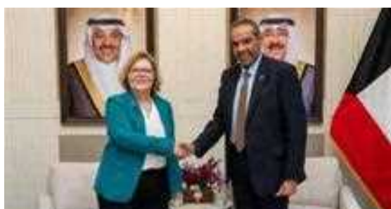
Kuwaiti Minister of Foreign Affairs Abdullah Al-Yahya holds talks with US Assistant Secretary of State for Near Eastern Affairs Barbara Leaf on the sidelines of the 79th session of the UN General Assembly.

He added that the country is committed to supporting international efforts aimed at strengthening national and global responses to combat antimicrobial resistance by participating in ministerial conferences and contributing to the formulation of policies related to combating antibiotics. Al-Awadhi stated that Kuwait sets goals that are consistent with the World Health Organization's action plan on antimicrobial resistance, noting that it seeks to enhance its successes within the framework of the AWARE program for classifying antibiotics. The minister stressed that Kuwait calls for continuous work and cooperation between countries to maintain the progress made and achieve long-term goals in reducing antibiotic resistance, thus enhancing everyone's commitment to global health security. — KUNA