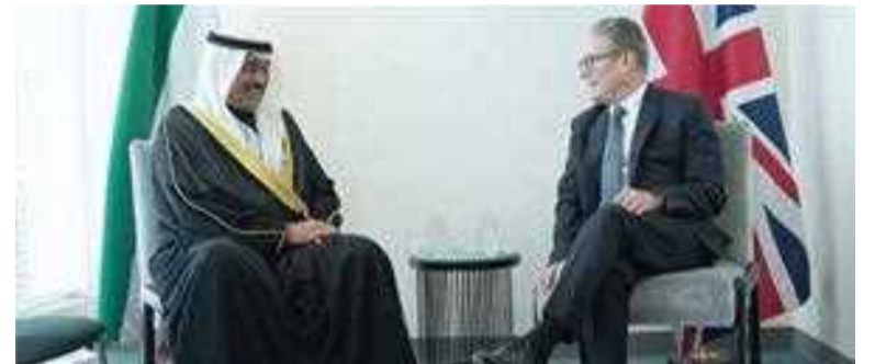
Representative of His Highness the Amir, His Highness the Crown Prince meets with the British Prime Minister on the sidelines of the UN General Assembly meetings.

KUWAIT: Representative of His Highness the Amir Sheikh Mishal Al-Ahmad Al-Jaber Al-Sabah, His Highness the Crown Prince Sheikh Sabah Al-Khaled Al-Hamad Al-Sabah and his accompanying delegation returned to Kuwait after leading the country's delegation partaking in the 79th session of the United Nations General Assembly (UNGA), held in New York. The accompanying delegation of His Highness the Amir's Representative comprised Minister of Foreign Affairs Abdullah Al-Yahya, Director General of Kuwait Direct Investment Promotion Authority Sheikh Dr Meshal Jaber Al-Ahmad Al-Sabah and senior officials of His Highness the Crown Prince's Diwan.