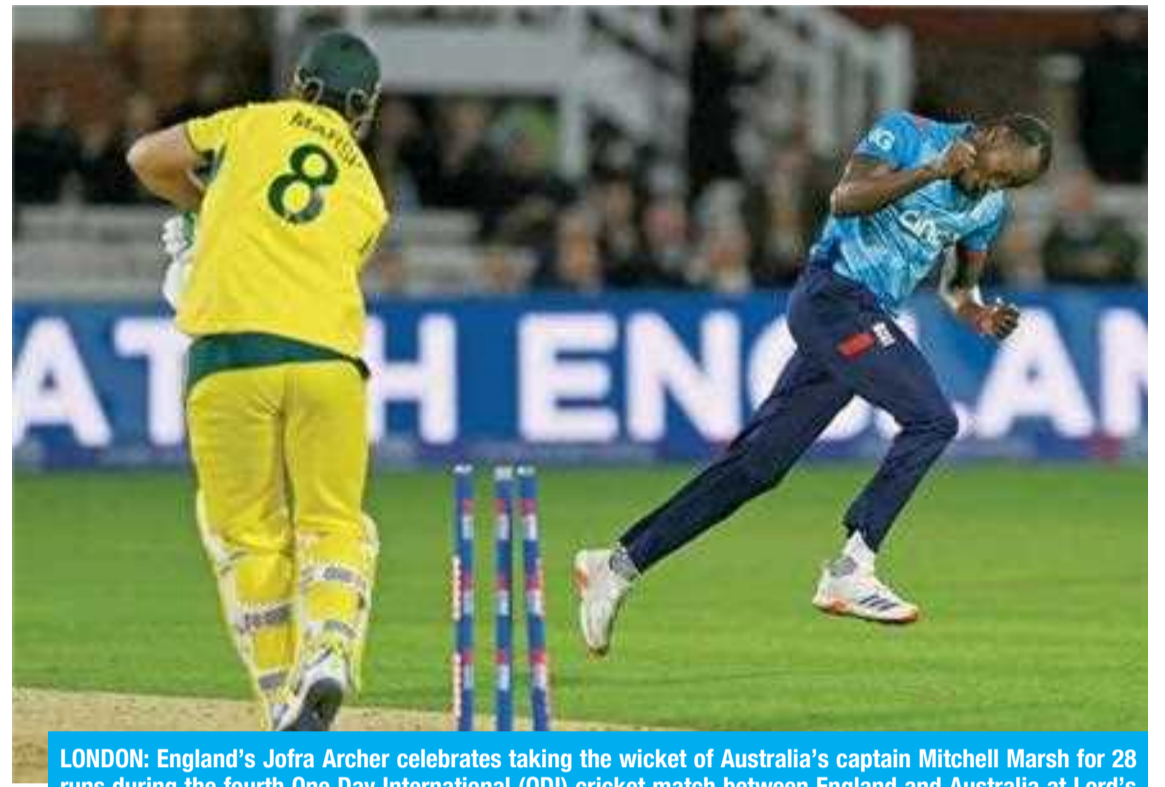
LONDON: England's Jofra Archer celebrates taking the wicket of Australia's captain Mitchell Marsh for 28 runs during the fourth One Day International (ODI) cricket match between England and Australia at Lord's in London.

Australia, without Cameron Green after the all-rounder suffered a tour-ending back injury, had few answers as skipper Marsh admitted. "Fair play to England, they put us under a lot of pressure with the bat," Marsh told Sky Sports. "We couldn't get early wickets and they thoroughly out-played us today. Liam Livingstone played a gem of an innings." He added: "England bowled really well. We lost wickets continually and that's cricket."