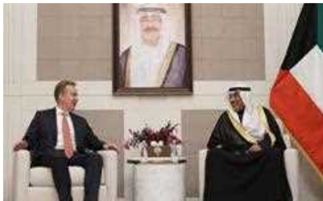
Representative of His Highness the Amir, His Highness the Crown Prince received the President of the World Economic Forum Borge Brende on the sidelines of the 79th session of the United Nations General Assembly in New York.