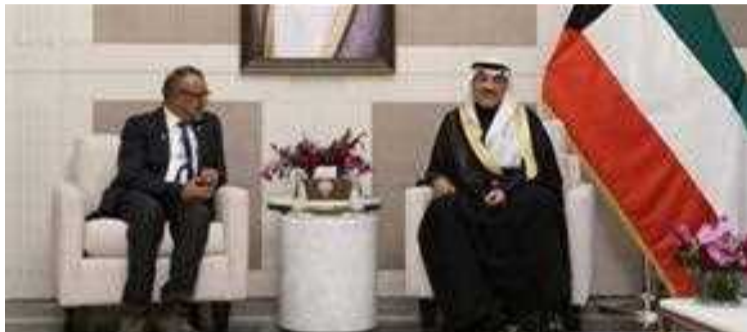
Representative of His Highness the Amir, His Highness the Crown Prince receives the President of the World Health Organization on the sidelines of the UN General Assembly meetings in New York.