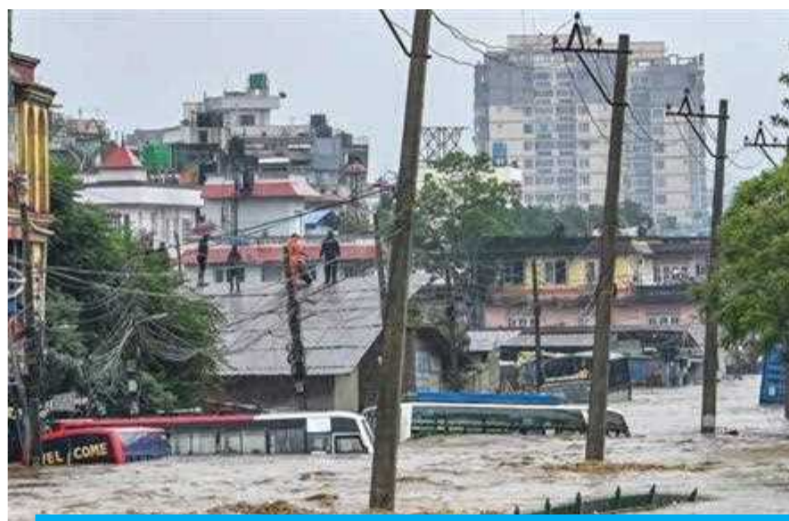
KATHMANDU: Residents climb over a rooftop as their neighborhood submerged in flood waters after the Bagmati River overflowed in Kathmandu on Sept 28, 2024.

Most central and eastern areas had received