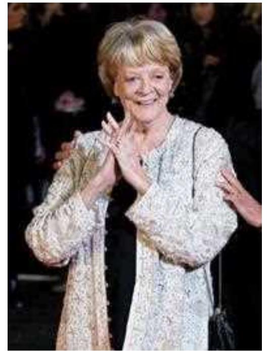
A file photo taken on October 15, 2012, shows British actress Maggie Smith on the red carpet as she arrives to attend the premiere of 'Quartet' during the 56th BFI London Film Festival in London.

"It's ridiculous," she told the British Film Institute in 2017. "I led a perfectly normal life until Downton Abbey. I would go to theatres, I would go to galleries and things like that on my own. And now I can't," she said. Julian Fellowes, creator and writer of Downton Abbey, said Smith had a "marvelous instinctive grasp, she could make you cry your eyes out one minute