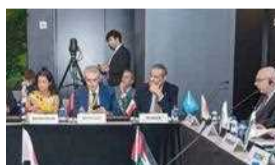
Kuwait's Minister of Foreign Affairs Abdullah Al-Yahya takes part in Global Counterterrorism Forum ministerial meeting.

Meanwhile, United Nations Secretary-General Antonio Guterres has called for reforming the global mul-