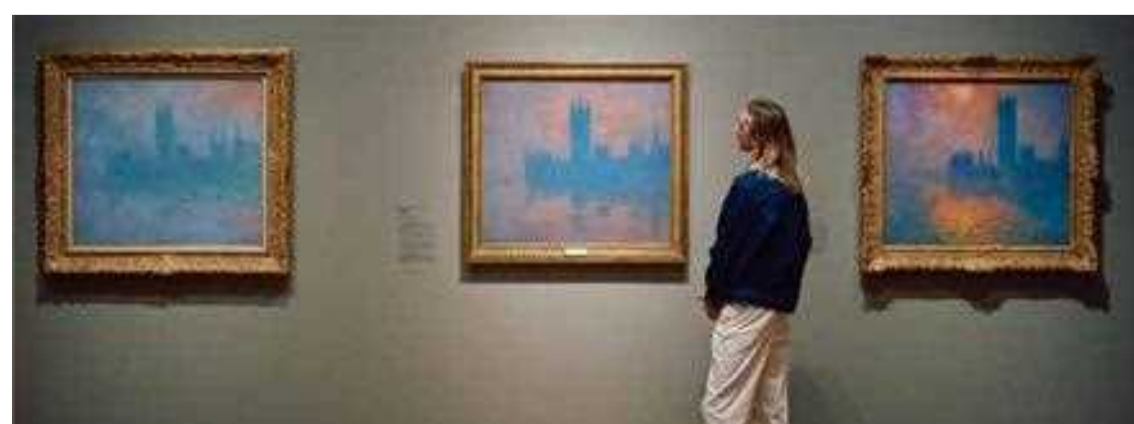
A gallery assistant studies a work by the French impressionist painter Claude Monet, "The Houses of Parliament. Sunset" 1904 (center), at a press view for "Monet and London".

Monet, who died of lung cancer in 1926 aged 86, described one such moment to his wife. "The sun came up, so blinding that one could not look at it," he wrote. "The Thames was pure gold. God it was so beautiful." Monet would return to Giverny, north of Paris, after his London trips with dozens of paintings to finish in his studio.