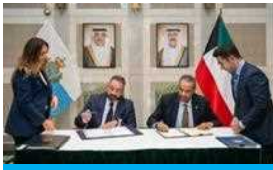
Minister of Foreign Affairs meets with San Marino counterpart Luca Beccari, on the sidelines of the UN General Assembly's 79th session in New York. The two sides discussed developing cooperation and bilateral ties, as well as the recent regional and international developments.