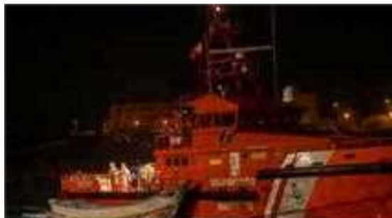
LA RESTINGA, Spain: A Spanish Salvamento Marítimo (Sea Search and Rescue agency) vessel tows a boat after 3 "cayuco" boats with around 180 persons onboard arrived at La Restinga port on the Canary island of El Hierro.

"We need Spain and the EU to act decisively in the face of a structural humanitarian tragedy" as lives are lost "meters from Europe's southern border", he added. In late August, Spain's Prime Minister Pedro Sanchez visited Mauritania and The Gambia to sign cooperation agreements to crack down on people smugglers while expanding pathways for legal immigration. As of August 15, 22,304 migrants