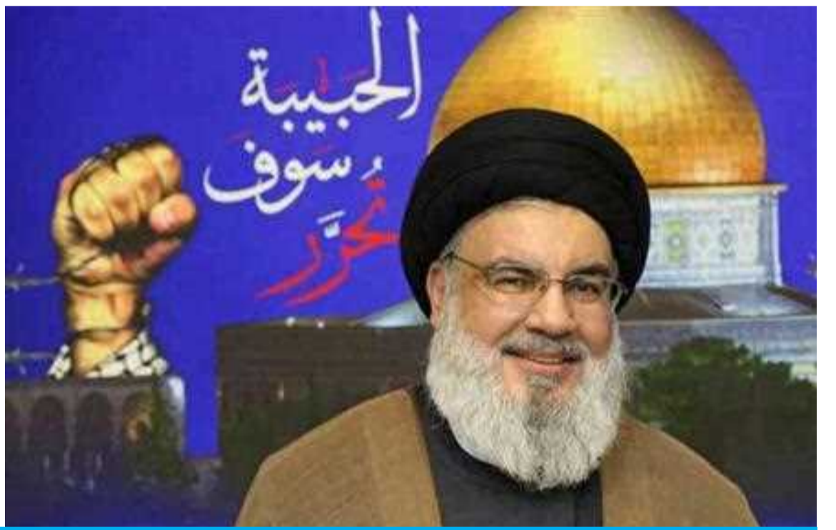
BEIRUT: (left) People and rescuers gather near the smoldering rubble of a building destroyed in a Zionist air strike in the Haret Hreik neighborhood of Beirut's southern suburbs on Sept 27, 2024. (Right) A handout picture shows Hezbollah chief Hassan Nasrallah posing for a picture during a meeting at an undisclosed location.