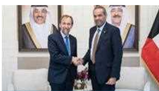
Kuwait Minister of Foreign Affairs Abdullah Al-Yahya met on Friday with the International Peace Institute (IPI) President Prince Zeid Ra'ad Al Hussein on the sidelines of the 79th session of the UN General Assembly.

The Minister of Foreign Affairs took part in the ministerial plenary meeting of the Global Counterterrorism Forum in New York. In a press statement, the Ministry of Foreign Affairs said the meeting was chaired by Vice President of the European Commission and the EU High Representative for Foreign Affairs and Security Policy Josep Borrell and Egyptian Minister of Foreign Affairs,