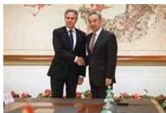
US Secretary of State Antony Blinken greets China's Foreign Minister Wang Yi before a meeting on September 27, 2024, in New York.

Wang told Blinken during the meeting that China's position on the Ukraine conflict was "open and aboveboard, always advocating for peace and dialogue, and working towards a political solution", Beijing's foreign ministry said in a statement on Saturday. "The US should stop smearing and sanctioning China and refrain from using the issue to create divisions and provoke bloc confrontations," Wang added. China says it has not directly provided weapons to Russia and draws a contrast with the United States, which has shipped billions of dollars in weap-