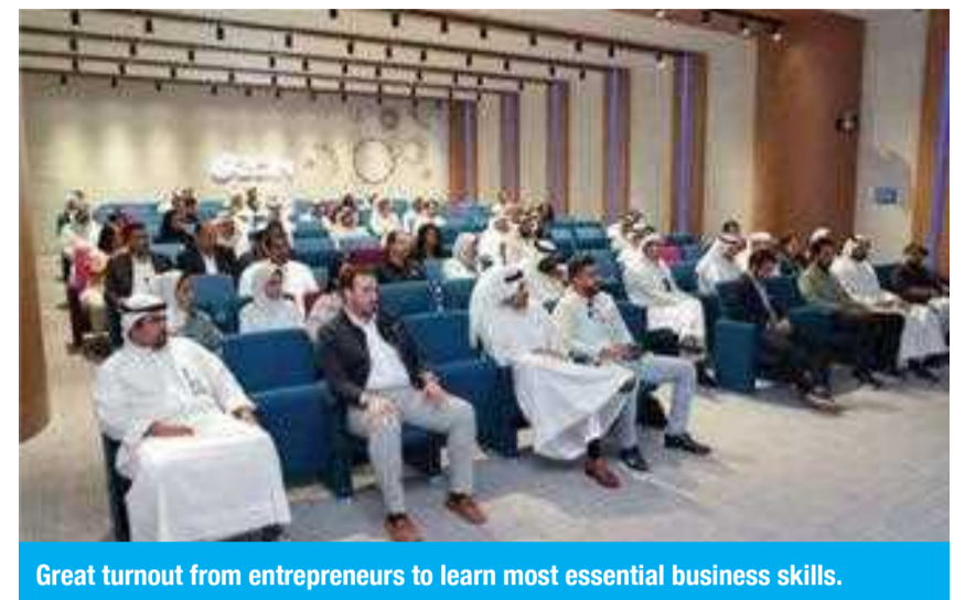
Great turnout from entrepreneurs to learn most essential business skills.

KUWAIT: The Zain Great Idea (ZGI) accelerator program's first phase has kicked-off. The bootcamp witnessed great turnout from idea owners and entrepreneurs to learn the most essential business and startup management skills, featuring intensive workshops, training programs, and one-on-one mentoring sessions, aims to upskill entrepreneurs and startup owners, and is facilitated by a group of experts from local, regional, and international academic institutions.