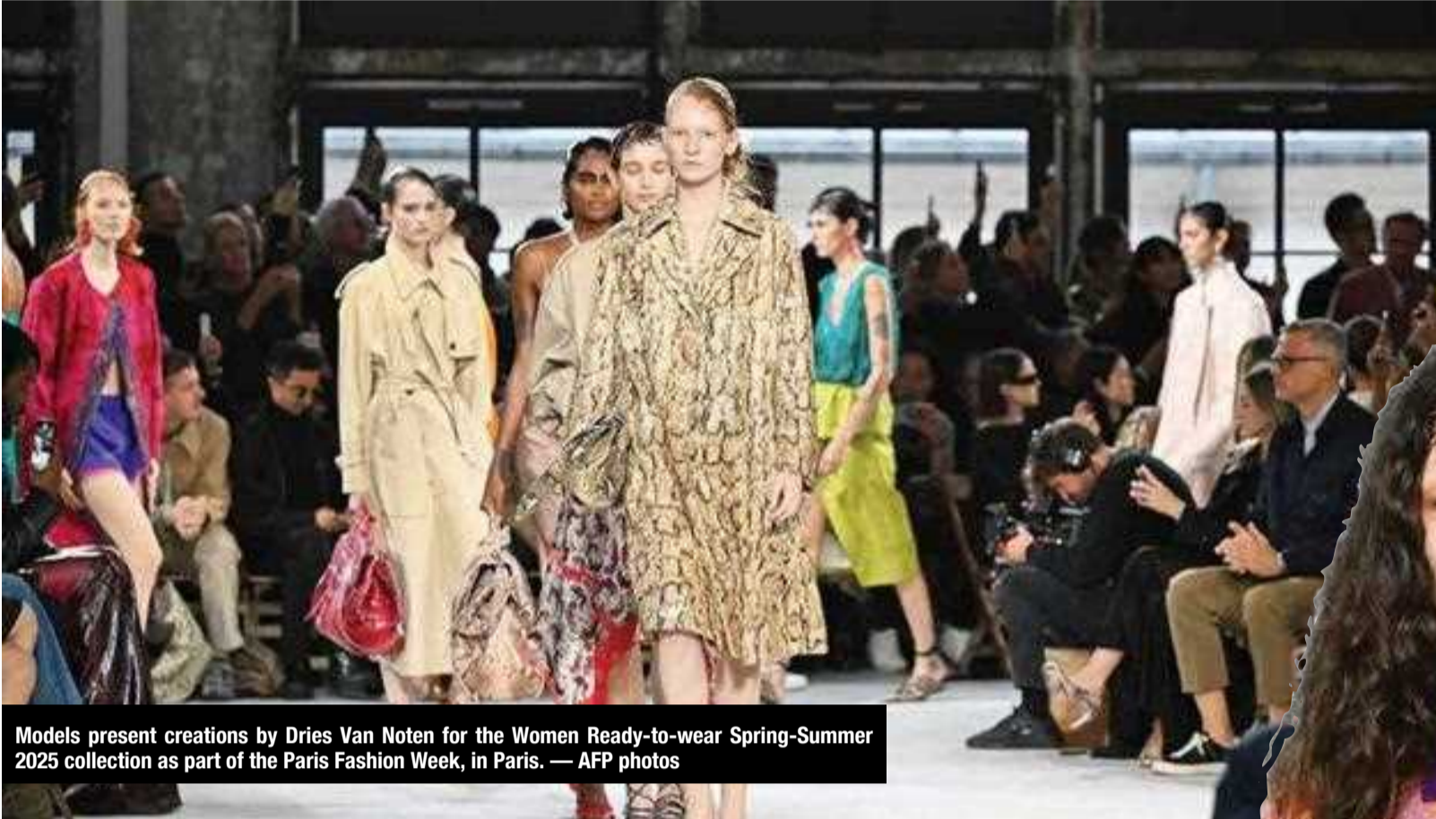
Models present creations by Dries Van Noten for the Women Ready-to-wear Spring-Summer 2025 collection as part of the Paris Fashion Week, in Paris.