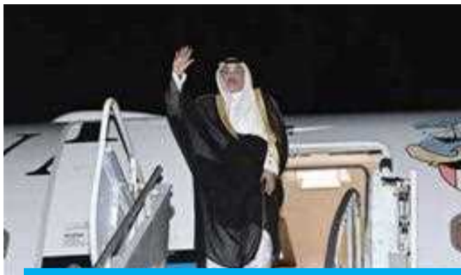
Representative of His Highness the Amir Sheikh Mishal Al-Ahmad Al-Jaber Al-Sabah, His Highness the Crown Prince Sheikh Sabah Khaled Al-Hamad Al-Sabah, leaves New York after participating in the meetings of the 79th session of the United Nations General Assembly.