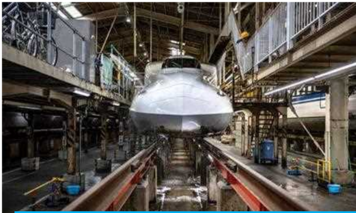
TOKYO: Staff members cleaning the front of a train at the JR Central Shinkansen depot in the Shinagawa district of Tokyo.