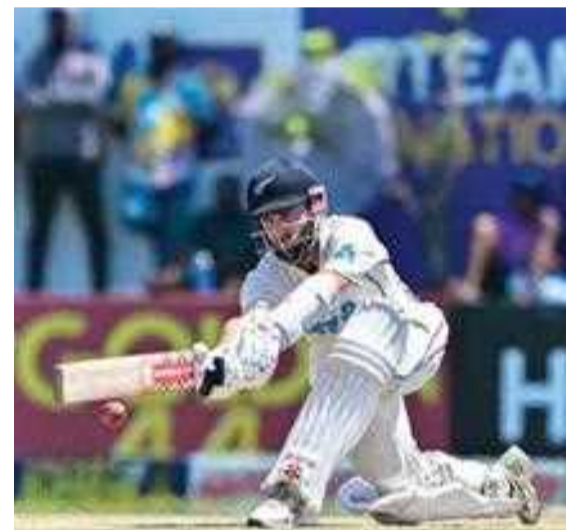
GALLE: New Zealand's Kane Williamson plays a shot during the third day of the second Test cricket match between Sri Lanka and New Zealand at the Galle International Cricket Stadium in Galle.

"I love bowling in Galle," he said. "But that milestone looks out of reach now. Obviously when you have runs on the board you can dictate terms like we did today," he added. "We will be delighted with a series win." Resuming at a precarious 22-2 in their first innings, New Zealand's batsmen barely put up a fight and their highest partnership was the 20 added by last pair Mitchell Santner, who top scored with 29, and William O'Rourke (two).