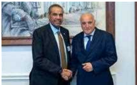
NEW YORK: Kuwaiti Minister of Foreign Affairs Abdullah Al-Yahya met with his Algerian counterpart Ahmed Attaf on the sidelines of the UN General Assembly's 79th session in New York late Friday.

US Secretary of State Antony J Blinken said that the recent events show that the Middle East and the world are facing a precarious moment. "The events of the past week and the past few hours underscore what a precarious moment this is for the Middle East and for the world," he told a press conference in New York. He added that the choices that all parties make in the coming days would determine which path this region is on with profound consequences for its people, now and possibly for years to come.