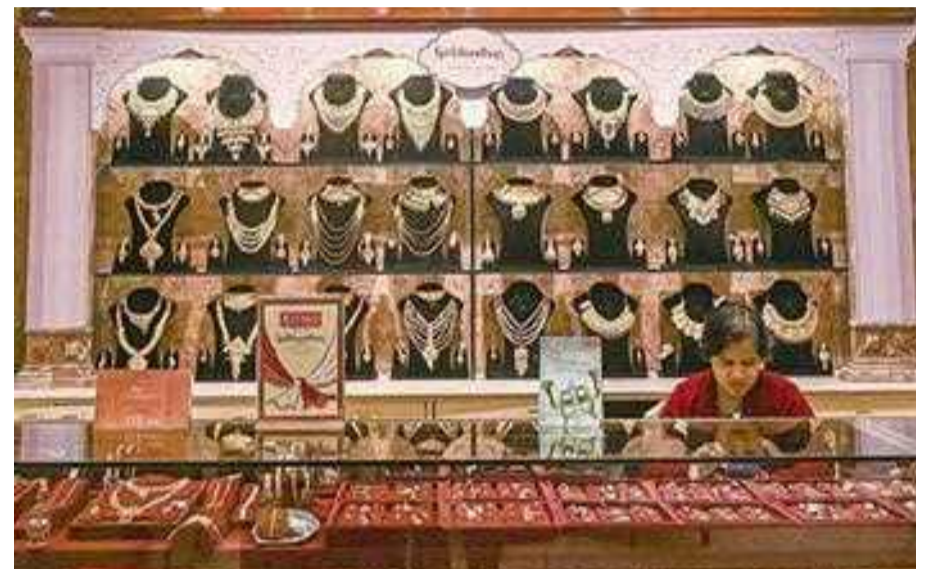
KOLKATA: Gold jewelry kept on display inside a shop in Kolkata in this file photo.

buyer, China, continues to face a weak gold jewelry market in the context of the country's ailing economy. However, the