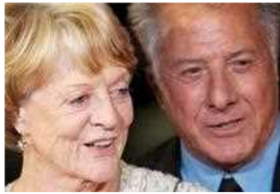
US actor and director Dustin Hoffman (right) poses with British actress Maggie Smith (left) on the red carpet as they arrive to attend the premiere of 'Quartet' during the 56th BFI London Film Festival in London on October 15, 2012.

UK actor Kristin Scott Thomas, who appeared alongside Smith in "My Old Lady" said her co-star "saw through the nonsense and razzmatazz" of acting. "She had a sense of humor and wit that could reduce me to a blithering puddle of giggles. And she did not have patience with fools," she wrote on Instagram.