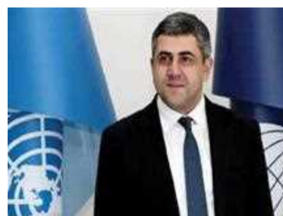
Secretary General of the UN World Tourism Organization (UNWTO) Zurab Pololikashvili

He explained that the tourism sector in the area is vital for global tourism considering the last agreement between Saudi Arabia and UNWTO to support tourism education in its universities and develop courses online by the organization, which includes more than 30,000 students worldwide, as a clear example of the region's commitment to boost the sector. He praised Saudi Vision 2030, which aims to