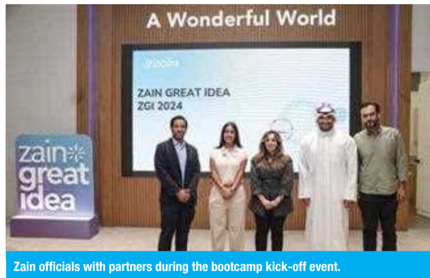
Zain officials with partners during the bootcamp kick-off event.

Intensive bootcamp features workshops, training programs, and one-on-one mentoring sessions