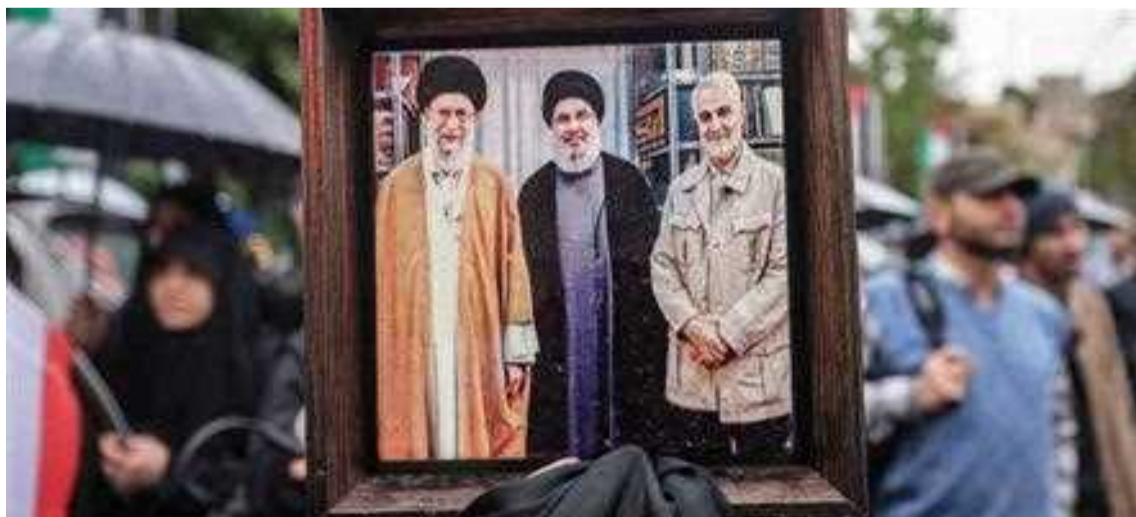
TEHRAN: A demonstrator holds a framed picture depicting (left to right) Iran's Supreme Leader Ali Khamenei; late Lebanese Hezbollah leader Hassan Nasrallah; and Iran's Islamic Revolutionary Guard Corps' (IRGC) Quds Force commander late Qasem Soleimani.

"We're still waiting for him to come out on the televi-