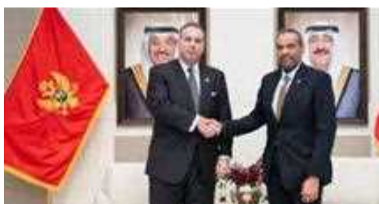
Kuwait Minister of Foreign Affairs Abdullah Al-Yahya receives Montenegrin counterpart Dr Filip Ivanovic on the sidelines of the 79th session of the UN General Assembly.