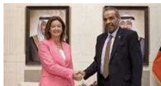
Kuwait's Minister of Foreign Affairs Abdullah Al-Yahya met on Friday with Slovenian counterpart Tanja Fajon on the sidelines of the 79th session of the UN General Assembly in New York.