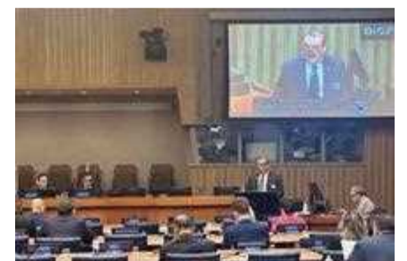
Minister of Health Dr Ahmad Al-Awadhi is seen delivering a speech at a high-level meeting on antimicrobial resistance.

NEW YORK: Kuwait has developed a national action plan to combat antimicrobial resistance based on a strong multi-sectoral approach on the "One Health" principle, Health Minister Dr Ahmad Al-Awadhi said. This came in a speech delivered by Al-Awadhi during a high-level meeting on antimicrobial resistance held as part of the activities of the high-level week of the 79th session of the United Nations General Assembly.