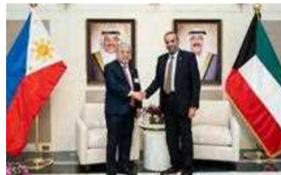
Kuwaiti Minister of Foreign Affairs Abdullah Al-Yahya meets with his Philippine counterpart Enrique A Manalo on the sidelines of the 79th session of the UN General Assembly.