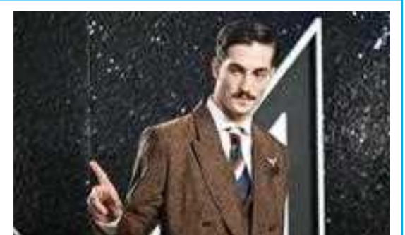
Italian singer Damiano David from band Maneskin arrives to attend the MTV Video Music Awards at UBS Arena in Elmont, New York, on September 11, 2024.

"I naturally chose it as the start of this new chapter in my artistic life, and I sincerely hope that people are ready to take this journey with me."