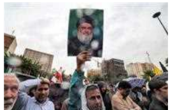
TEHRAN: A demonstrator stands in the rain holding up a picture of late Lebanese Hezbollah leader Hassan Nasrallah during an anti-Zionist protest in Tehran's Palestine Square on Sept 28, 2024.