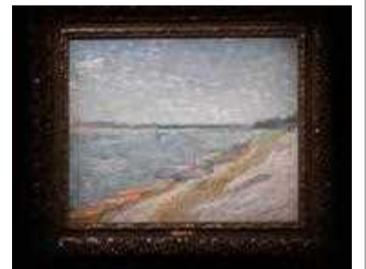
This photo shows the painting "Les canots amarres" by Vincent Van Gogh from 1887, at Christie's in Hong Kong which is set to break a record for the most expensive painting sold in Asia if the work fetches its US$50 million estimate at an auction in their new Asia Pacific headquarters at the Henderson Centre in Hong Kong on Septem-

A Vincent van Gogh painting displaying the artist's shift from dark realism to vibrant impressionism sold for US$32.2 million at a Hong Kong auction, falling short of expectations that it would fetch a record-breaking price.