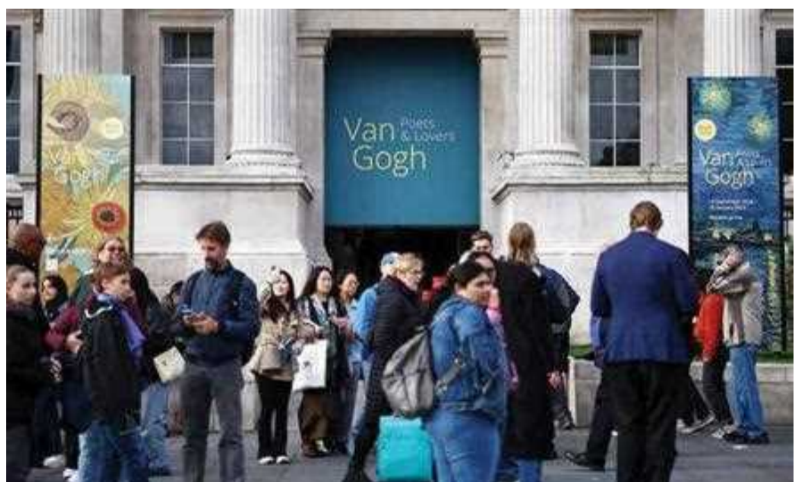
Members of the public queue to enter the Van Gogh: Poets & Lovers exhibition at the National Gallery in Central London.

JSO activists were also arrested as they intended to protest at King Charles III's coronation in May last year. The group called the detentions "massive authoritarian overreach".—AFP