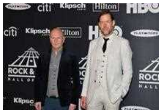
Philip Selway (left) and Ed O'Brien of Radiohead attend the 34th Annual Rock & Roll Hall of Fame Induction Ceremony at Barclays Center on March 29, 2019 in New York City.