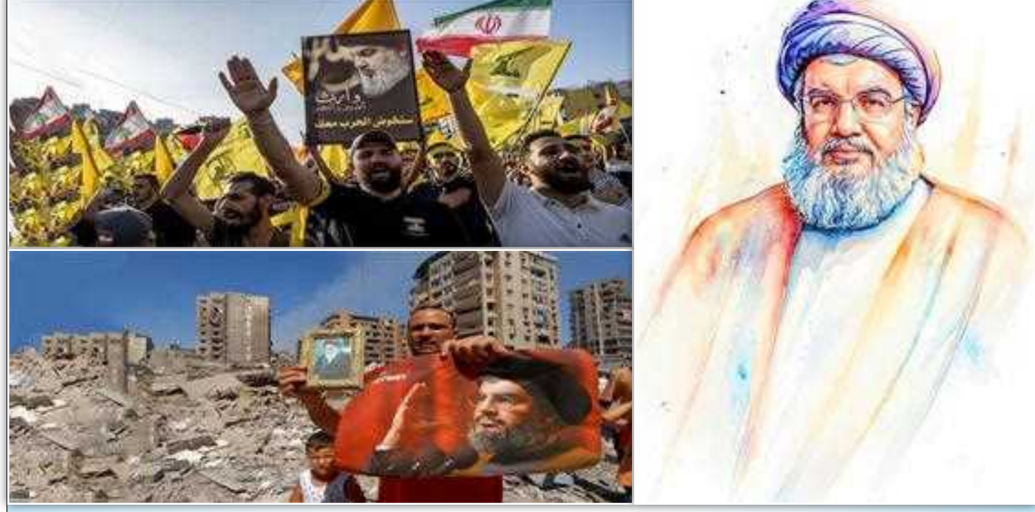
This combination of pictures shows a sketch of Sayyed Hassan Nasrallah as well as Lebanese youths mourning the Hezbollah chief and a man holding his picture over the rubble of buildings targeted in Israeli bombings in Beirut's Zahiyeh.

Ayatollah Khamenei Declares 5 Days of National Mourning Leader: Nasrallah's Blood Will Strengthen Resistance