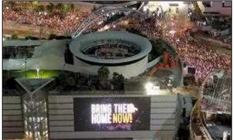
Protest held against Zionist prime minister Benjamin Netanyahu in Tel Aviv.

Following the tightened directives, the Zionist regime's Premier League's Saturday and Sunday football matches were decided to be held behind closed