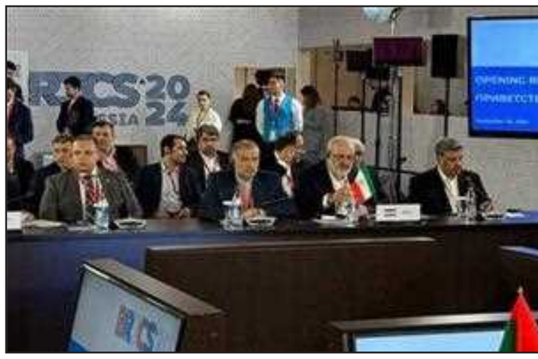
Iranian Minister of Energy Abbas Aliabadi attended the Russian 'Energy Week international forum' in Moscow.

TEHRAN – Iranian Minister of Energy Abbas Aliabadi has suggested the connection of Russia's power grid to Arab countries via Iran.