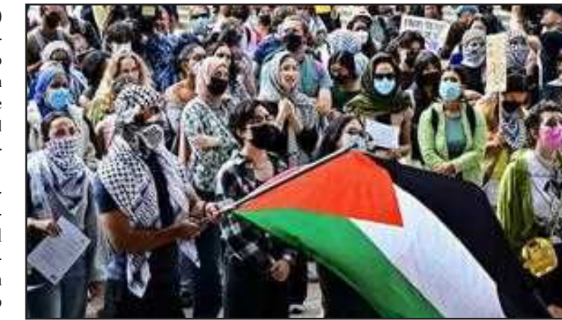
European, Arab and Islamic nations have launched an initiative to strengthen support for a Palestinian state, Norway's foreign minister says.

But even if the puzzle is completed, it's unlikely to gain traction with prime minister Benjamin Netanyahu. Still, Eide