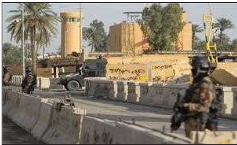
Iraqi security sources said a series of rockets targeted a U.S. base in the Iraqi capital, Baghdad, on Tuesday morning.

BAGHDAD (Dispatches) – The Islamic Resistance in Iraq has launched a series of rockets targeting a U.S. base in the Iraqi capital, Baghdad.