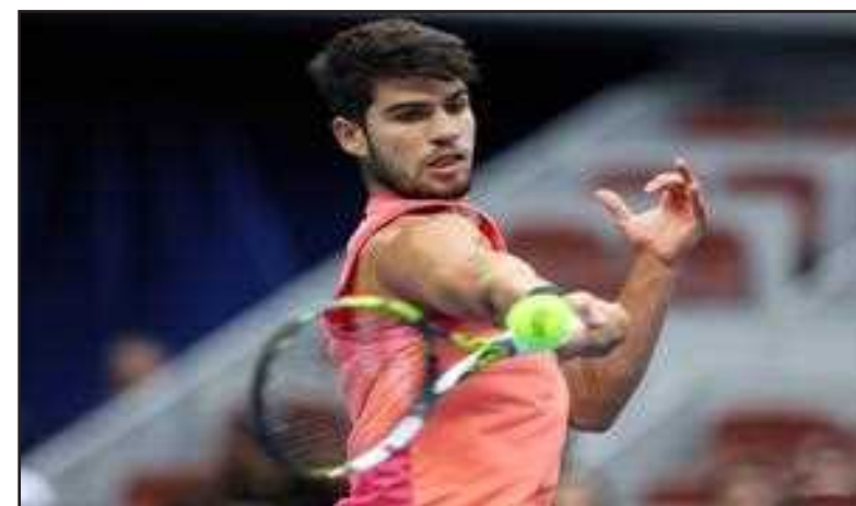
Carlos Alcaraz of Spain hits a return during the men's singles quarterfinals against Karen Khachanov of Russia.

BEIJING (Reuters) - Second-seeded Carlos Alcaraz of Spain will confront Russia's Daniil Medvedev after beating another Russian player Karen Khachanov in the men's singles quarterfinals of the China Open, while Magda Linette of Poland upset the third seed Jasmine Paolini of Italy.