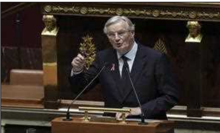
France's Prime Minister Michel Barnier delivers a speech at the National Assembly, in Paris, Tuesday, Oct. 1, 2024.

PARIS (AP) - New French Prime Minister Michel Barnier warned Tuesday that "colossal" and spiraling debts are a "sword of Damocles" hanging over the finances of the European Union's second-largest economy and announced belt-tightening and more taxes to reverse the trend.