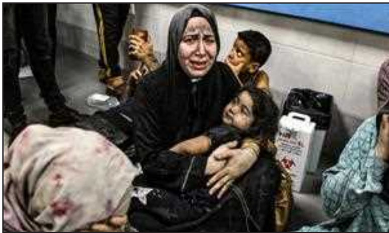
Study shows over 17,000 women and children killed in Gaza, surpassing past conflict records.

AOAV's findings point to the widespread destruction of homes, shelters, schools, hospitals, and critical aid distribution centers. This unrelenting assault has left