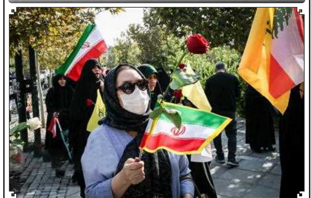
Iranian women gathered in solidarity with Lebanese people in Melat Park, Tehran on Oct.1, 2024.