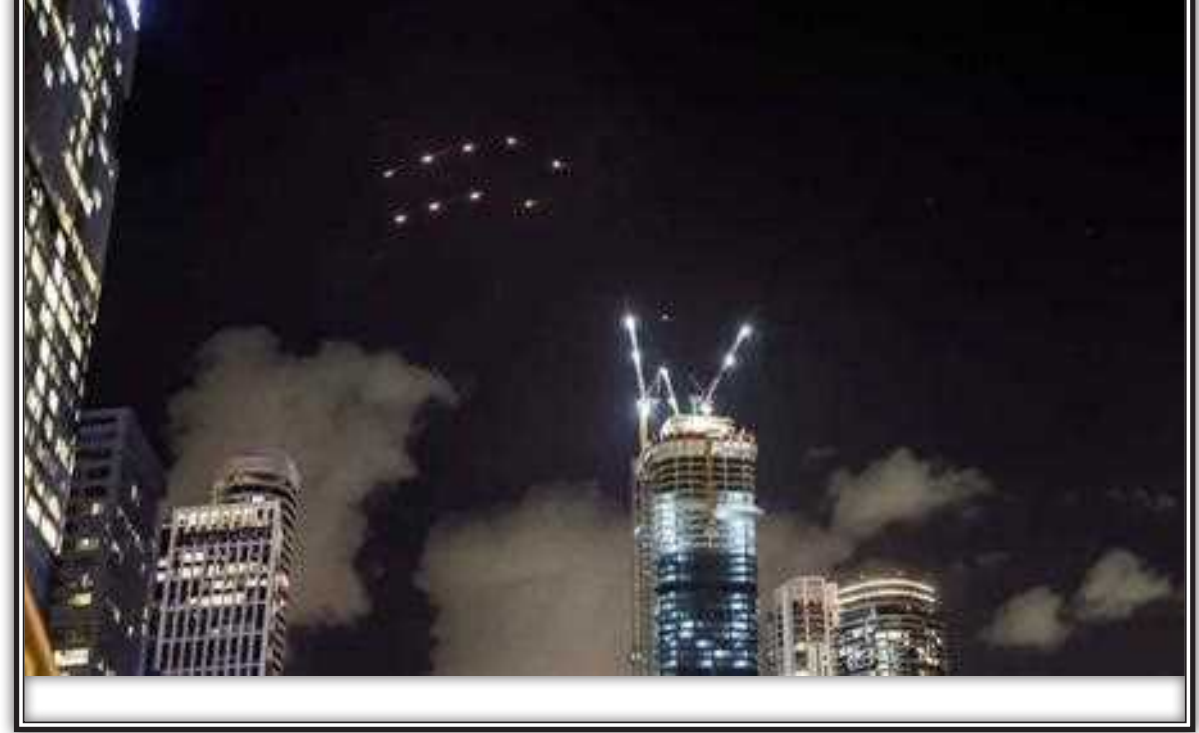
Iran launches hundreds of missiles at the Israeli-occupied lands.

TEHRAN – Iran launched hundreds of missiles at the occupied lands on Tuesday evening, confirmed by the local Israeli media. In an official statement, the Islamic Revolution Guards Corps (IRGC) announced that it has targeted the heart of the occupied territories in response to the martyrdom of the Hamas political chief Ismail Haniyeh, Hezbollah chief Sayyed Hassan Nasrallah, and top Iranian commander Brigadier General Abbas Nilfroushan.