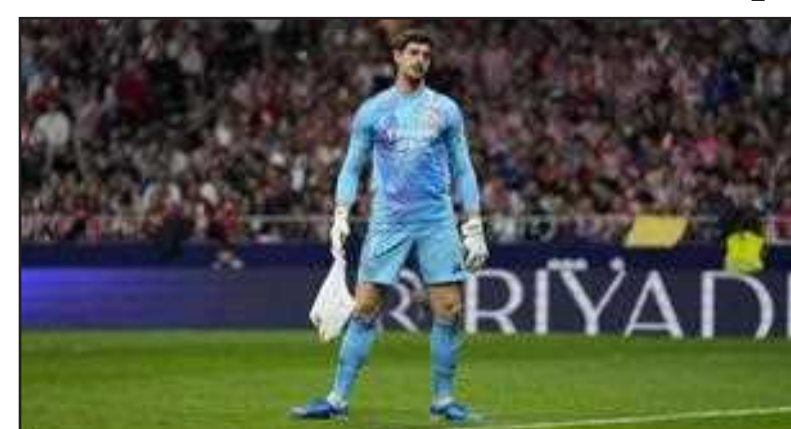
Real Madrid's goalkeeper Thibaut Courtois

Courtois was hurt in the 1-1 draw at Atletico Madrid in