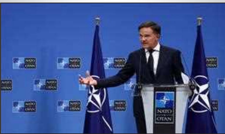
Mark Rutte being unveiled as NATO's new Secretary-General

BRUSSELS (Reuters) - NATO's new chief Mark Rutte voiced strong support for Ukraine on Tuesday and said he was not worried about the upcoming U.S. election as he could work with former president Donald Trump or Vice President Kamala Harris.