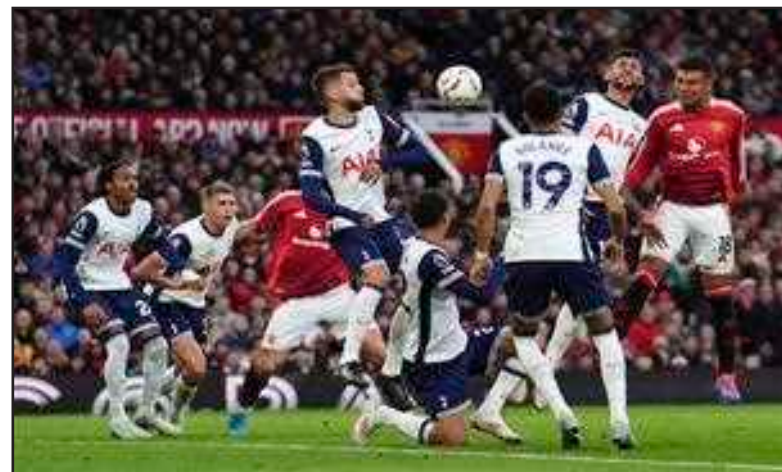
Manchester United's Casemiro, right, heads the ball during the English Premier League soccer match between Manchester United and Tottenham Hotspur at Old Trafford stadium.

MANCHESTER (Reuters) - Tottenham Hotspur's Brennan Johnson, Dejan Kulusevski and Dominic Solanke got on the scoresheet in a 3-0 victory over 10-man Manchester United in the Premier League as the visitors ran roughshod over the bedraggled Old Trafford side.