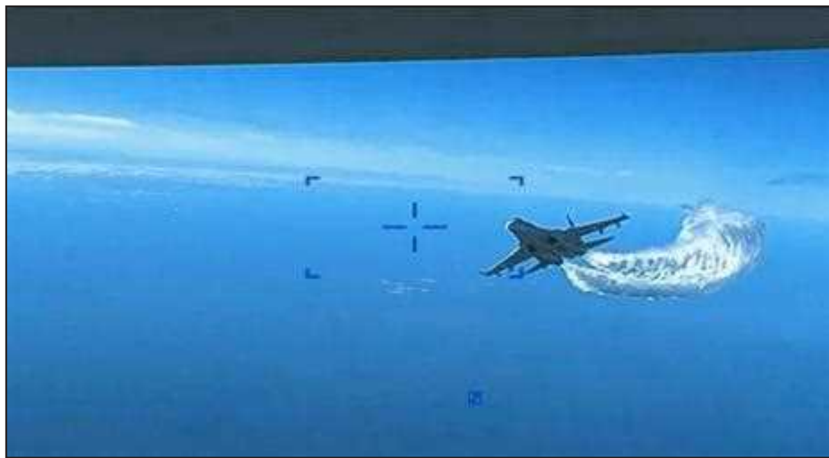
This photo shows a Russian Su-27 approaching the back of the MQ-9 drone and beginning to release fuel as it passes, over the Black Sea.

MOSCOW (Dispatches) - Russia must prepare for a long confrontation with the United States and has sent repeated warnings to Washington over the crisis in relations, Deputy Foreign Minister Sergei Ryabkov was quoted as saying on Tuesday.