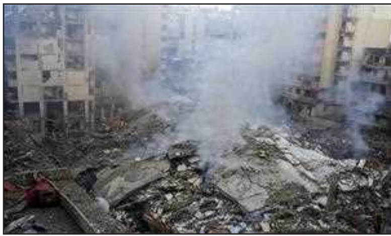
Smoke rises from the site of a Zionist airstrike in Beirut's southern suburb, Lebanon, Tuesday, Oct. 1, 2024.

"What we see on the ground is more than a million of displaced persons. A land offensive ... that we are strongly calling on all sides to restrain from it, protect civilians, and not to go further in escalation of the war," Fajon told Anadolu, during her Berlin visit.