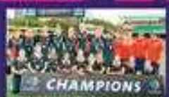
2009 in England - ENG Women