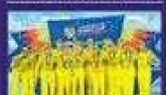
2023/24 in SA - AUS Women