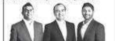
Team at WIS (left to right) WIS Managing Director - Colombo and Director WIS (Sri Lanka) Director - Kandy, WIS Managing Director - Nuwara-Eliya.

WIS Accountancy, a leading provider of digital accounting, tax, and advisory services, has launched its AI-driven mortgage platform 'MortgagX' and announced a major job expansion. The platform is designed to streamline the mortgage process, offering a seamless and efficient experience for both borrowers and lenders. The expansion includes the recruitment of 200 new staff members across various branches, reflecting the company's commitment to growth and excellence in the financial services sector.