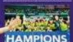
2020/21 in AUS - AUS Women