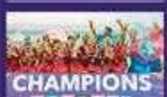
2015/16 in IND - WI Women