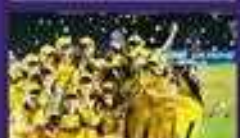
2012/13 in SL - AUS Women