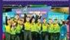
2018/19 in WI - AUS Women