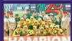
2013/14 in BAN - AUS Women