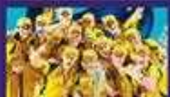
2010 in WI - AUS Women