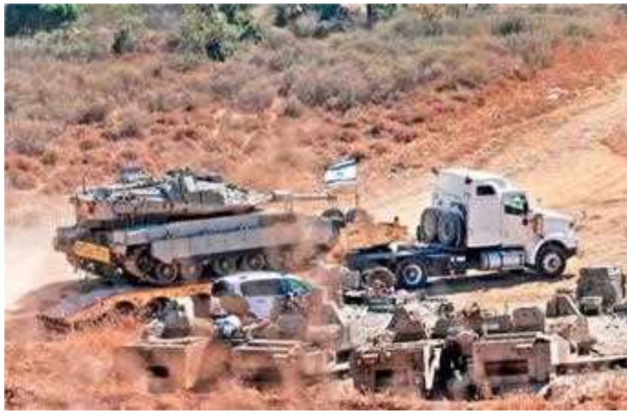
An Israeli tank is transported to a position in the Upper Galilee region of northern Israel near the border with Lebanon, on Sunday.

The Israeli military said on Sunday the strike that killed Nasrallah also "eliminated" more than 20 other members of the Lebanese armed group. "More than 20 other terrorists of varying ranks, who were present at the underground headquarters in Beirut located beneath civilian buildings, and were managing Hezbollah's terrorist operations against the state of Israel, were also eliminated," the military said in a statement that listed some of them.