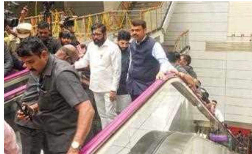
Maharashtra chief minister Eknath Shinde with his deputy Devendra Fadnis during the inauguration of the southern extension of Pune Metro Phase-1 by Prime Minister Narendra Modi on Sunday. ■ Report on Page 4

A Raj Bhavan release later said the subject allocation and designation of the newly-sworn ministers were approved by the governor on the recommendation of the chief minister. Mr Balaji, who was recently granted bail by the Supreme Court in a money laundering case, returns to electricity, prohibition and excise portfolios that he was holding earlier. Mr Balaji had spent 471 days