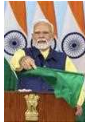
Prime Minister Narendra Modi during the inauguration of various projects in New Delhi.

As the monthly radio broadcast Mann Ki Baat completes 10 years, Prime Minister Narendra Modi on Sunday asserted that the radio broadcast has shown that people like positive developments and inspiring and encouraging stories. He called the listeners of the radio show the "real anchors". Describing the latest episode as an "emotional" episode, Mr Modi said the programme has become a unique platform that celebrates the spirit of India and showcases the collective strength of the nation.