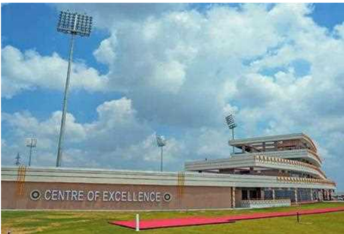
View of newly-inaugurated National Cricket Academy (NCA), named BCCI Centre of Excellence, on the outskirts of Bengaluru on Sunday. — PTI

India are leading the two-match series 1-0, having won the Chennai Test by 280 runs. — PTI