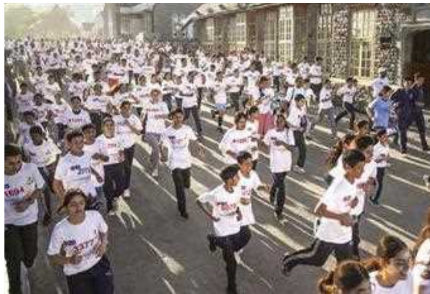
People take part in a half marathon organised by Himachal Pradesh police at Ridge in Shimla on Sunday.

"North Bengal is under flood. Many districts like Cooch Behar, Jalpaiguri and Alipurduar have been affected," the CM said while leaving for Siliguri on Sunday afternoon. "Different areas in Bihar, Malda and Dakshin Dinajpur districts of Bengal will be affected in the near future due to heavy rain in catchment areas of the Koshi river in Nepal following the release of five cusec water. The same thing recently happened when water was released from the Damodar Valley Corporation," the CM added. "The TMC supremo also trained her guns on the Narendra Modi government. "The Centre is not discharging its role to help the state fight against the natural calamities. It has not taken up the maintenance work of Farakka Barrage for the last 20 years. As a result, its water-bearing capacity has reduced to a great extent despite our repeated reminders."