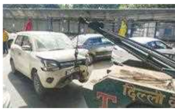
A damaged car that was involved in an accident outside Nangloi police station in New Delhi on Sunday.

A purported video of the incident surfaced on social media. As per the footage, two men on