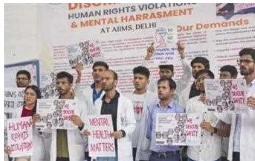
AIIMS students stage a protest to highlight their ongoing struggle for justice and resolution of strike-related concerns at Jantar Mantar in New Delhi on Sunday.

Additionally, 3,12,541 notices for red light violations were issued till September 15 this year against 5,90,227 in 2023 and 10,11,028 in 2022, the data stated.