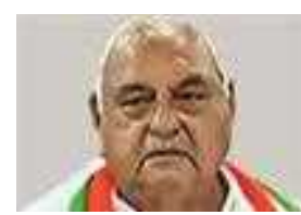
Bhupinder Singh Hooda

After a decade of being out of power in Haryana, former chief minister Bhupinder Singh Hooda is making a concerted bid for power. Speaking to The Asian Age, Mr Hooda said that the Haryana Assembly elections will end the BJP's "divisive" politics and shatter the arrogance of the saffron party leaders.