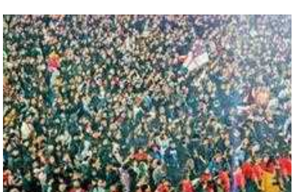
Participants at a world record attempt for the largest mass Haka in Auckland on Sunday.