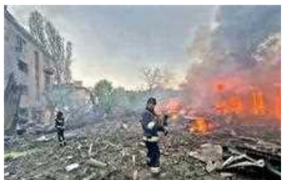
Firefighters put out the fire after Russia attacked the city with guided bombs overnight in Zaporizhzhia, Ukraine, on Sunday. — AP

He posted pictures from the sites of the attacks, showing charred cars, a hole blown through a residential building, and rescuers battling fires. — Reuters