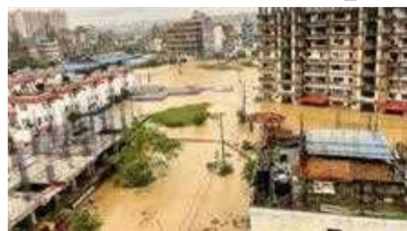
A flood-affected area following heavy rainfall in Kathmandu on Sunday.

Kathmandu, Sept. 29: The death toll from rain-triggered floodings and landslides across Nepal climbed to 170 on Sunday, the police said. Large swathes of eastern and central Nepal have been inundated since Friday, with flash floods reported in parts of the country.