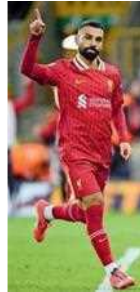
Liverpool's Mohamed Salah celebrates scoring against Wolverhampton during their EPL match at the Molineux Stadium in Wolverhampton on Saturday.

The only concern for Slot was a late injury to Andrew Robertson that forced the Scotland left-back to limp off.