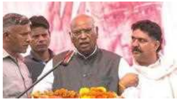
Congress president Mallikarjun Kharge during a public rally in Jasrota, Jammu and Kashmir, on Sunday.

Jasrota/Jammu, Sept. 29: Asserting that the Congress will fight for the restoration of statehood to Jammu and Kashmir, party president Mallikarjun Kharge on Sunday said he will not die until Prime Minister Narendra Modi is removed from power. Mr Kharge, who became unwell while addressing a poll rally in Kathua district, made the remarks after getting medical assistance.