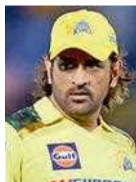
Mahendra Singh Dhoni

Bengaluru, Sept. 29: The 10 IPL franchises will be allowed to retain a maximum of six players from their previous squads, including usage Right To Match (RTM) card at the auction that will cost ₹75 crore out of an enhanced team purse of ₹120 crore, the IPL governing council decided on Saturday.