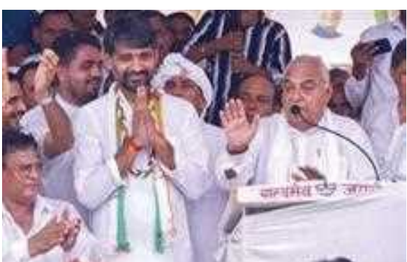
Congress leader Bhupinder Singh Hooda during a public meeting in Haryana's Bhiwani district.

The Congress has guaranteed a monthly pension of ₹6,000 for the elderly, disabled, and widows. We have promised to reinstate the old pension scheme and offer gas cylinders for ₹500. Women aged 18 to 60 will receive ₹2,000 monthly. The party promised to "secure the future of the youth" and we are commit-