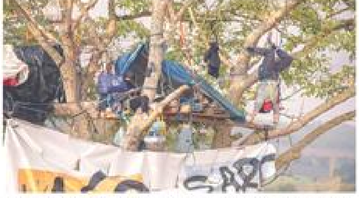
VERPEIL: Opponents of a motorway, who call themselves "agorrets", hang from a tree during an operation by military police to clear the site in south-western France, on Monday. Operations to evacuate a property that has become the last stronghold of opponents of the Toulouse-Castels motorway have been going on since Sept 17.