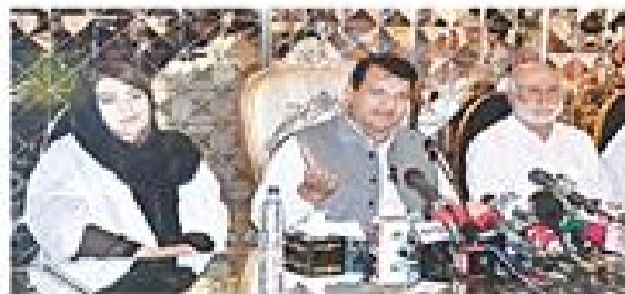
Asim Muqam addresses a presser in Peshawar on Monday.

PESHAWAR: Federal Minister for Kashmir Affairs and Gilgit-Baltistan Asim Muqam has accused the Khyber Pakhtunkhwa government of using the official resources on political rallies and failing to curb the growing terror attacks in the province. Addressing a press conference here on Monday, Mr Muqam, who is also provincial president of Pakistan Muslim League-Nawaz, said the KP people are persecuted of law enforcement agencies had rendered meritless sacrifices in the war against terrorism but the provincial government was least bothered to take effective measures for main-