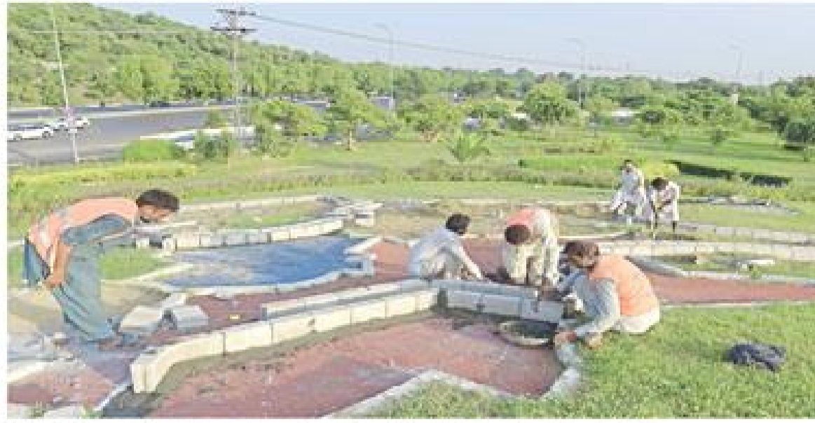
LABOURERS carry out renovation work on a greenbelt near Zero Point Interchange in Islamabad.