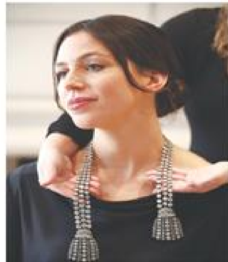
LONDON: A gallery assistant poses wearing an 18th century diamond jewel necklace, weighing approximately 300 carats, at a press preview at Sotheby's. This necklace is estimated to fetch £1.2-£2.1 million at auction in Geneva on Nov 11.