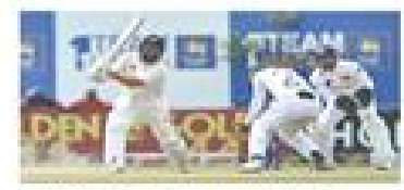
Five-star Jayasuriya leads SL to victory in first New Zealand Test Pg.20 SPORT