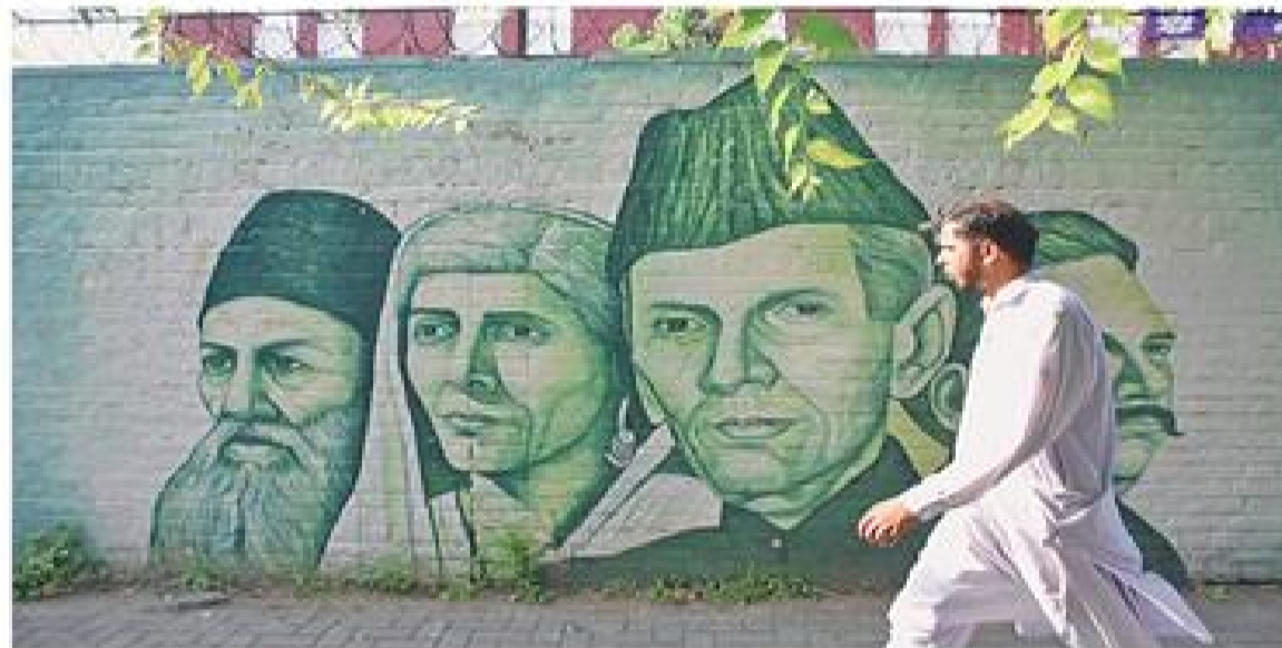
A MAN walks by murals of national heroes painted on a wall in F-6 sector in Islamabad.

He said under the package, apart from other agricultural benefits, about 512 tractors will be given to farmers in Rawalpindi division.