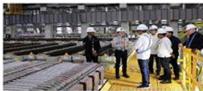
INDONESIAN President Joko Widodo visits a new copper smelting plant in Jawa, on Monday.