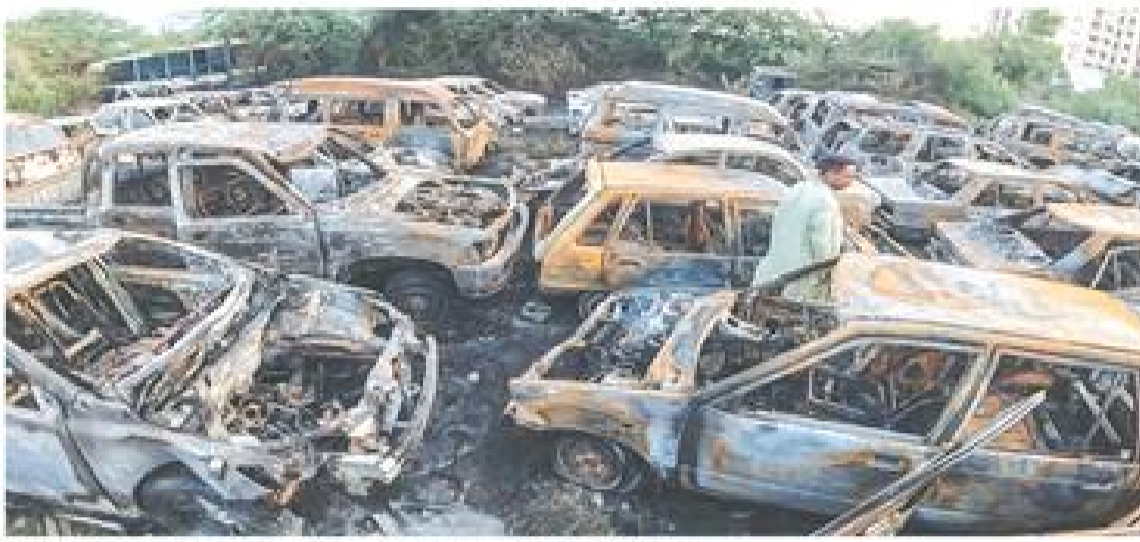
A MAN looks at charred vehicles in Clifton, on Monday.

The police were further investigating the case, he added.