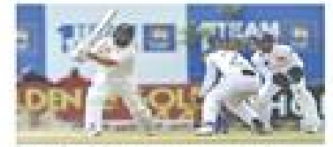
Five-star Jayasuriya leads SL to victory in first New Zealand Test