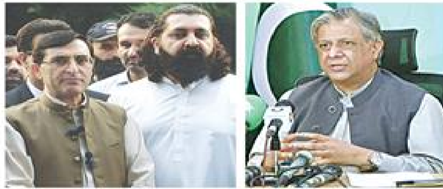
PTI Chairman Barrister Gohar Ali Khan (left) speaks to reporters, while Law Minister Asim Nisbani (right) addresses a press conference following the release of the detailed SC verdict, on Monday.