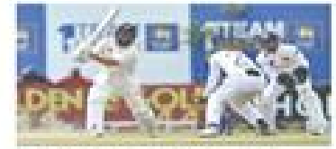
Five-star Jayasuriya leads SL to victory in first New Zealand Test