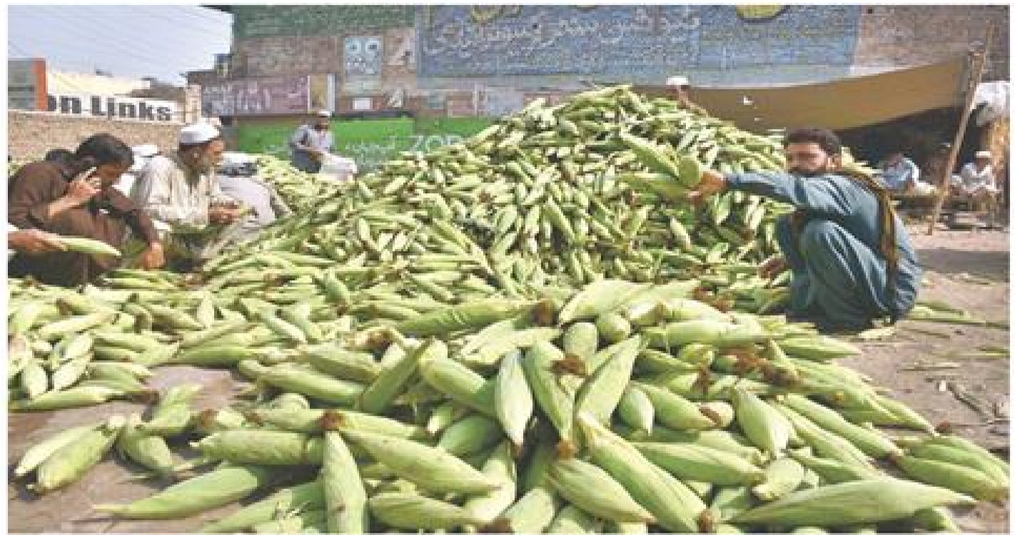
A VENDOR sells corn cobs on the roadside near Laffari Gate, Peshawar.