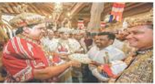
PRESIDENT Anura Kumara Dissanayaka visits the Buddha's Temple of the Tooth in Kandy, on Monday.

"Regardless of the power divisions in the world, we intend to work with other nations to benefit our country," he said, as Colombo-based diplomats watched from the balcony of the presidential office.