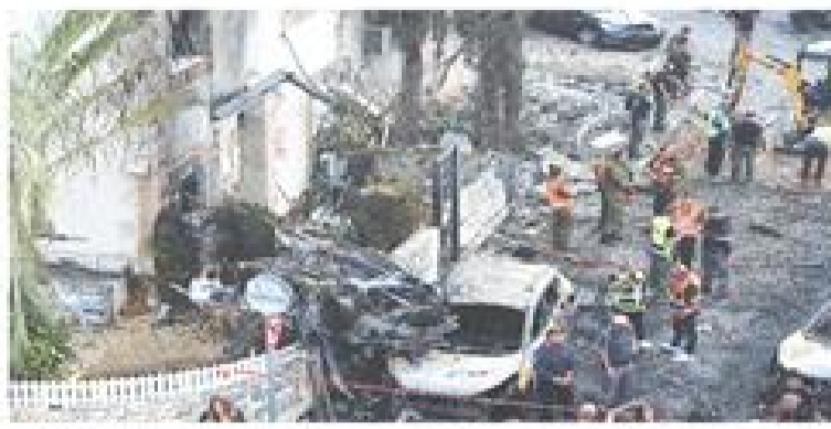
ISRAELI soldiers gather amid debris and charred vehicles in Haifa, following a reported strike by Hezbollah.

On January 2, 2024 Hamas deputy leader Saleh al-Arini was killed in Beirut's souther-