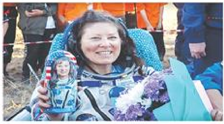
NASA astronaut Tracy Dyson holds a Russian traditional Matryoshka wooden doll depicting her after landing at Dzhezkazgan, Kazakhstan, on Monday.