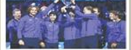
BERLIN: Greece's Stefanos Tsitsipas (second L), Carlos Alcaraz (third L) of Spain, Germany's Alexander Zverev (fourth R) and other players of Team Europe celebrate with the Ueber Cup trophy after their 6-2, 7-5 win over Team World in the final session of the event.

Pakistan, who edged Nepal 3-0 in their opener, face Sri Lanka in their final group game on Wednesday, when Bhutan play Nepal. The top two finishers in the group advance into the semi-finals. —Agencies