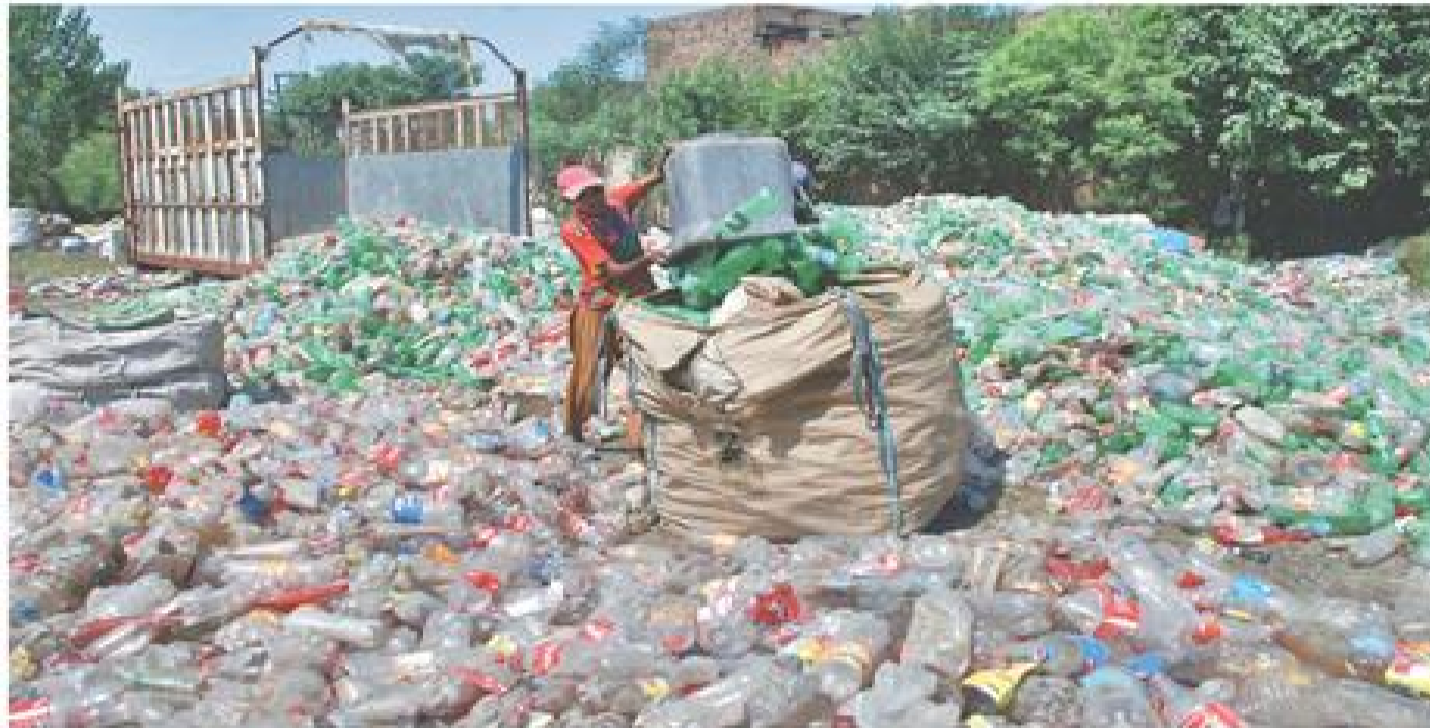
A WORKER sorts used plastic bottles at a parkyard on Northern Bypass, Peshawar, for recycling.

PESHAWAR Sunset 06:11pm Sunrise (Tomorrow) 06:01am NEXT 24 HRS Minimum 26°C Maximum 38°C Outlook Sunny