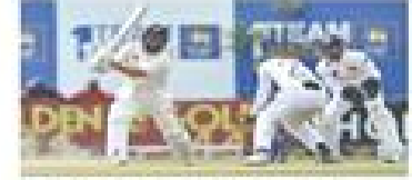
Five-star Jayasuriya leads SL to victory in first New Zealand Test Pg.20 SPORT

ISLAMABAD Sunset 06:05pm Sunrise (Tomorrow) 05:54am NEXT 24 HRS Minimum 28°C Maximum 38°C Outlook Mostly Sunny