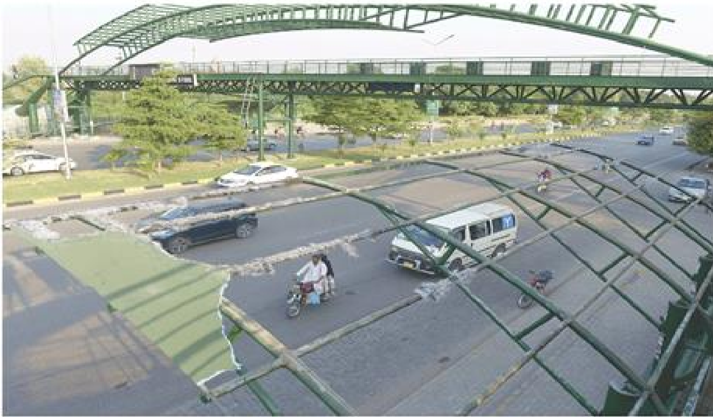
THE shed of the I-8 stop for the Blue Line metro buses along Islamabad Expressway is in urgent need of repairs. It has been over a year since the shed was damaged by protesters but it has failed to catch the eye of the civic authority.