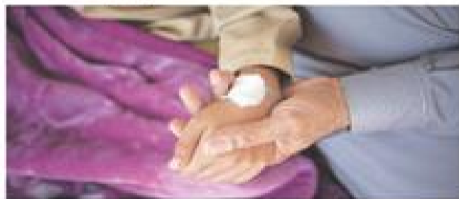
OVERUSE of antibiotics is one of the biggest contributors to drug-resistant bacteria.