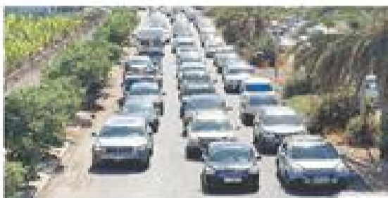
CARs go north from Lebanon's coastal city of Sidon as some Lebanese flee heavy Israeli bombardment, on Monday.

Netanyahu said Israel faced "complicated days" as it stepped up attacks in northern Lebanon and called on Israelis to stay inside as the campaign unfolded. "I promised that we would change the security balance, the balance of power in the north — that is exactly what we are doing," he said in a message following a structural assessment at military headquarters in Tel Aviv.