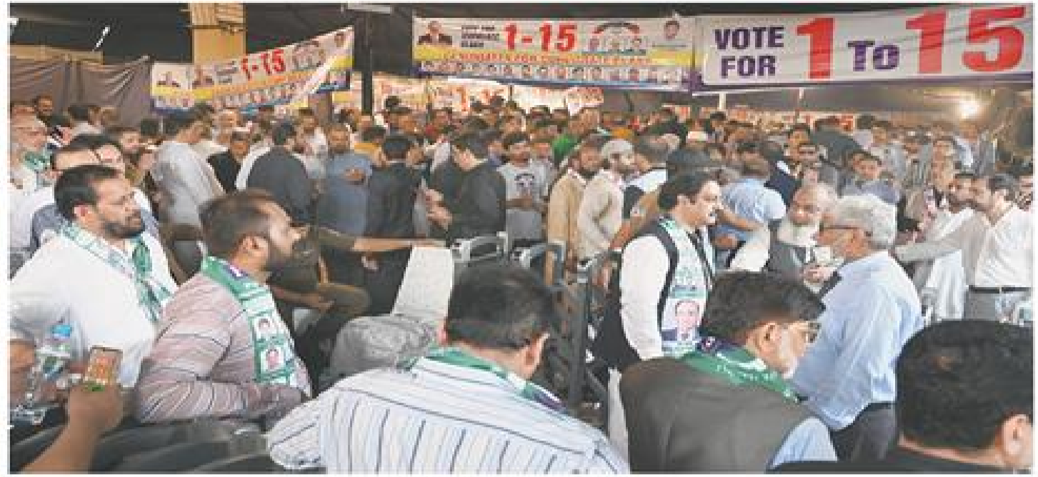
LAHORE: A hustle and bustle at the Lahore Chamber of Commerce and Industry during voting to elect new office-bearers.

A passenger was quoted as saying that there was an engine on fire and some smoke in the cabin for 35 minutes before the plane made an emergency landing, which terrified the passengers.