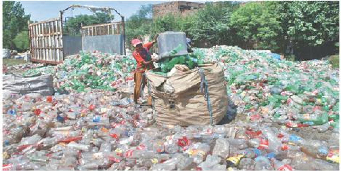
A WORKER sorts used plastic bottles at a junkyard on Northern Bypass, Peshawar, for recycling.

KURRAM: Fierce clashes between rival tribes left five more people dead, raising the death toll from three days of fighting to 10 as 25 others were injured in the Kurram district on Monday. Local residents said that the rival groups used heavy weapons to target each other's positions. According to the police and hospital sources, the clashes erupted after Boshohra tribesmen of Upper Kurram were setting up bunkers on the lands of the Ahmadzai tribe. Later the clashes spread to other areas. So far, 10 people have been killed and 25 others injured in the clashes, they added. They said that the five people were killed in clashes in Balashahai, Soddai, Khair Kalay and other areas, while at least 10 others were injured on Monday. All roads in the region, including the main Parachinar Road, remained closed to traffic due to the fresh clashes. Meanwhile, Majlis-i-Wahdat-i-Muslimeen's MNA Hamid Hussain warned that they would launch a protest movement if the authorities failed to restore peace in the area. He threatened the wife speaking to the people who staged a sit-in outside the Parachinar Press Club to demand immediate steps for the restoration of peace in Kurram district. Meanwhile, Kurram deputy commissioner Javedullah Mehsud said that the administration had initiated talks between the warring tribes through a jirga to resolve the dispute. He said that the jirga members and tribal elders had also been sent to the troubled areas to prevent further clashes.