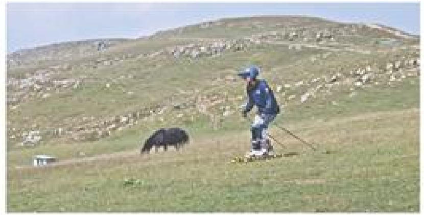
SKIERS in action on the first day of Third National Grass Skiing Championship in Toli Peer on Monday.