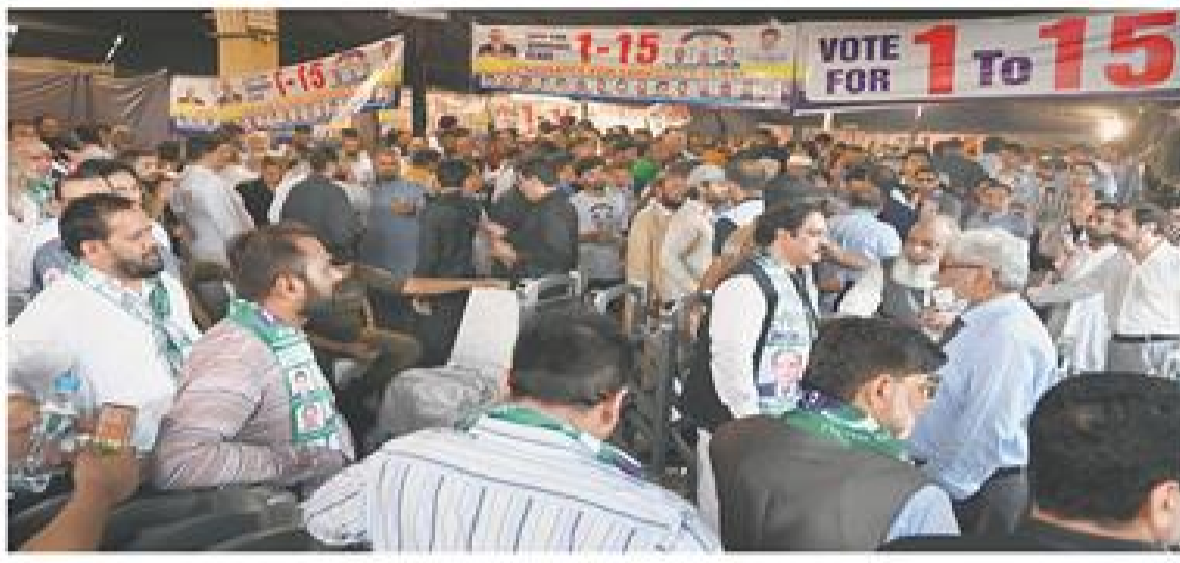
A HUSTLE and bustle at the Lahore Chamber of Commerce and Industry during voting to elect new office-bearers.