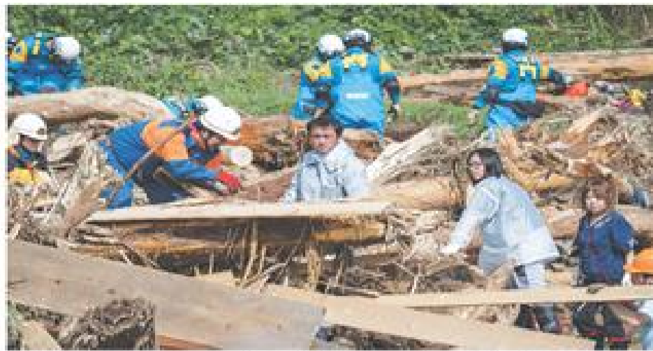
A MAN (center) searches for his missing 14-year-old daughter among debris washed away from flooding along a river following heavy rain in Wakajima, a city in Japan's Ishikawa prefecture, on Monday.—AFP