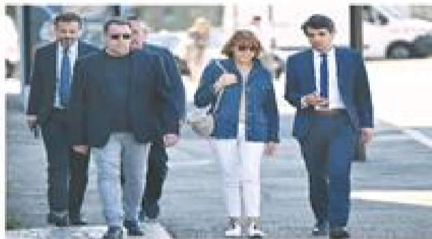
GISELE Pelicot (centre) walks with her son David (second left) and her lawyers as she arrives at a court in Avignon, on Monday.