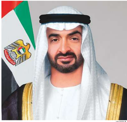
■ Shaikh Mohammad Bin Zayed Al Nahyan begins a state visit to the US today.

The ambassadors said: "The UAE and UAE share enduring security ties and a commitment to a peaceful, stable, and prosperous Middle East. We are working to advance multilateral diplomatic solutions and provide urgently needed humanitarian assistance in Gaza and Sudan. Our ongoing de-