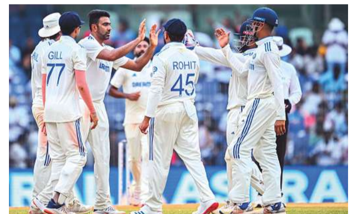
India's Ravichandran Ashwin celebrates with teammates after claiming a Bangladesh wicket in Chennai yesterday.