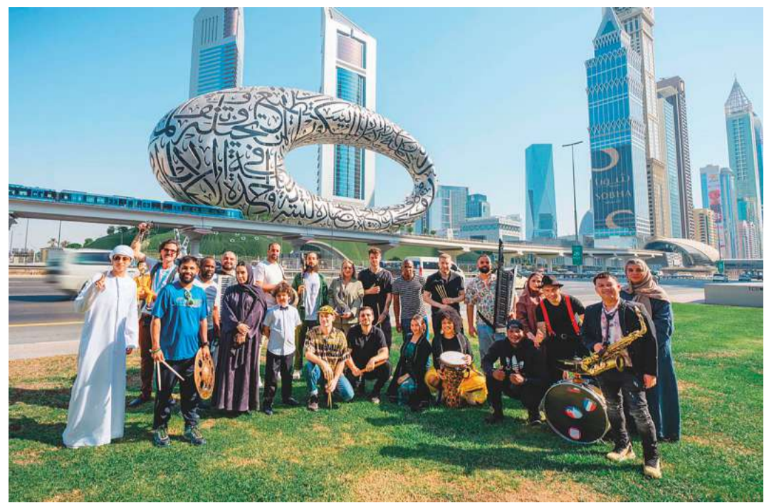
■ Participating musicians at Dubai's Museum of the Future. From string and percussion to wind instruments and creations made from everyday objects, the festival celebrates diversity.

The two-month amnesty began on September 1, allowing people with expired residencies, visas and work permits to reinstate or regularise their residency and apply for jobs, or leave the UAE without fines if they choose.