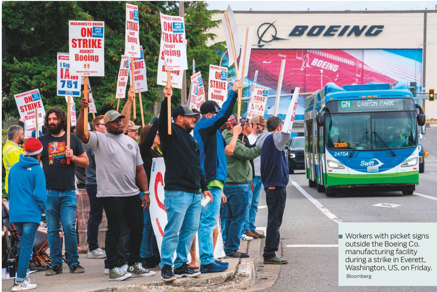
Workers with picket signs outside the Boeing Co. manufacturing facility during a strike in Everett, Washington, US, on Friday.

WORKERS AT SEATTLE MANUFACTURING HUB VOTE AGAINST 25% PAY RAISE