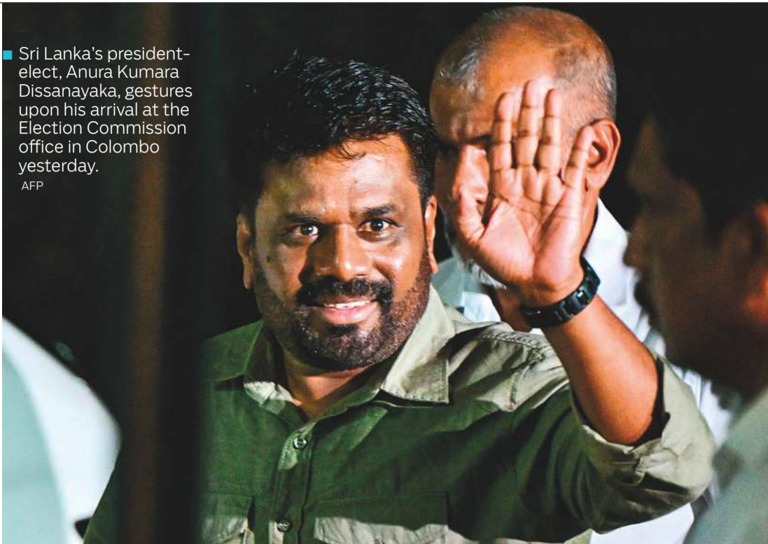
Sri Lanka's president-elect, Anura Kumara Dissanayaka, gestures upon his arrival at the Election Commission office in Colombo yesterday.

The Conservatives will meet next week amid divisive battles for leadership and the direction of the party.