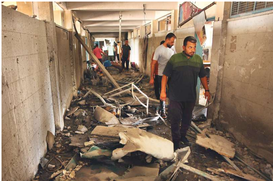
■ Palestinians inspect the damage at the site of an Israeli strike on a school housing displaced Palestinians in Gaza City's Zaytoun neighbourhood on Saturday.

At least 41,391 Palestinians, a majority of them civilians, have been killed in Israel's military