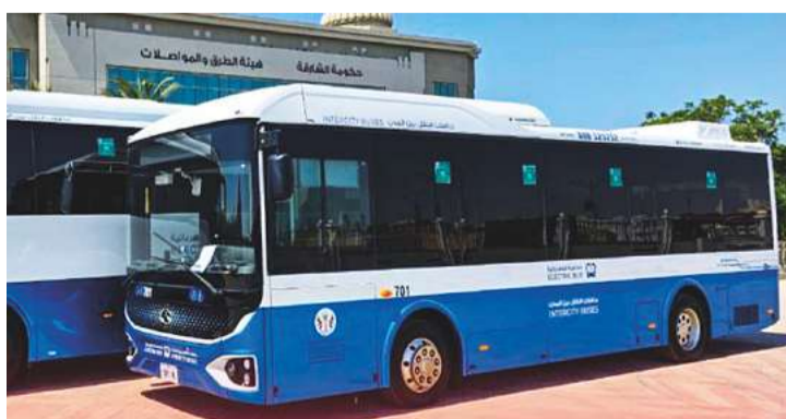
■ Each air-conditioned bus is nine metres long and can carry up to 41 passengers. The buses have a battery cooling system.

The buses come with a range of standard specifications, measuring up to nine metres in