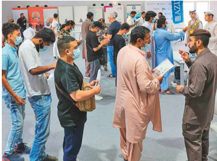
■ The amnesty allows people with expired residencies, visas and work permits to regularise their status or leave without fines.

If the violating worker wishes to join a new employer, the new employer submits a re-