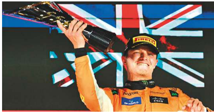
McLaren's British driver Lando Norris celebrates winning the Singapore Grand Prix night race yesterday.

Norris admitted to a couple of scary brushes with the walls on the notoriously tight Marina Bay