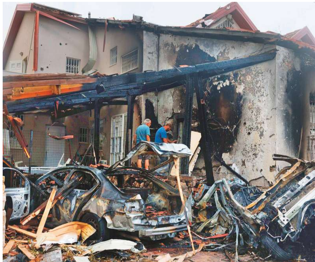
Locals inspect damage to property following missile strikes from Lebanon, on a residential neighbourhood, in Moreshet, northern Israel, yesterday. Hezbollah yesterday launched about 115 rockets, missiles and drones towards vast areas of Israel's north.

UN CHIEF FEARS LEBANON MAY TURN INTO ANOTHER GAZA