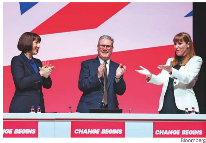
Labour Party's top leaders — Rachel Reeves, Keir Starmer and Angela Rayner — at a party conference in Liverpool, UK. Bloomberg

In the July election, a left-wing alliance called the New Popular Front (NFP) won the most parliamentary seats of any political bloc, but not enough for an overall majority. — AFP