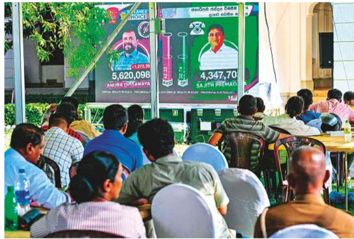
Members of the People's Liberation Front party watch the presidential election results on a screen in Colombo yesterday.

aka on the win and said he was "confident" the politician would "steer Sri Lanka on a path of continued growth and stability."