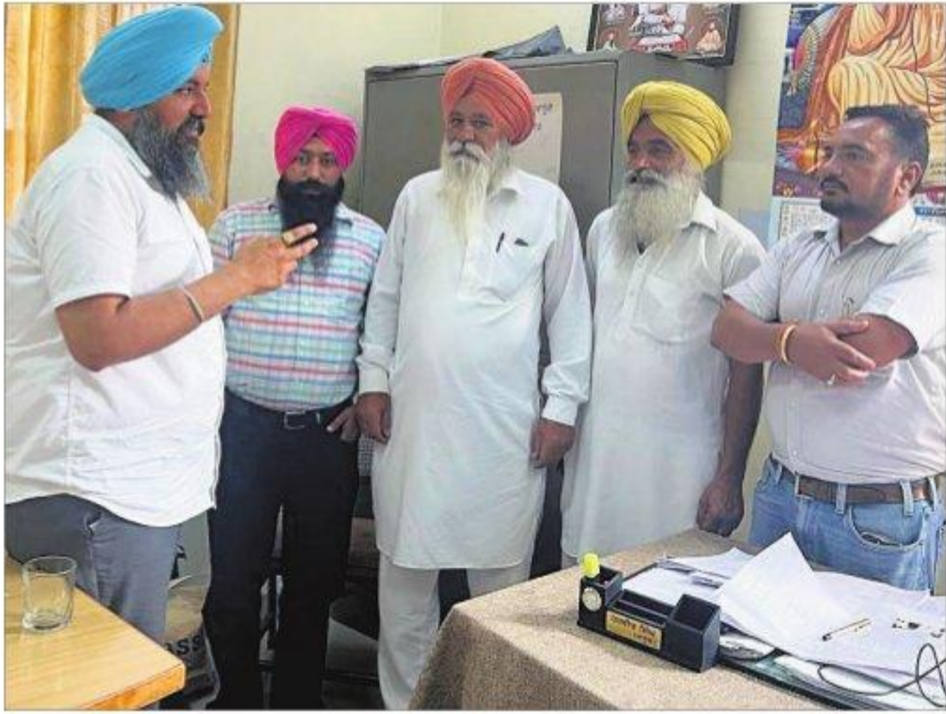
Patwar union president urges revenue officials to participate in the fight against stubble burning.