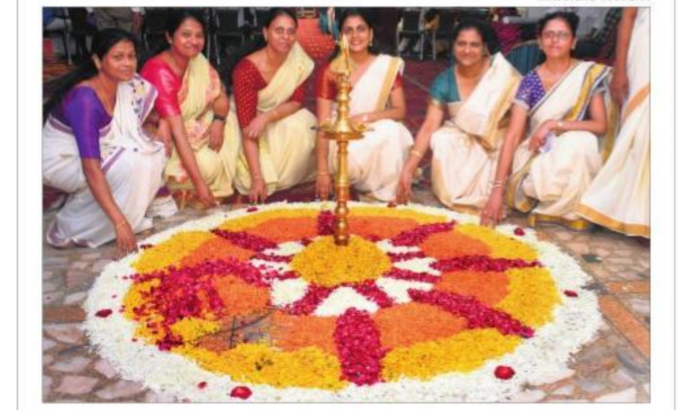
Udaya Kerala Club members celebrate Onam at Shiv Shakti temple in Ludhiana.