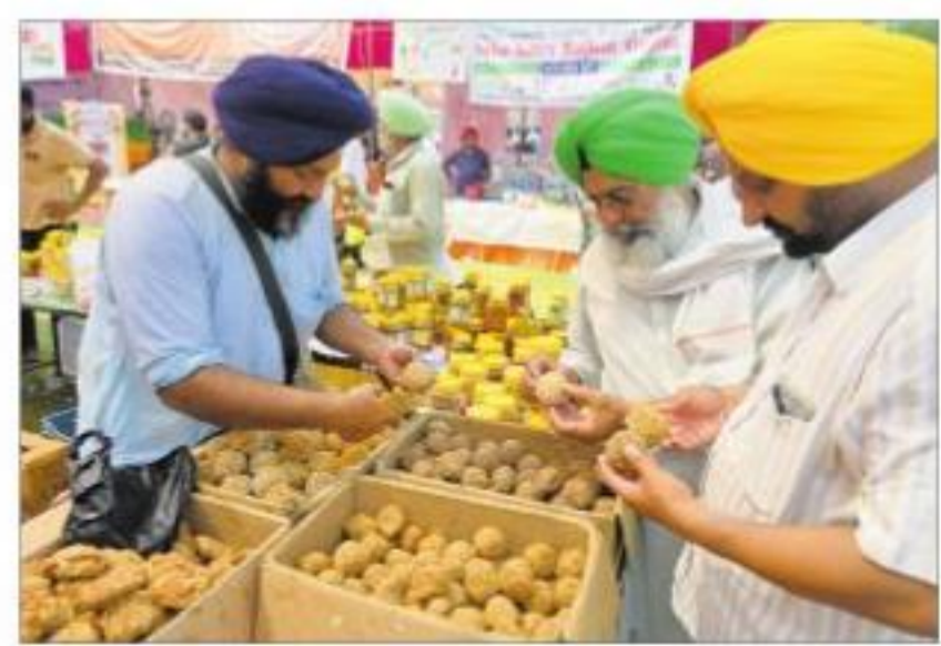
A farmer carries a sack at the annual Kisan Mela at Rauni village in Patiala on Tuesday; and (below) Farmers sell jaggery laddos at the mela.