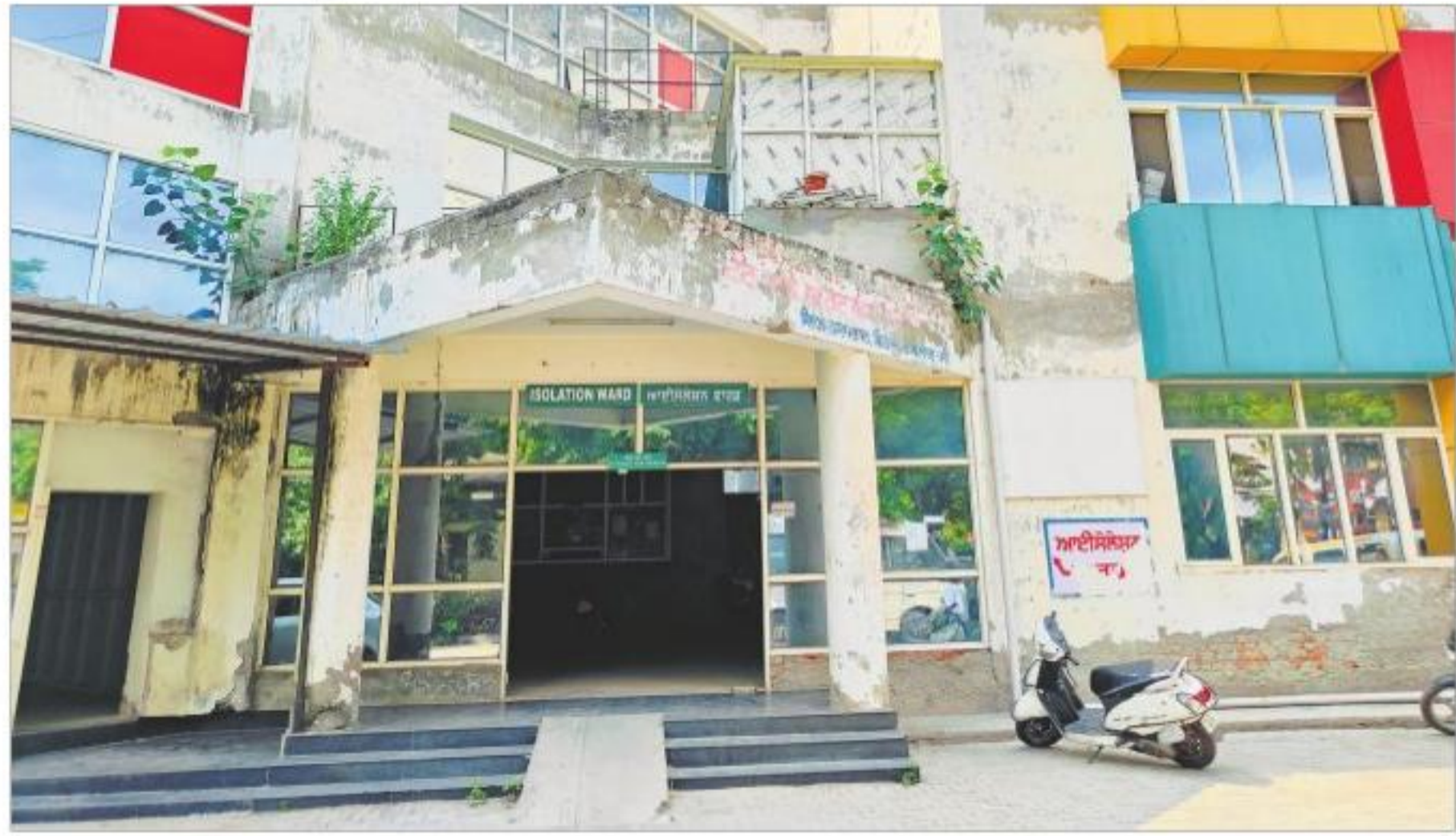
The building of the state-of-the-art eye health facility at Ferozepur.