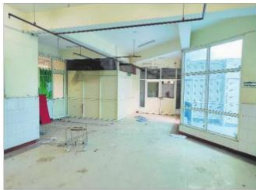
The empty hospital premises; and (right) the registration counter at the healthcare centre.