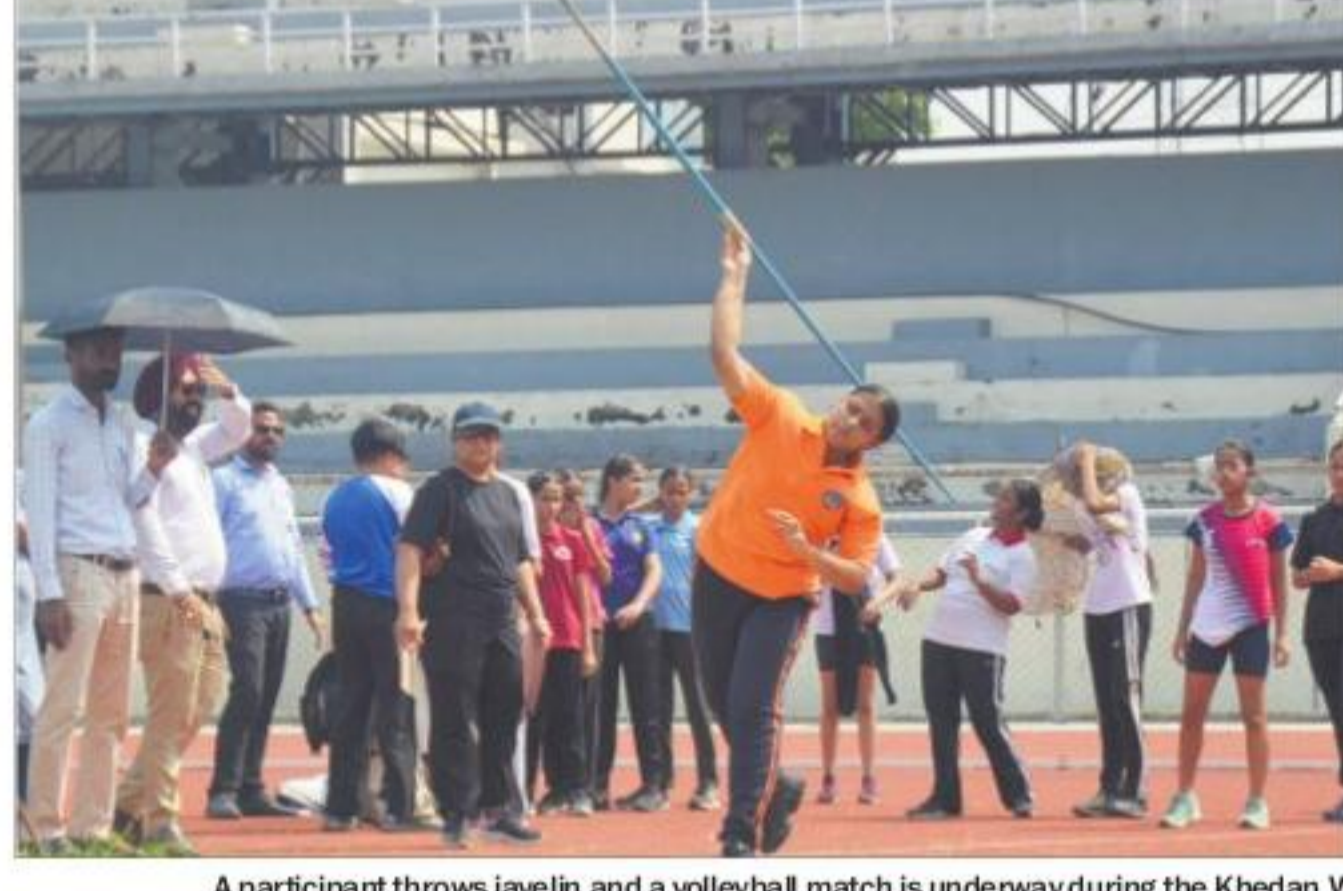
A participant throws javelin and a volleyball match is underway during the Khedan Watan Punjab Diyan on Tuesday.

OUR SPORTS CORRESPONDENT LUDHIANA, SEPTEMBER 24 Gurusar Sudhar team secured the first position in football in the girls' U-21 section in the ongoing district-level games of the third edition of Khedan Watan Punjab Diyan, being organised by the Punjab Sports Department under the aegis of Sports and Youth Services, Punjab, with assistance of the district administration at different venues across the district on Tuesday. In football, at the Punjab Agricultural University ground, Machhiwara 'A' team finished as the first runners-up and Dehlon 'A' team got the third position. In handball (girls' U-14), PAU Club emerged the winners while BVM School, Kitchlu Nagar branch, and Government Senior Secondary School, Katani Kalan, secured the second and third place, respectively, and in the girls' U-17 category, PAU Club got the top position while GAD Academy and DAV Public School, Pakhowal road branch, finished as the first and second runners-up, respectively.