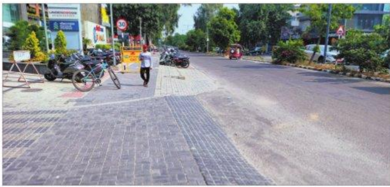
A stretch of Smart City Road (Malhar Road) in Ludhiana.