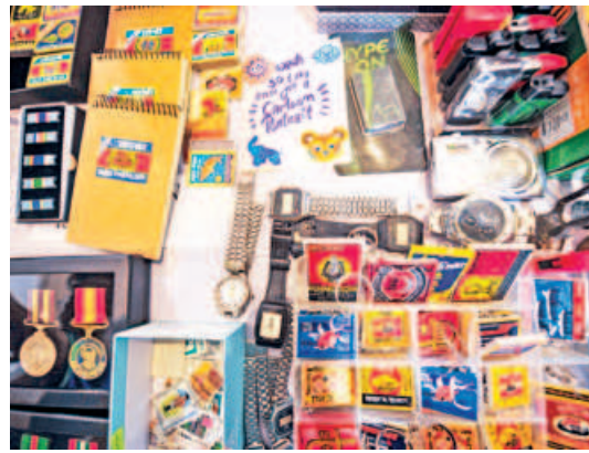
Photos are from a previous Shokher Bazar event.