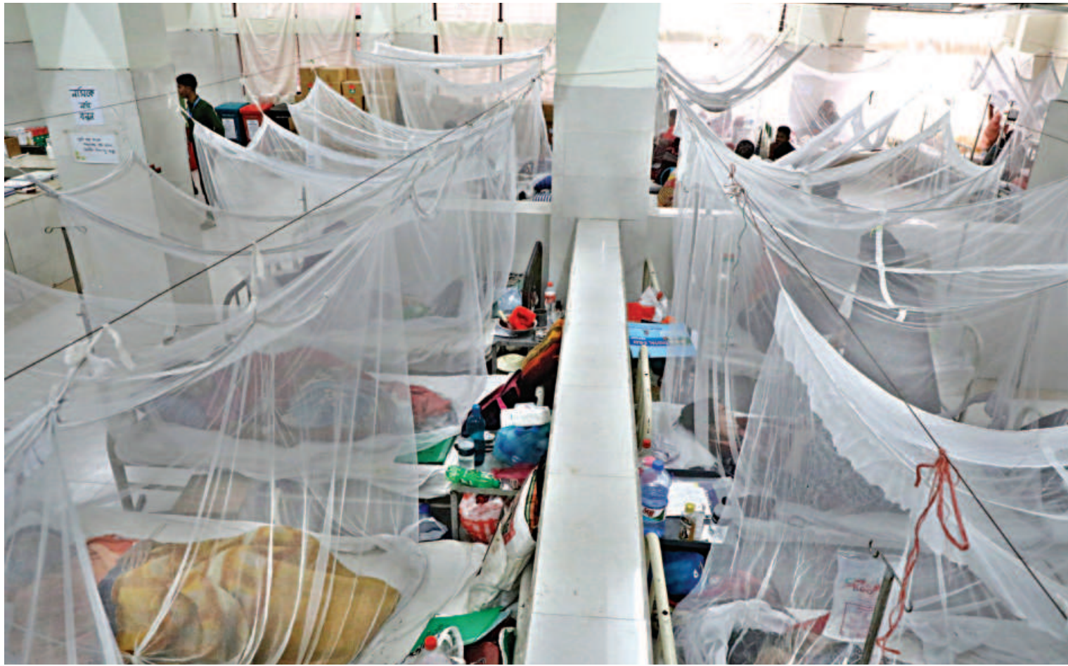
With dengue cases increasing, two wards -- one for male and one for female -- have been opened at the Shaheed Suhrawardy Medical College in the capital. The hospital authorities yesterday said the female ward was almost at capacity.

Currently, 2,208 dengue patients are undergoing treatment, of whom 805 are from outside Dhaka.