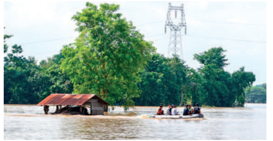
Volunteers ride a boat through a flooded area, searching for stranded people following the impact of Typhoon Yagi in Taungnoo city, Myanmar yesterday. Floods in Myanmar have killed at least 226 people in just over a week, state media reported.

committee member Mirza Abbas said, "A responsible individual on social media is saying that there is a need for a third party or a third power. How can a person in his position make such a statement? I would ask the person to explain this statement to the nation. "We will give you [interim government] the necessary time, but that doesn't mean we will give you time forever..." he said. At least 30 party leaders, including four standing committee members, addressed the rally. Ten speakers said BNP leaders and activists had been leading the movement to oust Hasina for the last 17 years and that the two-month-long student-led movement should not claim all credit for toppling the AL regime.