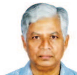
Muhammad Nurul Huda is former IGP of Bangladesh Police.