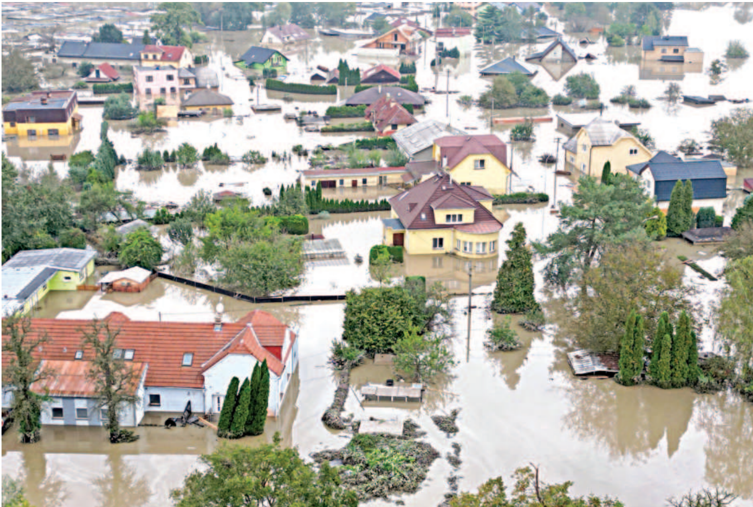
A drone view shows the flood-affected area following heavy rainfall in Ostrava, Czech Republic yesterday. Flooding sparked by Storm Boris in central Europe has burst dams, knocked out power and killed at least 18 people, authorities said.

"After careful consideration, we expanded our ongoing enforcement against Russian state media outlets. Rossiya Segodnya, RT and other related entities are now banned from our apps globally for foreign interference activity," the social media company said in a written statement.