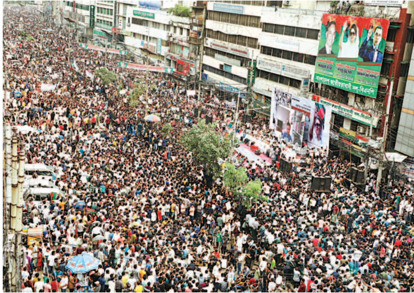
A partial view of a BNP rally in the capital's Nayapaltan yesterday. The party organised the event marking the International Day of Democracy.