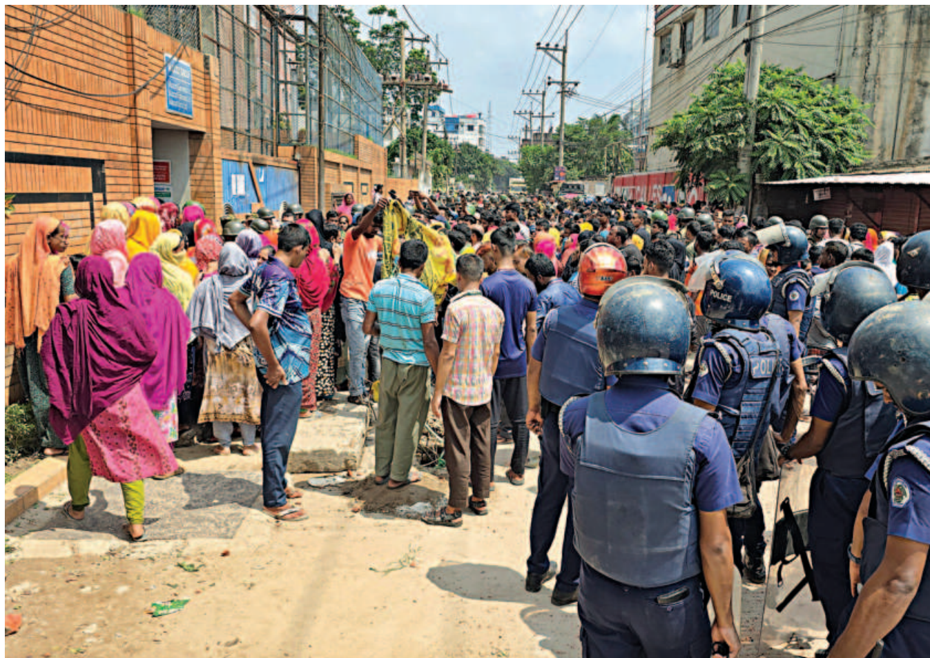
Workers of Mascot Garments demonstrate blocking Zirabo-Bishmail road in Savar yesterday protesting the death of a colleague who was killed in an attack by workers of an adjacent garment factory.