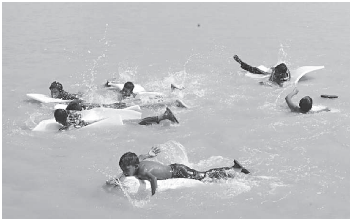
Children enjoy swimming in the river Kirtankhola, using foam boards to float and play. The splash of water and their laughter create a lively scene under the open sky. The photo was taken from Chandmari area in Barishal yesterday.