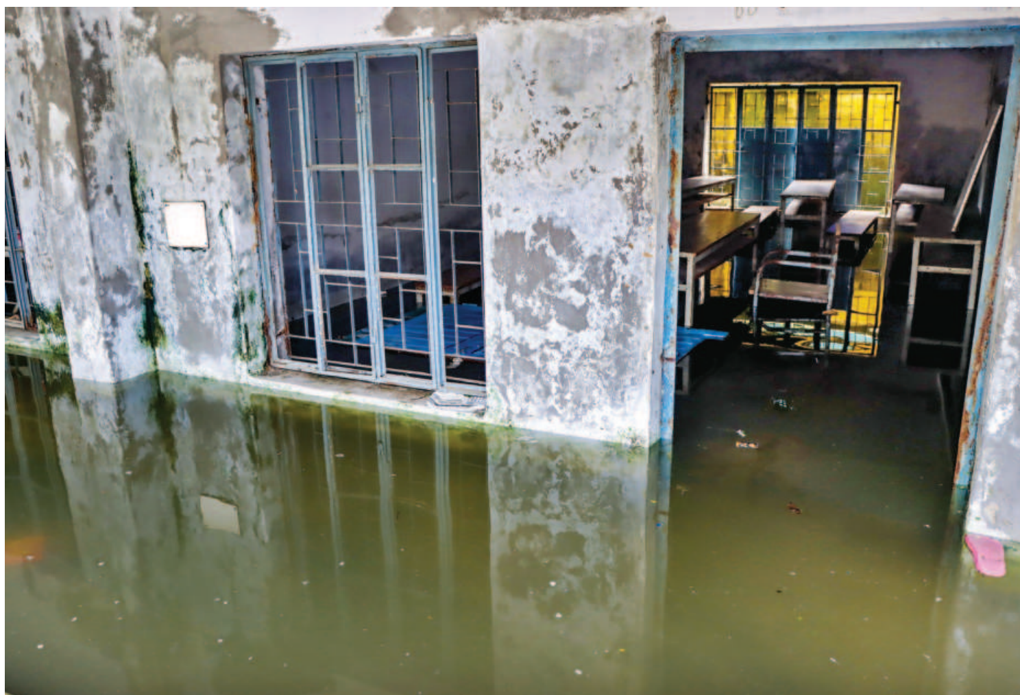
The ground floor of Bastuhara Secondary School in Boyra of Khulna City Corporation has gone under water, disrupting academic activities. Heavy rainfall caused this waterlogging. The photo was taken yesterday morning.