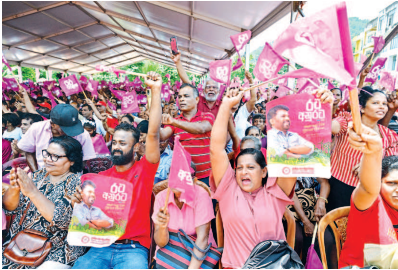
Supporters of National People's Power (NPP) party's presidential candidate Anura Kumara Dissanayaka attend an election rally ahead of the September 21 presidential election, in Dehiowita, Sri Lanka yesterday.

The Montreal Protocol, which came into effect in 1989, agreed to phase out chlorofluorocarbons and other ozone-depleting substances, and its success "stands out as a powerful symbol of hope" at a time when multilateral cooperation has come under strain, said U.N. Secretary-General Antonio Guterres in a statement.