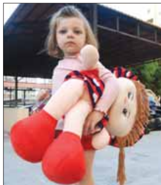
A Lebanese girl, who fled with her family from southern Lebanon, takes refuge at a school in Sidon yesterday.

Lebanon's health ministry said the strikes killed 492 people, including 35 children and 58 women, and wounded 1,645 others.