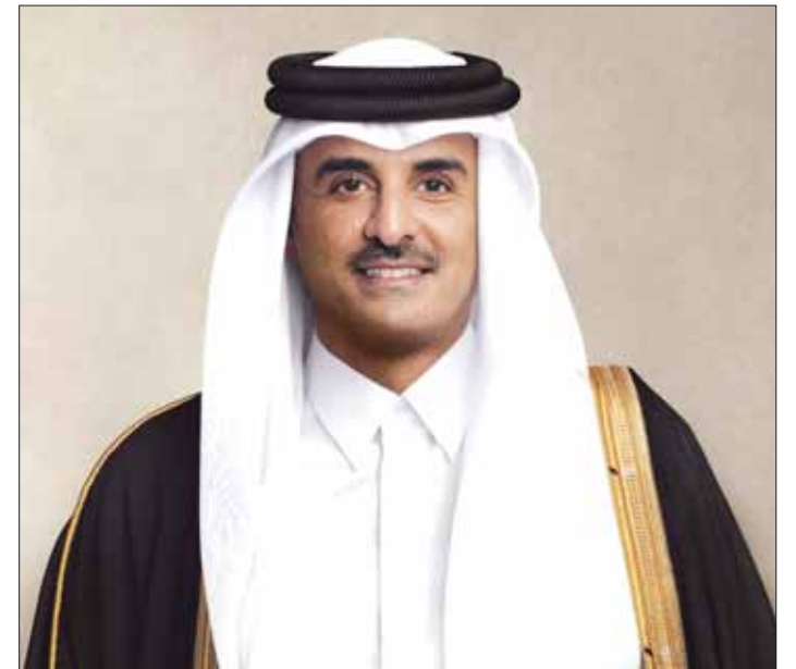
His Highness the Amir Sheikh Tamim bin Hamad al-Thani to address the UN General Assembly today.