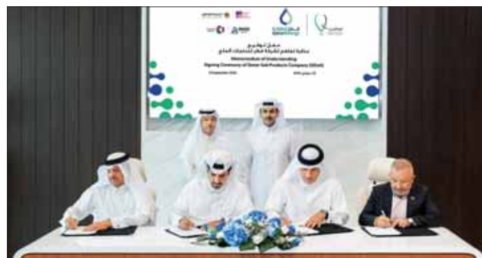
The MoU was signed in the presence of HE the Minister of State for Energy Affairs, Saad bin Sherida al-Kaabi, also the President and CEO of QatarEnergy at the QatarEnergy headquarters.

HE al-Kaabi added: "I would like to congratulate all partners and stakeholders in Qatar Salt Products Company on this achievement, which I believe will further support the supply chain and industrial localisation in the State of Qatar, as well as promote sustainable envi-