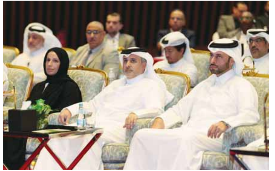
HE the Minister of Environment and Climate Change Dr Abdullah bin Abdulaziz bin Turki al-Subaie (centre) with HE the Minister of Education and Higher Education Buthaina bint Ali al-Jabr al-Nuaimi and HE the Minister of Municipality Abdullah bin Hamad bin Abdullah al-Attayah at the seminar yesterday.

This innovation contributes to reducing the carbon footprint and protecting air, soil, and groundwater quality from pollutants while minimising the environmental impact of sludge.