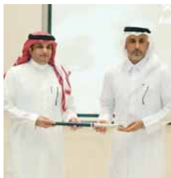
Snapshots from the three-day seminar on 'Drugs and Their Impact on Societal Security' at the Police Academy.