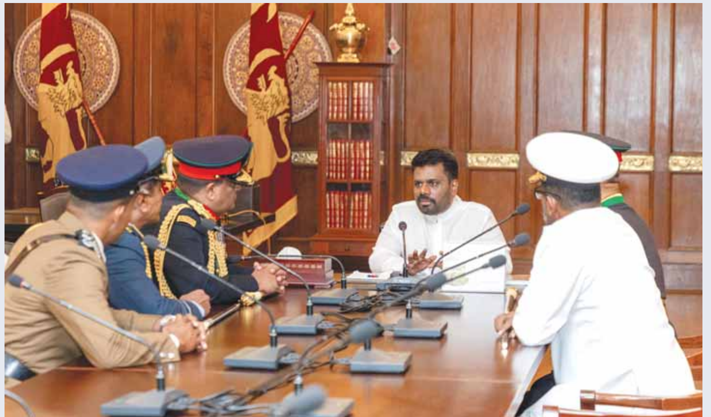
Sri Lanka's new President Anura Kumara Dissanayake speaks with the military and police chiefs after being sworn in as president at the Presidential Secretariat in Colombo yesterday.