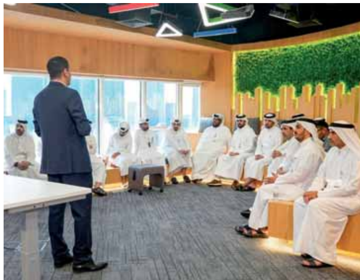
The workshop in session.