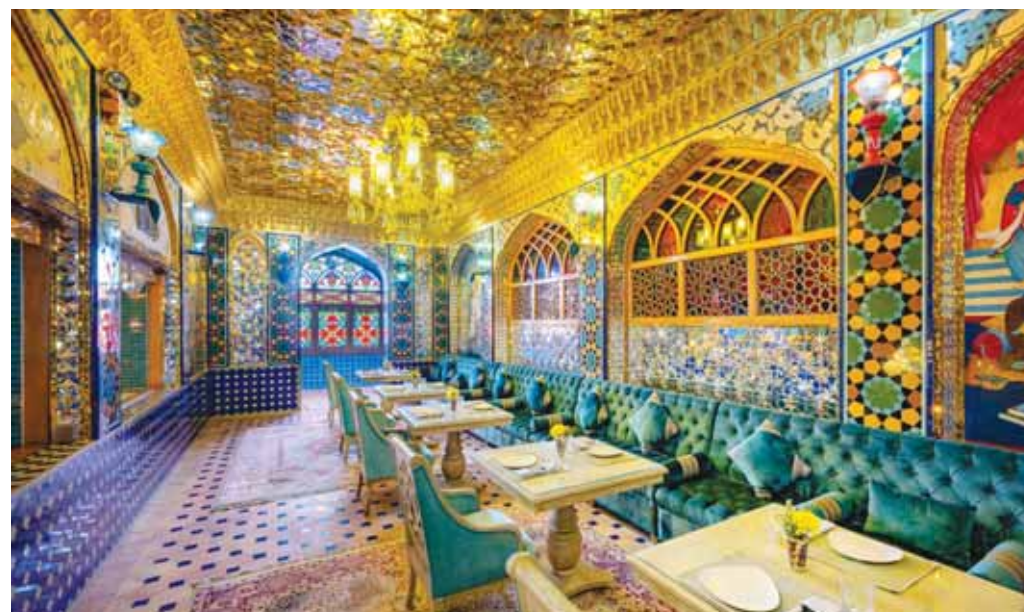
Parisa in Souq Waqif