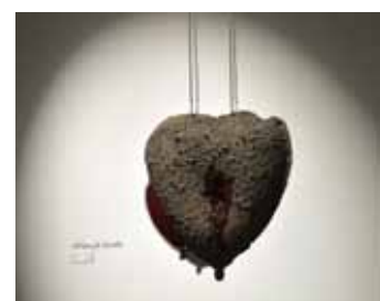
Hayat El-Yamani's pieces: the balloon represents fragility while the clay means the resilience from which humans were formed.