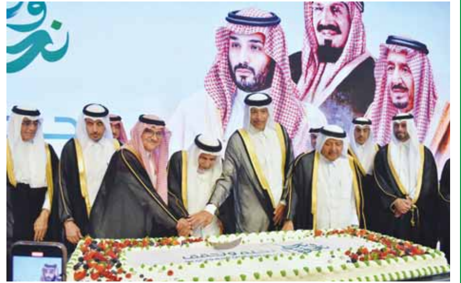
Dignitaries at the 94th National Day celebrations of Saudi Arabia, held in Doha yesterday.