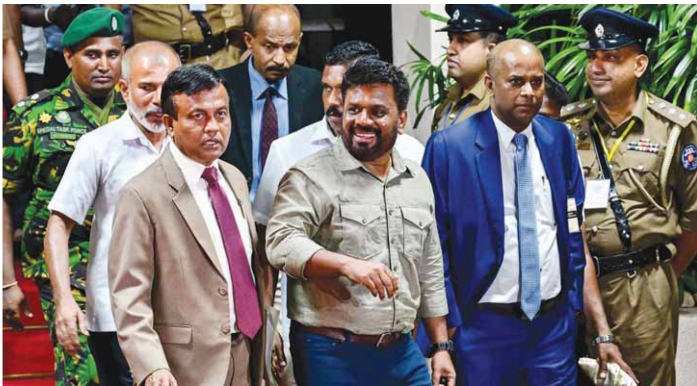
Sri Lanka's president-elect Anura Kumara Disanayaka (centre), gestures as he leaves the Election Commission office in Colombo yesterday, following his victory in the country's presidential election.

In the leafy streets of the Shahbagh neighbourhood, colourful new murals exhort the public to "destroy the iron doors of prison" and celebrate Bangladesh's "re-birth".