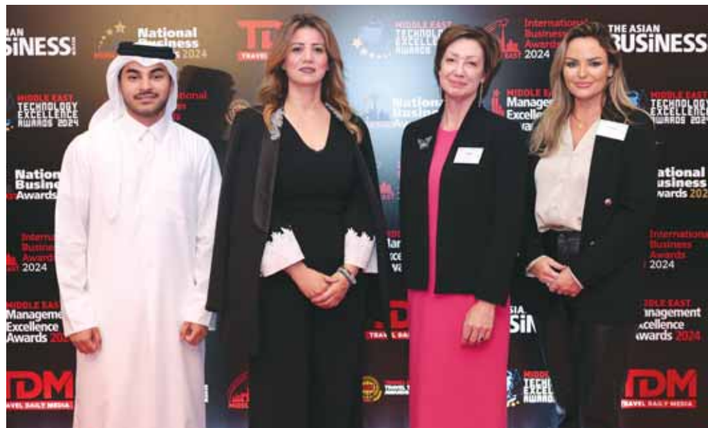
The Katara Hospitality team at the awards event.

Each dish served at Parisa is a celebration of Persian culinary traditions, carefully crafted by award-winning chefs using the finest ingredients to deliver a menu that caters to even the most