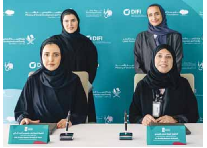
The conference, held every decade, has a crucial role in developing policies and programmes centred around supporting and empowering families on a global scale.

More than 2,000 delegates – including policymakers, researchers, family practitioners, parents, and young people – will gather at the conference as it focuses on four major megatrends affecting families across the world: technological change, demographic change, migration and urbanisation, and climate change.