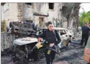
A member of the Israeli security forces stands guard in Kiryat Bialik in the Haifa district of Israel, targeted by a strike by Hezbollah yesterday.

Hezbollah and Israel exchanged heavy fire yesterday, as the Lebanese resistance group sent rockets deep into northern Israeli territory after facing some of the most intense bombardment in almost a year of conflict. Hezbollah deputy chief Naim