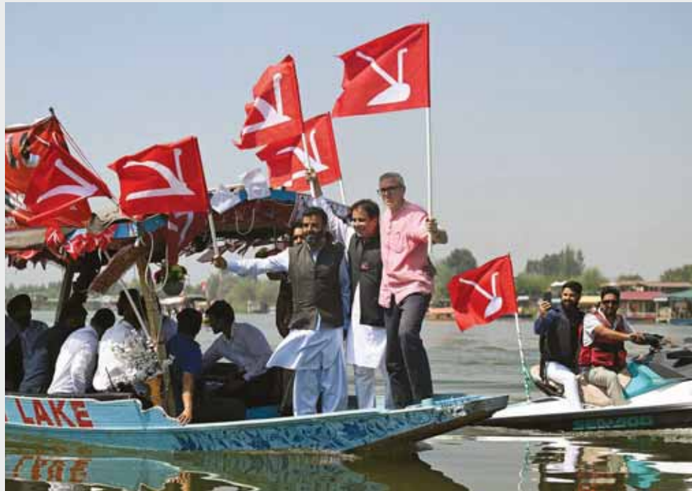
Omar Abdullah (centre), the leader of Jammu and Kashmir National Conference (JKNC), poses for photos as he rides a boat in Dal Lake during an election campaign rally in Srinagar yesterday, ahead of the second phase of voting during assembly election.