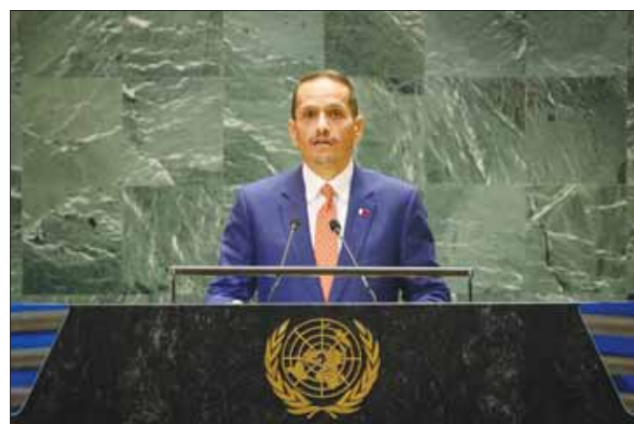
HE the Prime Minister and Minister of Foreign Affairs Sheikh Mohammed bin Abdulrahman bin Jassim al-Thani

He also emphasised Qatar's commitment to international multilateral action. In this regard, he referred to His Highness the Amir's pledge of $500mn to support the core resources of UN agencies for ten years, Qatar's announcement during the UN Climate Action Summit in 2019 to allocate $100mn to support small island developing states and least developed countries in the Caribbean, Pacific, and Africa regions, and its hosting of the 5th UN Conference on the Least Developed Countries (LDC5) in March 2023 and its pledge of $60mn to implement development pro-