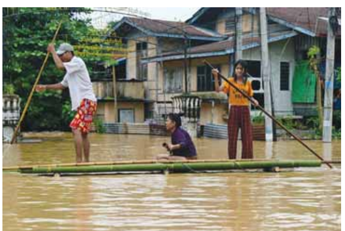
Flood-affected residents ride a bamboo raft in Taungoo.

More than 2.7mn people were already displaced in Myanmar by conflict triggered by the junta's