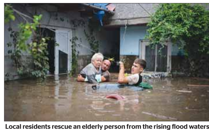
Local residents rescue an elderly person from the rising flood waters in the Romanian village of Slobozia Conachi.

In Romania, flooding affected eight counties, the country's emergency unit said, and Prime Minister Marcel Ciolacu visited