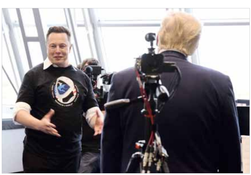
Donald Trump and Elon Musk tour the Firing Room Four after the launch of a SpaceX Falcon 9 rocket and Crew Dragon spacecraft on Nasa's SpaceX Demo-2 mission to the International Space Station from Nasa's Kennedy Space Center in Cape Canaveral, Florida, on May 30, 2020.

Trump in the conversation responded that Musk was "the greatest cutter" of jobs. Presidential commissions have been created on a number of topics, such as when President Joe Biden created