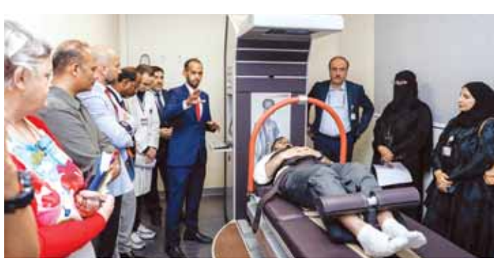
Officials at Hamad Medical Corporation's Male Physiotherapy Department at Rumailah Hospital at the new Spinal Decompression

Zarour added: "In some cases, the physical therapist may recommend the use of a complementary set of therapeutic procedures that will help speed up the healing rates, such as heat or cold therapy, electrical stimulation to release muscle contractions, and high-frequency ultrasound to warm the affected area."