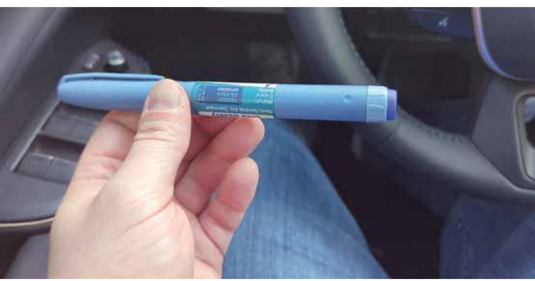
A suspected fake Ozempic pen, featuring the batch number MP5B060 on its label above the branding, that was bought in Nuevo Progreso, Mexico, is seen at an unknown location in this handout photo obtained by Reuters on April 17, 2024. Novo Nordisk has previously said an Ozempic pen whose scale extends when setting the dose, as this one does, can be identified as counterfeit.

Criminals can get hold of batch numbers through a corrupt