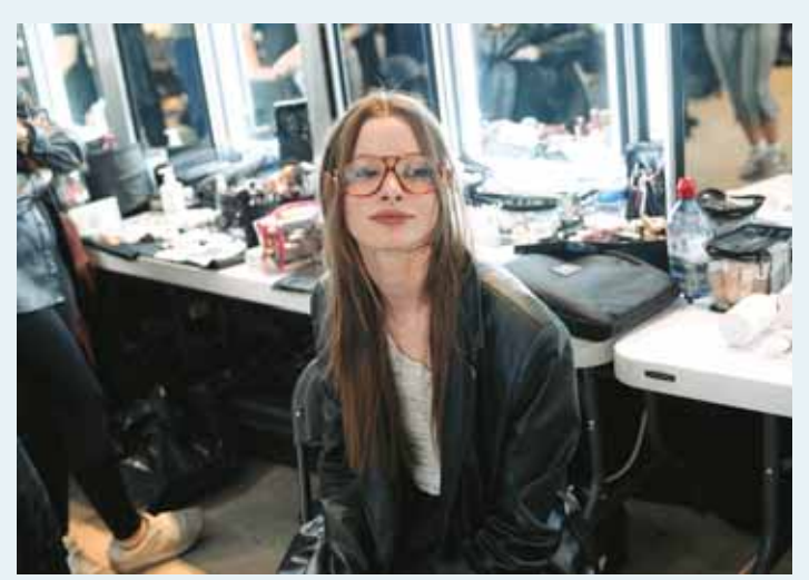
A model gets ready backstage ahead of the MASHA POPOVA Spring/ Summer 2025 collection at London Fashion Week