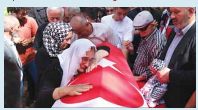
A relative of Aysenur Ezgi Eygi, mourns over her Turkish flag-draped coffin during the funeral ceremony at a cemetery in Didim, Turkiye.

Israel has acknowledged that its troops shot the activist, but says it was an unintentional act during a demonstration that turned violent.