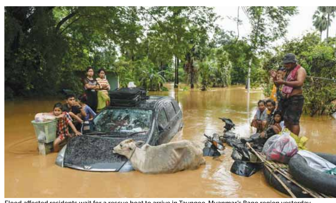
Flood-affected residents wait for a rescue boat to arrive in Taungoo, Myanmar's Bago region yesterday.

The junta gave a death toll on Friday of 33, while earlier in the day the country's fire department said rescuers had recovered 36 bodies. A military spokesman said it had lost contact with some areas of the