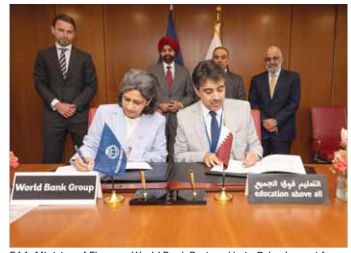
EAA, Ministry of Finance, World Bank Partner Up to Drive Impact for Global Education.