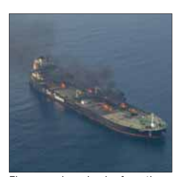
Flames and smoke rise from the Greek-flagged oil tanker Sounion on the Red Sea vesterday.