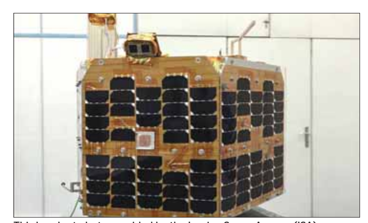
This handout photo provided by the Iranian Space Agency (ISA) yesterday, shows the Chamran-1 research satellite at an unknown location in Iran.

Iran on Thursday summoned four European ambassadors after they imposed new sanctions over its alleged supply of ballistic missiles to Russia for use in Ukraine, which Tehran denies.