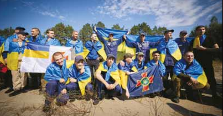
Ukrainian prisoners of war pose for a picture after a swap at an unknown location in Ukraine yesterday. Right: A video grab shows Russian prisoners sitting in a bus following the swap. (Reuters, AFP)

"At present, all Russian servicemen are on the territory of the Republic of Belarus, where they are being provided with the necessary psychological and medical assistance, as well as an opportu-