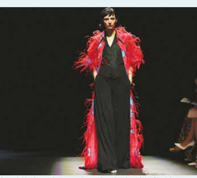
A model looks on during a rehearsal on the day of the Patrick McDowell catwalk show.