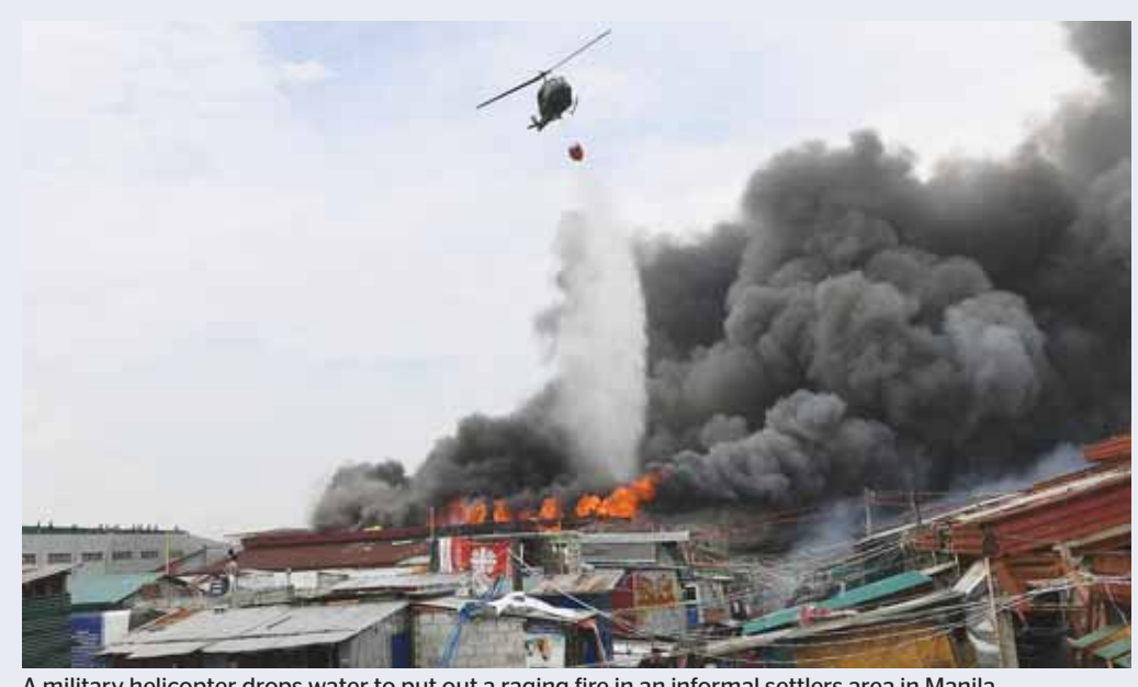
A military helicopter drops water to put out a raging fire in an informal settlers area in Manila.