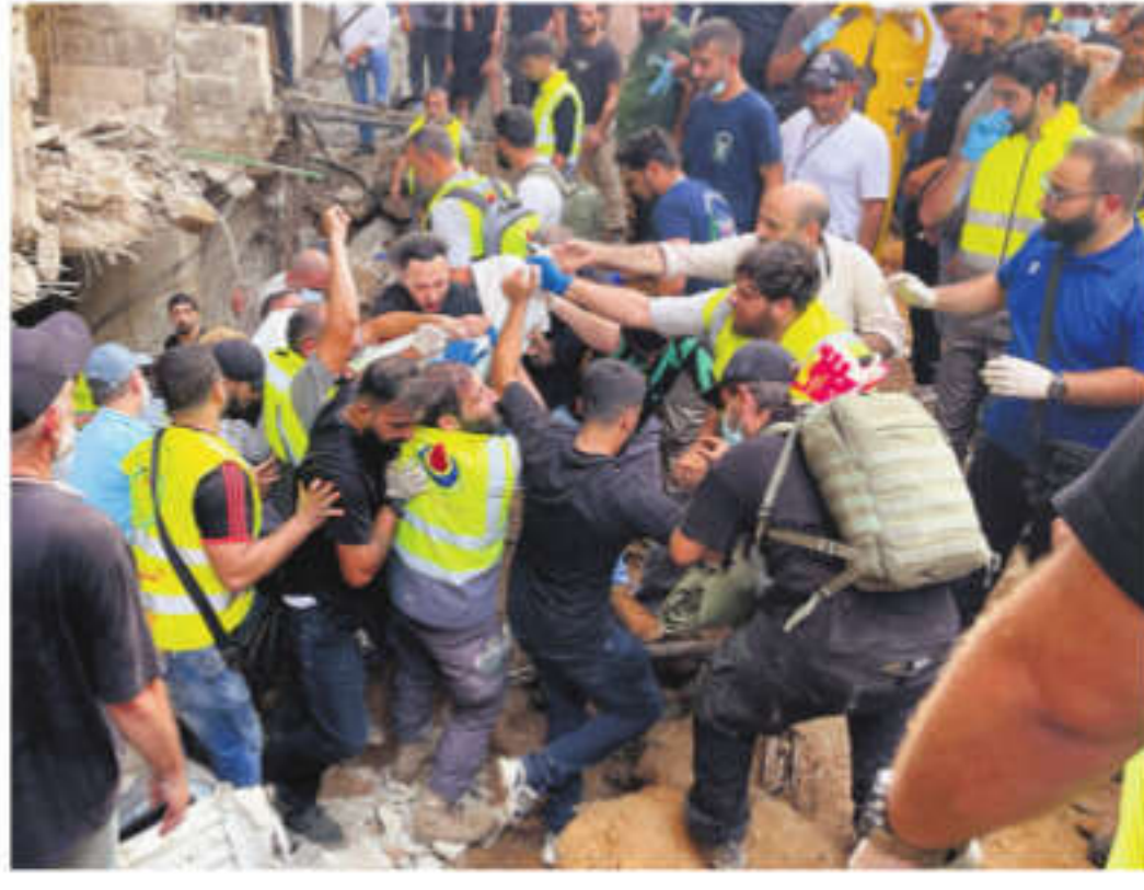
Rescuers carry a body at the scene of a missile strike in the southern suburbs of Beirut on Friday