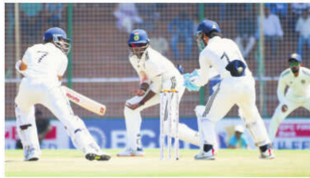
Players in action during Duleep Trophy match at Anantapur on Friday

CHANGZHOU (CHINA): India shuttler Malvika Bansod could not stand up to the challenge of two-time world champion Akane Yamaguchi, going down to the fourth-seeded Japanese in straight games in the quarterfinals of the China Open. Malvika found the going tough against the world No.5 losing 10-21, 16-21 in just 35 minutes