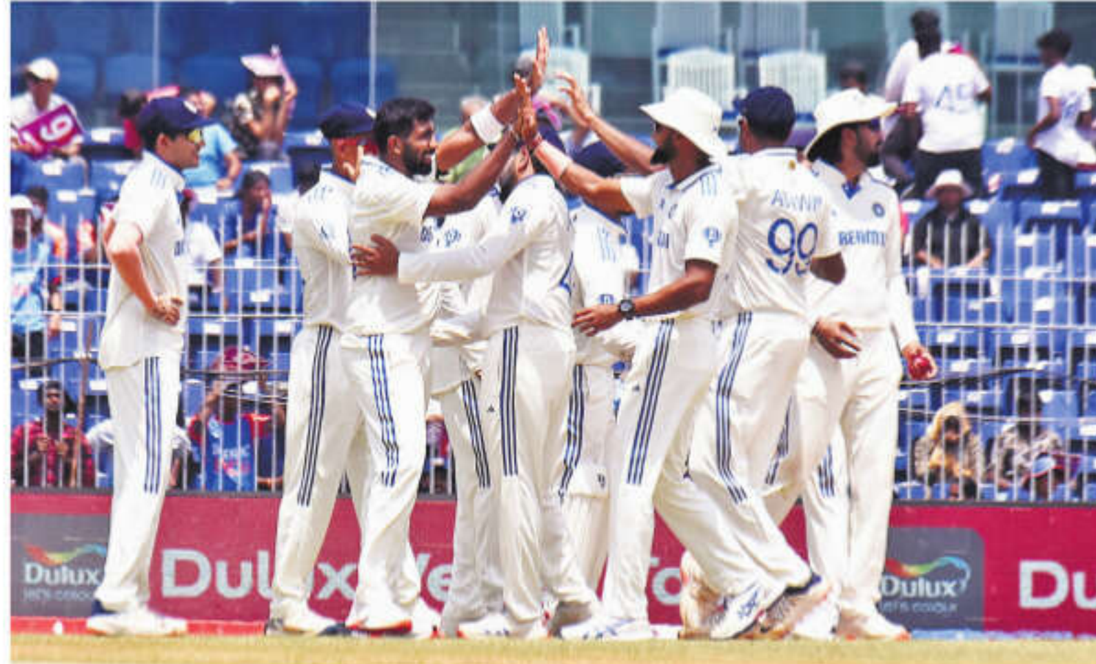
India are firmly in control of 1st Test at the end of Day 2 after leading by 308 runs with seven wickets still in hand | P RAVIKUMAR

He along with Akash Deep and Siraj dictates play vs Bangladesh to help hosts take 300-plus lead