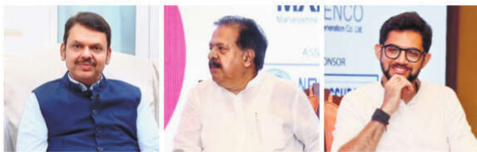
From left: Maharashtra Deputy Chief Minister Devendra Fadnavis, Maharashtra Congress in-charge Ramesh Chennithala, and Shiv Sena (UBT) leader Aditya Thackeray participating in the first edition of The New Indian Express' Mumbai Dialogues

However, Opposition leaders did not share Fadnavis' optimism. Shiv Sena (UBT) leader Aditya Thackeray