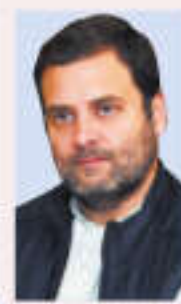
Rahul Gandhi @RahulGandhi

Further, he added the report will be examined and suitable action taken within the legal framework and regulations under the FSSAI. "The FSSAI will examine it, give a report and then we will take action," he explained. P3