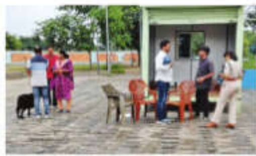
A scientific team and dog squad at the crime scene in Rourkela on Wednesday

However, the girl's ordeal did not end there as she was dumped on the road when two other miscreants picked her up in a motorcycle and raped her near the library and defunct millet cafe along ring road opposite the administrative building of RSP within Plant Site police limits.