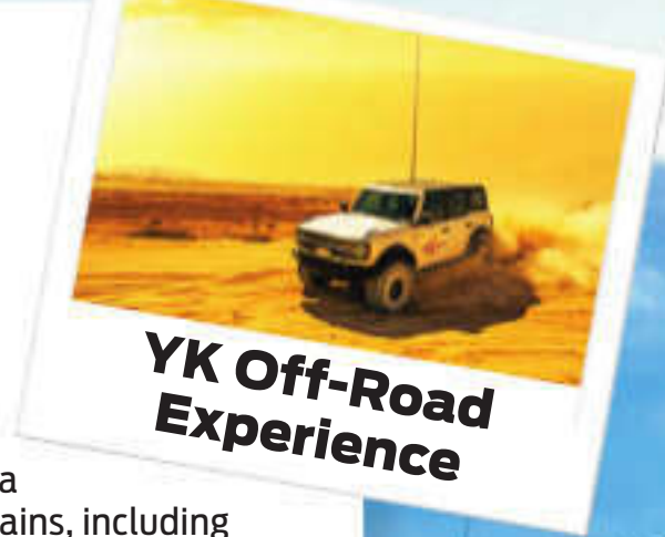
YK Off-Road Experience

Discover Bahrain's hidden ecological gem with a serene kayaking adventure through the mangroves at Tubli Bay.