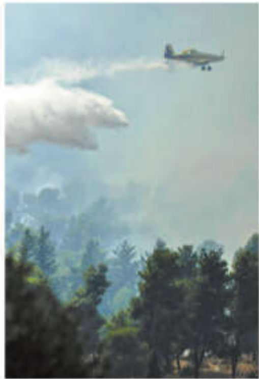
An Israeli firefighters plane uses a fire retardant to extinguish a fire after a rocket fired from Lebanon hit an open area near the city of Safed, northern Israel, on Wednesday