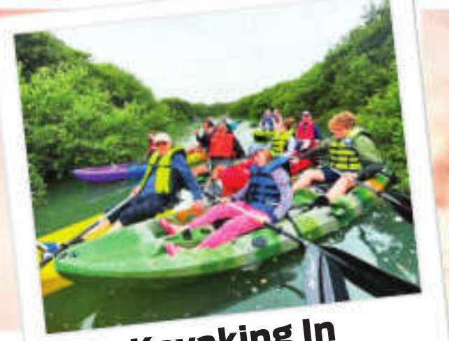
Kayaking In Mangroves

Stay at: Fraser Suites Diplomatic Area, Manama | Gulf Air offers direct flights to Bahrain from Delhi, Bengaluru, Chennai, Kochi, Hyderabad, Thiruvananthapuram and Mumbai.