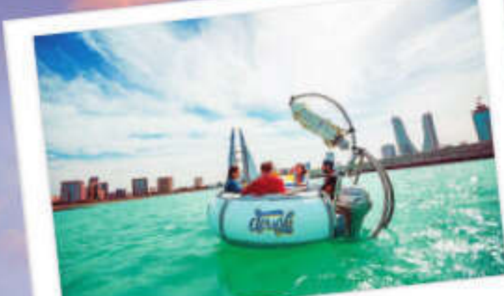
Doughnut Boat Ride

For a leisurely yet distinctive experience, set sail from South Wharf aboard a quirky doughnut-shaped boat for a one-hour scenic ride around Bahrain Bay.