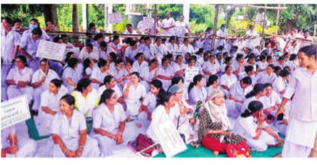
Nurses staging dharna in front of Old OPD building of SCB MCH | EXPRESS