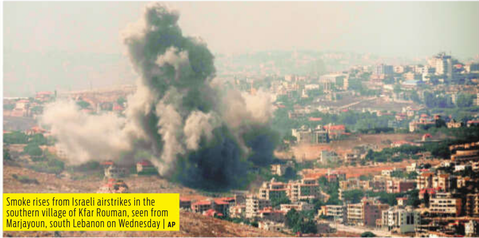
Smoke rises from Israeli airstrikes in the southern village of Kfar Rouman, seen from Marjayoun, south Lebanon on Wednesday

Israeli military officials said they intercepted Hezbollah's surface-to-surface missile, which marked a further escalation after Israeli strikes on Lebanon killed hundreds of people.