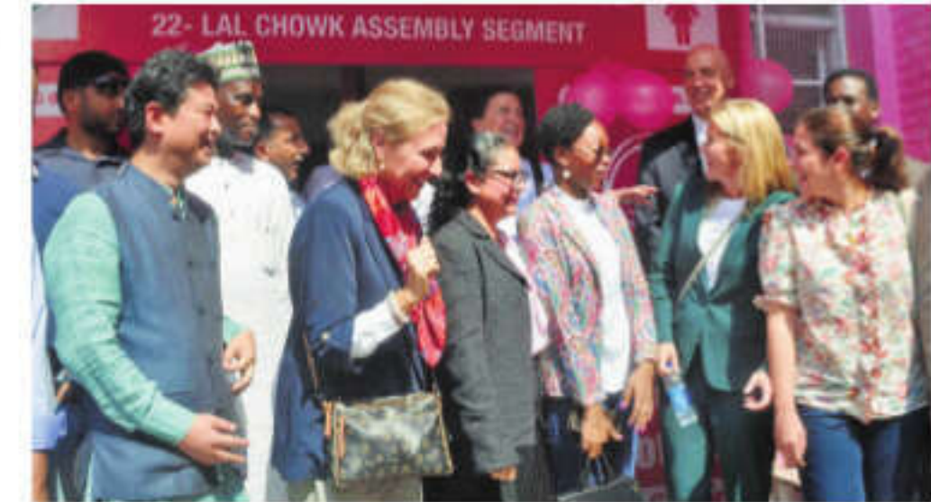
Foreign diplomats after visiting a polling booth in Srinagar, for a first-hand assessment of the Assembly elections in J&K on Wednesday