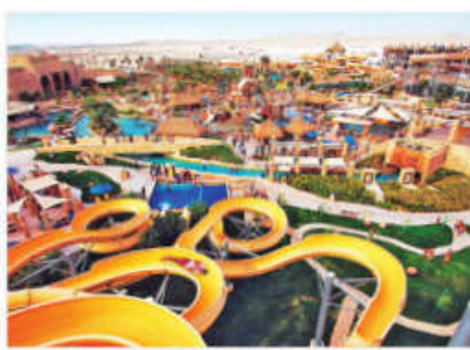
Lost Paradise of Dilmun Water Park

For a leisurely yet distinctive experience, set sail from South Wharf aboard a quirky doughnut-shaped boat for a one-hour scenic ride around Bahrain Bay.