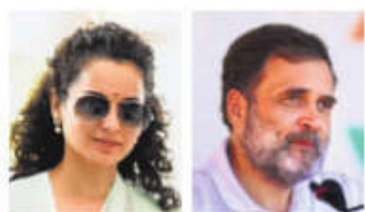
Kangana Ranaut Rahul Gandhi

Kangana emphasised the importance of respecting Prime Minister Narendra Modi's decision to repeal the laws that were intended to benefit farmers but faced intense opposition.