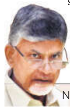
NAIDU: TTD PROBE CONFIRMED USE OF SUBSTANDARD INGREDIENTS | P5

Speaking to mediapersons at YSRC party headquarters on Thursday, the MP said Naidu had stooped to an all-time low to gain political mileage. CONTINUED ON P5