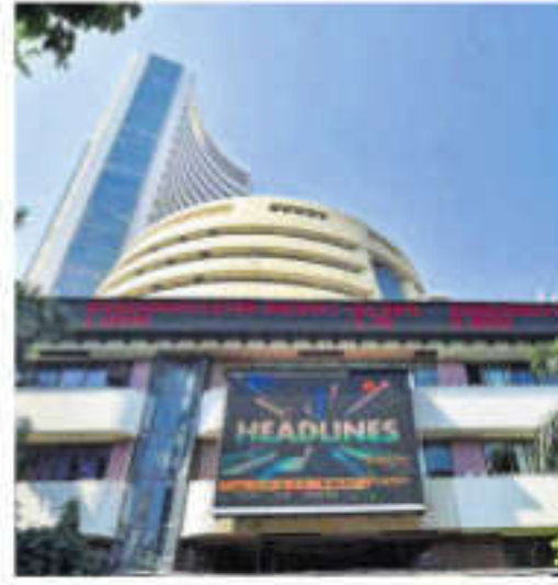
Airtel m-cap hits 10L cr, 4th firm to hit this mark