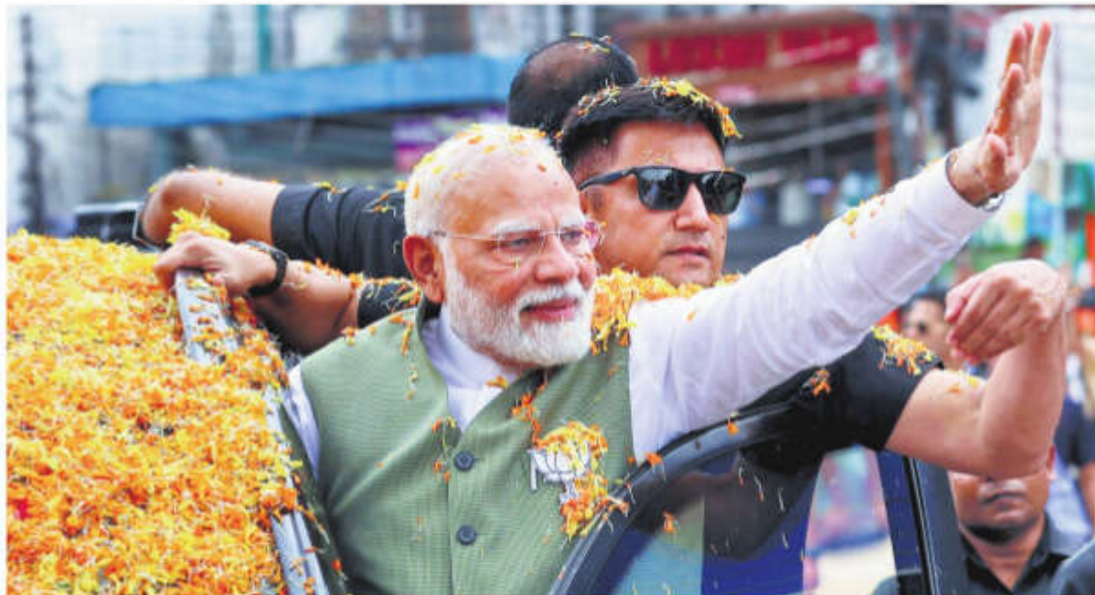
PM Narendra Modi in a roadshow for J&K Assembly elections in Reasi on Thursday

The PM said J&K youth suffered a lot during the rule of these three families. "Many youths, who are 20-30 years old, have remained deprived of education. Many others took more years than other students of the country to reach 10th, 12th or college. This did not happen because J&K youth failed but because the three families of