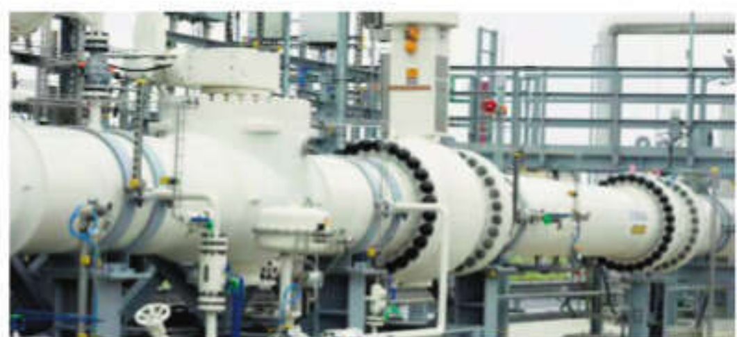
Oil Regulations Bill could be passed in winter session

"OALP round nine closes the day after tomorrow, and we are already in advanced stages of preparing for OALP round 10. We are hopeful that the ORD Act will pass in the winter session, which will facilitate our