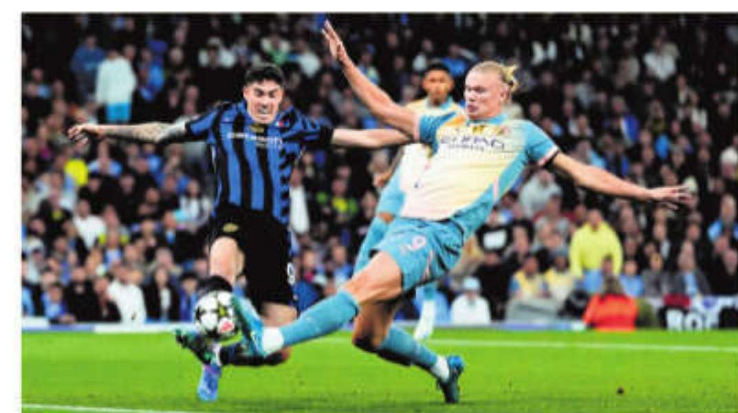
Man City's Erling Haaland (L) & Inter Milan's Alessandro Bastoni (R) challenge for the ball during the Champions League match in Manchester, on Wednesday

The new format has welcomed new faces and long-absent friends in European soccer's marquee competition.