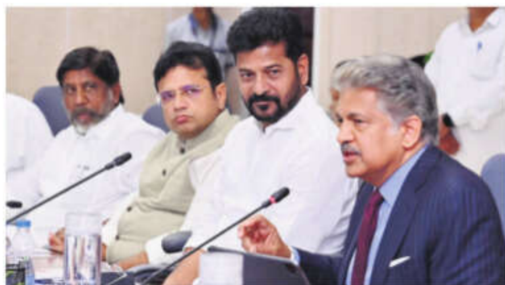
Skill University chairman Anand Mahindra speaks as CM A Revanth Reddy, Deputy CM Mallu Bhatti Vikramarka and IT Minister Sridhar Babu look on, on Thursday

Revanth announced that the responsibility was being handed over to the University Board and said that the state government has allotted 150 acres and ₹100 crore to the university. He said that the government will now focus on the establishment of Young India Sports University. "The sports university will be set up