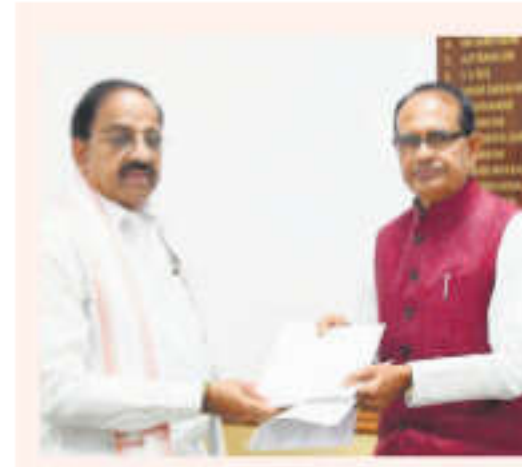
Agriculture Minister Thummala Nageshwara Rao with Union Agriculture Minister Shivraj Singh Chouhan in Delhi

Comparing the previous regime's policies and schemes with that of the present Congress government, he said: "Our welfare schemes, such as Rythu Bharosa and Rythu Bima