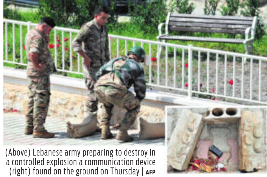
(Above) Lebanese army preparing to destroy in a controlled explosion a communication device (right) found on the ground on Thursday

killed on Wednesday and 12 on Tuesday, updating an earlier toll of 32 dead overall.