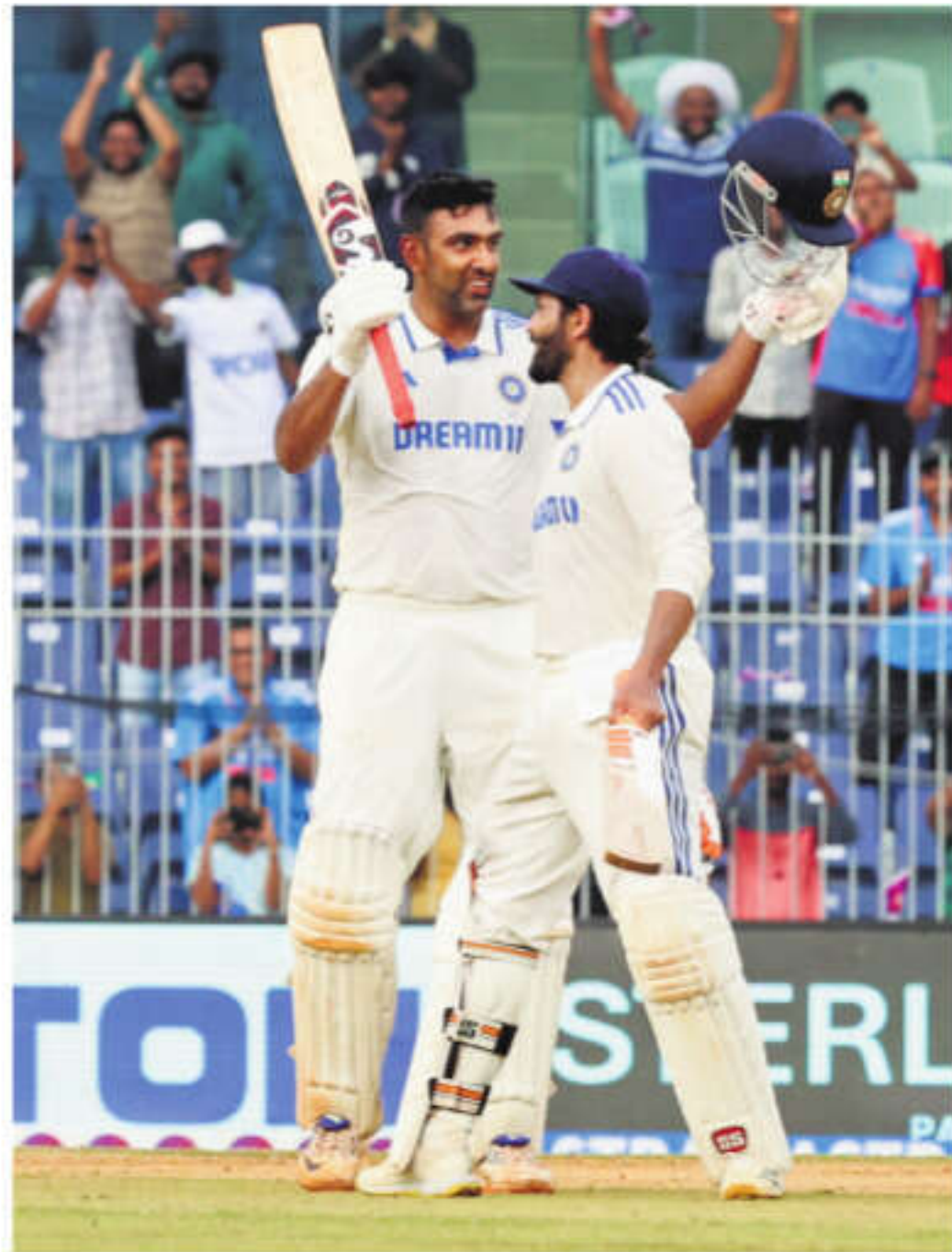
R Ashwin & Ravindra Jadeja added an unbeaten 195 for 7th wicket

It was Ashwin and Jadeja's unbeaten stand of 195 runs off 227 balls for seventh wicket enabled the hosts to recover. India were 144 for 6 when Ashwin joined Jadeja in the middle. Both played sensible cricket to keep the scoreboard ticking and now have handed India a massive boost heading into the second day. They were