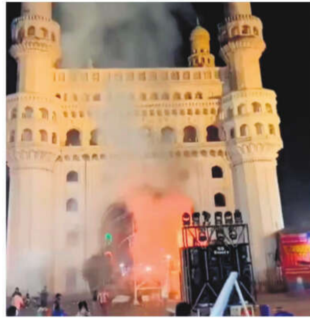
A minor fire broke out at a Milad-un-Nabi rally organised by the All India Sunni United Forum at Charminar on Thursday.

HYDRAA has invited proposals to engage a demolition agency for a one-year term. Sources said that the selected agency must possess machinery/equipment including a hi-reach hydraulic boom capable of reaching heights up to 20 metres along with a jaw crusher, shear cutter, additional shear cutter, rock breaker with bucket, blade attachments and other materials required. The demolition machine