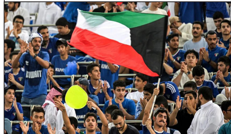
Kuwait fans fly their flag inside at World Cup qualifier against Iraq.

KUWAIT (Sky Sports) - The Kuwait Football Association's board have resigned "en masse" after "regrettable chaotic incidents" at a home World Cup qualifier against Iraq.