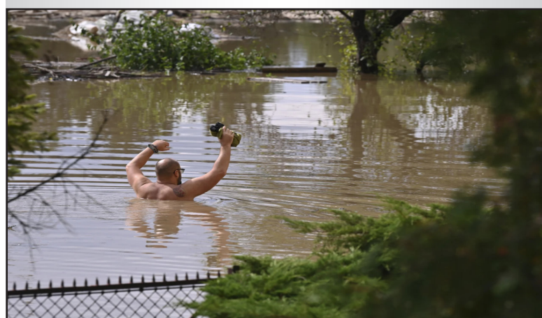
Since Friday, over 10,000 people have been evacuated across the Czech Republic.

LIPOVA-LAZNE/WARSAW (Reuters) – One person drowned in southwest Poland, a rescue worker was killed in Austria and thousands were evacuated in the Czech Republic after heavy rain continued to batter central Europe on Sunday, causing flooding in several parts of the region.