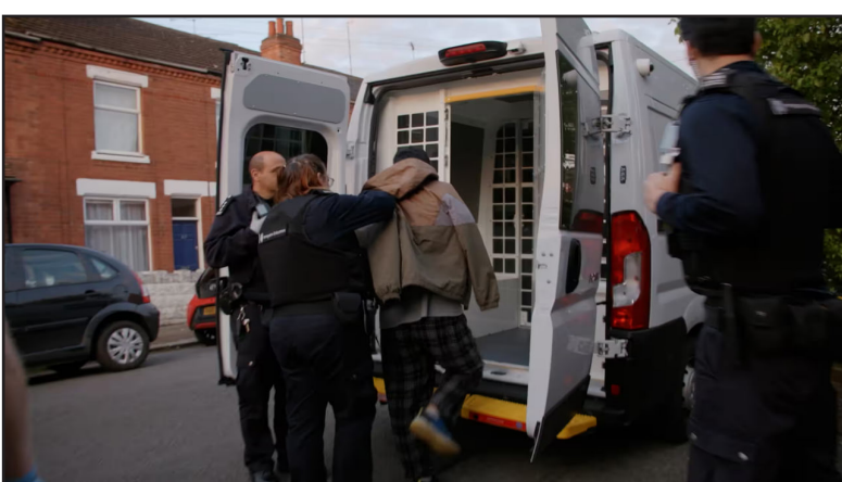
Home Office immigration officers carry out a detention operation of migrants in May 2024.

testimonies from security staff at the Harmondsworth immigration removal center in West London that detail two cases of force being used on detainees who remained locked up weeks after the Rwanda scheme was postponed by Sunak.