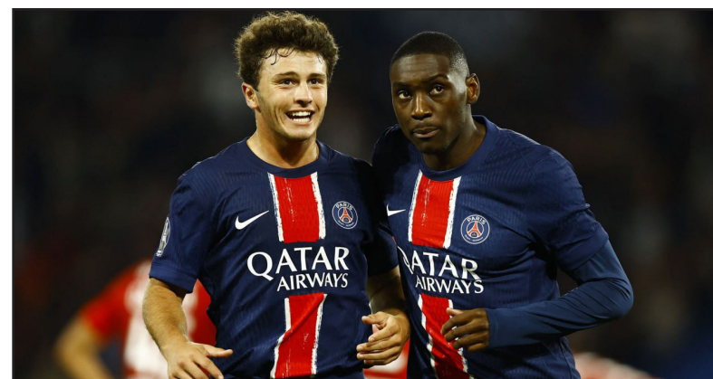
Paris St Germain's Ousmane Dembele (right) and Joao Neves celebrate after Fabian Ruiz scores their second goal.

PARIS (Reuters) - Paris St Germain moved back to the top of Ligue 1 with a 3-1 home win over Brest thanks to an Ousmane Dembele double and Fabian Ruiz's brilliant strike on Saturday.