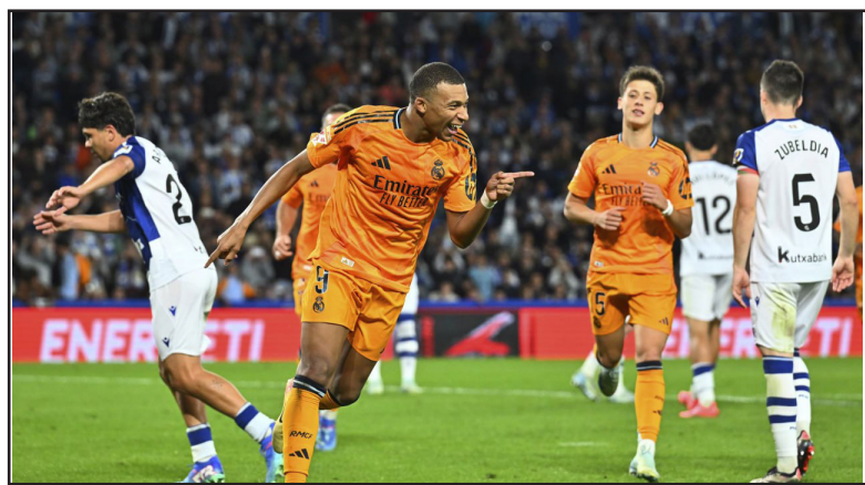
Real Madrid's Kylian Mbappe

SAN SEBASTIAN, Spain - Real Madrid's Vinicius Jr and Kylian Mbappe converted second-half penalties to give the champions a hard-fought 2-0 win at Real Sociedad in La Liga on Saturday.