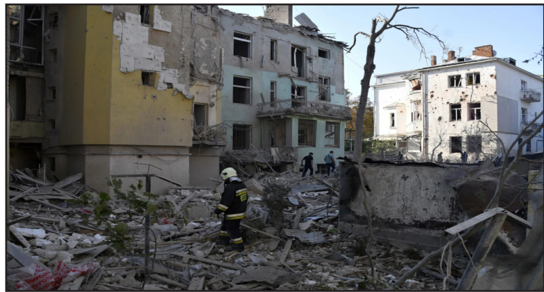
Zelensky says Ukrainian troops are suffering high losses because Western arms are arriving too slowly to equip the armed forces properly.

KYIV (Dispatches) – Ukrainian troops are suffering high losses because Western arms are arriving too slowly to equip the armed forces properly, President Volodymyr Zelensky told CNN in an interview aired on Sunday.