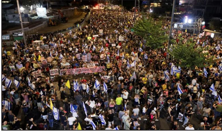
Protest in Tel Aviv against the regime to demand the return of captives held in Gaza