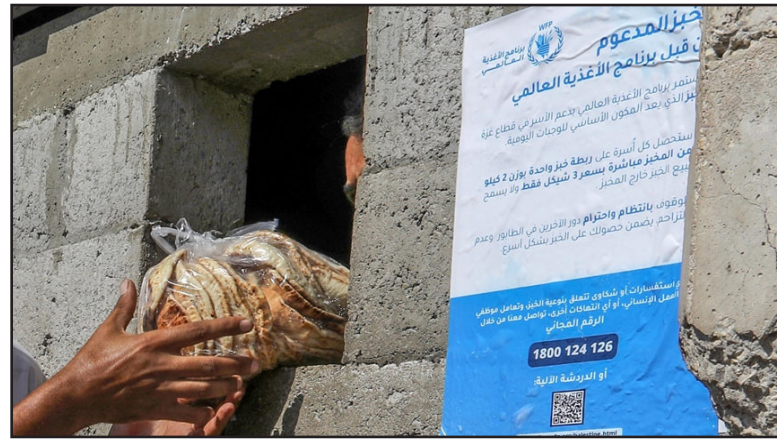
5 out of 6 bakeries close in northern Gaza due to lack of fuel, raw materials.

GAZA CITY (Dispatches) – Palestinians have warned of an imminent famine in the northern Gaza Strip as an ongoing Israeli blockade has forced five out of six functioning bakeries to shut down in the region.