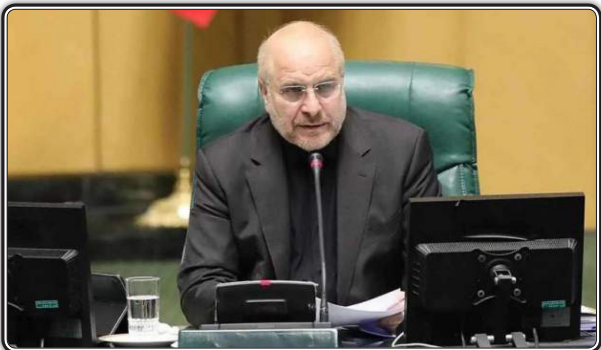
Parliament speaker Muhammad Bagher Ghalibaf addresses the chamber on Sunday.

TEHRAN – Effective negotiations between Iran and the West are out of question as long as the U.S. and Europeans make false allegations against Tehran, Parliament speaker Muhammad Bagher Ghalibaf said Sunday.