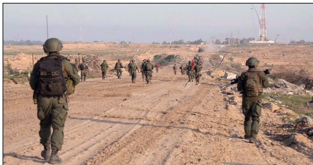
Zionist troops on patrol at an unspecified location in the Gaza Strip

AL-QUDS (Dispatches) – The Zionist regime's opposition leader Yair Golan on Sunday called the governing coalition of prime minister Benjamin Netanyahu a "zero government" that is dragging the occupying regime to an "endless war."