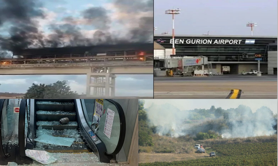
This combo shows the aftermath of a missile attack from Yemen on central Israeli occupied territories on Sunday.

SANAA (Dispatches) -- Yemen's armed forces on Sunday launched a hypersonic ballistic missile that flew around 2,000km from Yemen to central occupied territories, evading Israel's air defense systems and sparking a fire not far from Tel Aviv.