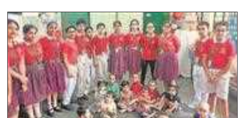
The visit to the orphanage made the students aware about the lives of children with disabilities

children's needs, & the challenges they face. The school also organised a donation during which students distributed biscuits and chips among the children there. It helped them build a sense of sharing among students. They learned to share their privileges with the children who are less privileged.