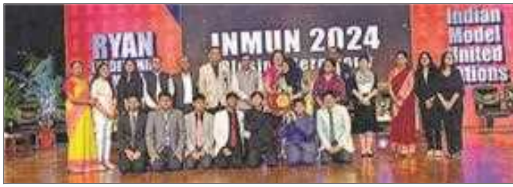
The delegates from various Ryan schools participated in the MUN conference

The conference provided a platform for delegates to experience the complexities of international relations and develop leadership, public speaking, and negotiation skills. Dur-