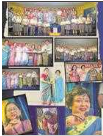
The students as well as the teachers were felicitated during the event