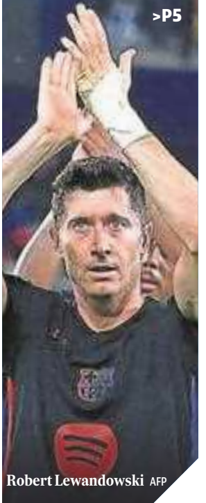
Robert Lewandowski