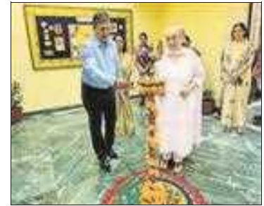
The competition was organised in both online and offline modes

The competition culminated with the prize distribution ceremony which was judged by a panel of distinguished judges called in from different fields for their expertise and skill. The felicitation ceremony was followed by a cultural programme presented by Nrityamanjari, the dance troupe of the school.