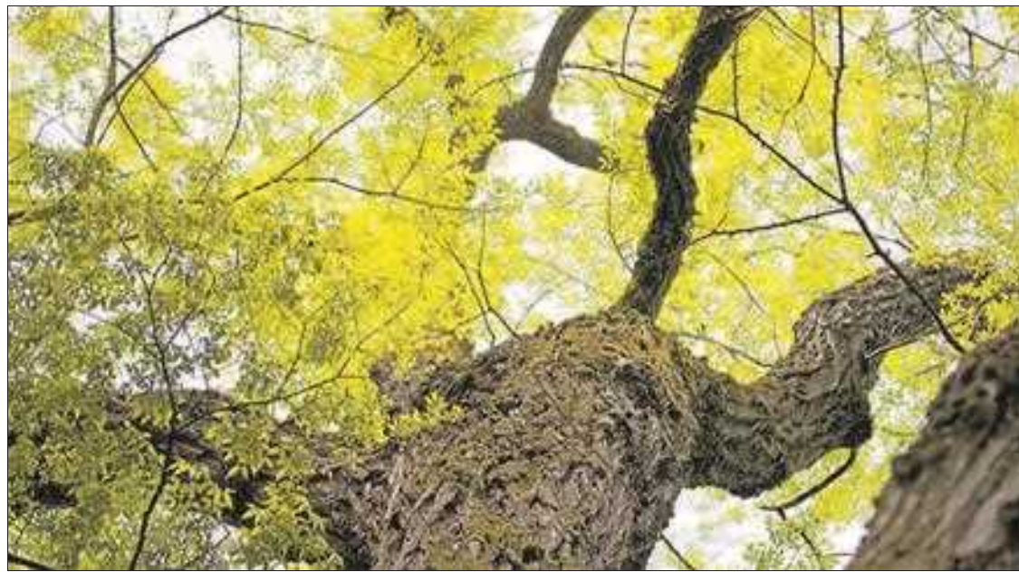
Introduced plants often differ in their characteristics from native plants, meaning they can provide new roles or replace the roles formerly served by native plants. For example, the introduced Siberian elm (in picture) has adapted well to river areas that are now too dry for native elms. The introduced elm has been found to contribute similar roles in the community, like photosynthesis and providing wildlife habitats.