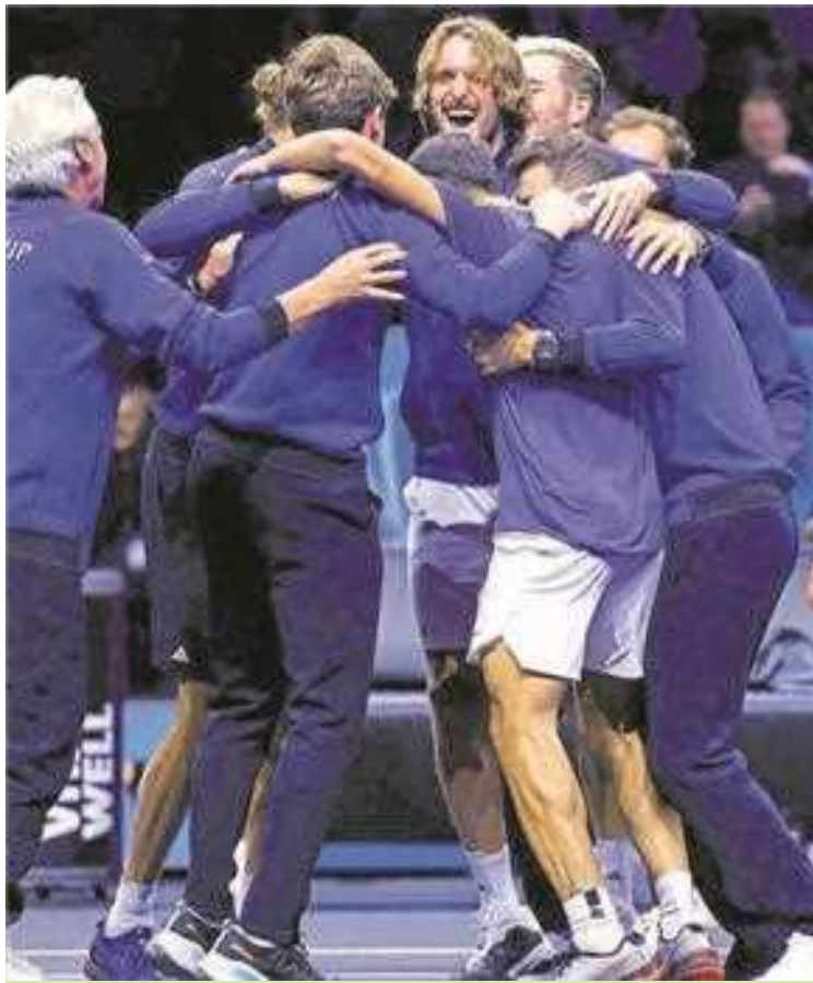
Players of Team Europe celebrate after winning the 2024 Laver Cup in Berlin, Germany. Team Europe won 13-11 against Team World.