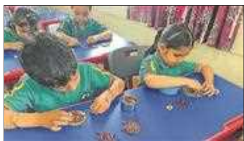
The experiential learning forms the cornerstone of students' educational approach at the school

These hands-on experiences not only deepen students' understanding of academic subjects but also foster critical thinking, problem-solving skills, and a sense of curiosity.