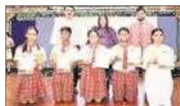
Students took part in a series of intra-school contests during the celebration

Queen Global International School, Dilshad Garden, celebrated its 10th Founder's Day 'ANUJYOT'. Referred to as 'Globalites,' the students took part in a series of intra-school competitions like elocution, storytelling, recitation, poster & logo designing, and fancy dress, which allowed them to showcase their artistic talents.