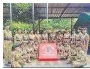
The team of Universal Public School secured the first position in in-line area and nukkad natak events