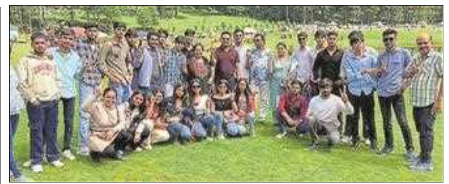
The tour turned out to be a fun-filled and enriching experience for all the participants

CATC witnessed the participation of cadets from various schools and colleges. The UPS cadets underwent extensive training in key army subjects, including weapon training, firing, tent pitching, map reading, army history, and the heroic deeds of war heroes. Several guests conducted sessions on cyber security, e-waste management, POSCO Act, tips for cracking SSB and NDA examinations, as well as pathways to joining the defence forces and civil services. UPS takes pride in its students' remarkable accomplishments at the CATC.