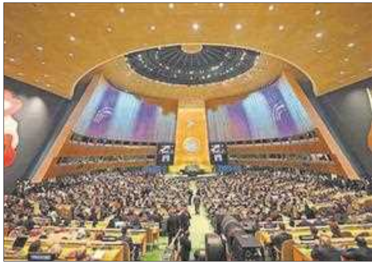
A view of the General Assembly Hall at the opening of the Summit of the Future on the sidelines of the UN General Assembly in New York, on Sunday.

Russia has made significant inroads in Africa — in countries like Mali, Burkina Faso, Niger and Central African Republic — and the continent's rejection of its amendments along with Mexico, a major Latin American power, was seen as a blow to Moscow by some diplomats and observers.