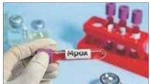
First mpox Clade 1b case was reported from Kerala's Malappuram last week

Those arriving from the nations where the infection was reported have been instructed to report at the airport if they develop any symptoms, she said. As soon as the outbreak of the mpox was reported in 2022, the southern state had brought out a Standard Operating Procedure (SoP) in this regard. PTI