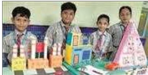
Students participated in the exhibition with great enthusiasm and showcased their artistic skills

The primary wing of AVB Public School, IP Extension, organised an art and science exhibition, which commenced with the lighting of the ceremonial lamp. Students took part in the event and showcased models of natural phenomena, such as water cycle, plant life cycles, food chain, photosynthesis and many more.