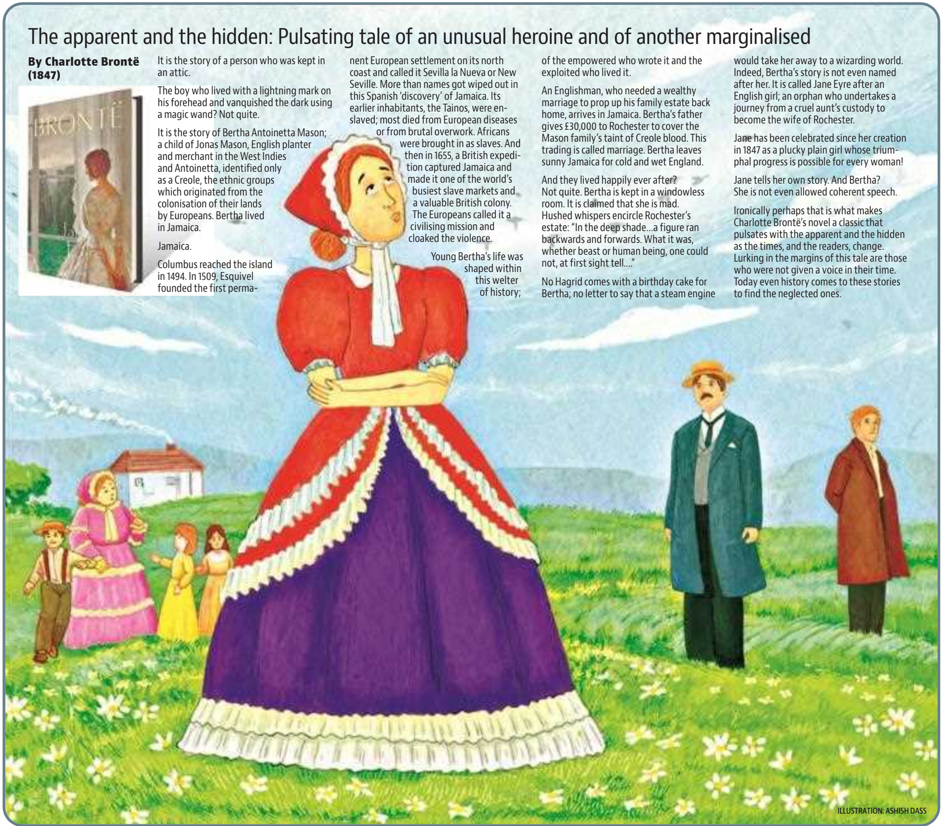
ILLUSTRATION: ASHISH DASS

Ironically perhaps that is what makes Charlotte Brontë's novel a classic that pulsates with the apparent and the hidden as the times, and the readers, change. Lurking in the margins of this tale are those who were not given a voice in their time. Today even history comes to these stories to find the neglected ones.