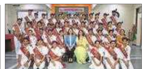
The event's highlight was the pinning of badges & adorning of sashes to the elected council members

The event ended with the award ceremony. DPS Indrapuram won both the Best School Delegation and Best School Participation awards.