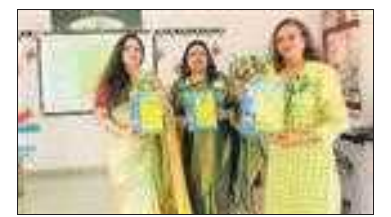
The seminar stressed on adopting sustainable practices to mitigate the impacts of climate change & pollution