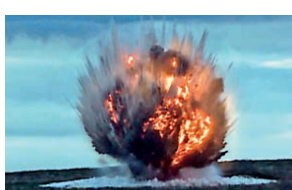
A new tactical ballistic missile lands on the target during a test-firing, at an undisclosed location in North Korea.

Manila, Sept. 19: The United States has no immediate plans to withdraw a mid-range missile system deployed in the Philippines, despite Chinese demands, and is testing the feasibility of its use in a regional conflict, sources with knowledge of the matter said. The Typhon system, which can be equipped with cruise missiles capable of striking Chinese targets, was brought in for joint exercises earlier this year, both countries said at the time, but has remained there. The Southeast Asian archipelago, Taiwan's neighbour to the South, is an important part of US strategy in Asia and would be an indispensable staging point for the military to aid Taipei in the event of a Chinese attack. China and Russia have condemned the first deployment of the system to the Indo-Pacific, accusing Washington of fuelling an arms race. China's foreign ministry said on Thursday it was very concerned about the plan. — Reuters