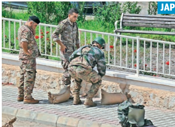
Lebanese army forces prepare to destroy in a controlled explosion a communication device found in southern Lebanon, on Thursday.

Beirut, Jerusalem, Sept. 19: Israel bombed southern Lebanon on Thursday and said it had thwarted an Iranian-led assassination plot after explosions in booby-trapped radios and pagers in the past two days caused havoc in the ranks of Hezbollah. Hezbollah fired a new barrage into northern Israel on Thursday, continuing its drumbeat of exchanges with the Israeli military as fears of a greater war rise after hundreds of electronic devices exploded, killing 37. Turkiye on Thursday accused Israel of seeking to expand the war in Gaza to Lebanon with the "alarming" wave of deadly explosions that swept through Hezbollah strongholds. "The escalation in the region is alarming," foreign minister Hakan Fidan said on state-run TRT television. "We see Israel mounting its attacks towards Lebanon step by step." Lebanese authorities on Thursday banned walkie-talkies and pagers from being taken on flights from Beirut airport, the National News Agency reported, after thousands of such devices exploded during a deadly attack on Hezbollah this week. The attacks on Hezbollah's communications equipment killed 37 people and wounded around 3,000, raising fears that a full-blown war was imminent. It also sowed disarray across Lebanon as panicked residents abandoned their mobile phones. "This isn't a small matter, it's war. Who can even secure their phone now? When I heard about what happened yesterday, I left my phone on my motorcycle and walked away," said Mustafa Sibal in Beirut.