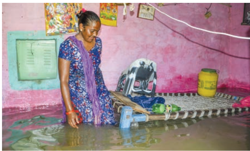
A woman tries to save her belongings after water entered houses due to an increase in the level of Pandu river following heavy rainfall in Kanpur on Thursday.

"Our Navy has made a significant contribution in protecting the economic interests of all stakeholder nations of the Indo-Pacific and in smooth movement of goods in the Indian Ocean Region," Mr Singh said.