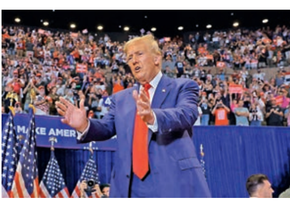
Republican presidential nominee Donald Trump speaks at an evening rally in Uniondale on Long Island on Wednesday in Uniondale, New York.

Washington, Sept. 19: Iranian hackers sought to interest President Joe Biden's campaign in information stolen from rival Donald Trump's campaign, sending unsolicited emails to people connected to the Democratic president in an effort to interfere in the 2024 poll, the FBI and other federal agencies said on Wednesday. "There's no evidence that any of the recipients responded," officials said, preventing the hacked information from surfacing in the final months of the closely contested election. The hackers sent emails in late June and early July to people who were associated with Biden's campaign before he dropped out. The emails "contained an excerpt taken from stolen, non-public material from former president Trump's campaign as text in the emails," according to a US government statement. The announcement is the latest effort to call out what officials say is Iran's brazen, ongoing work to interfere in the 2024 election. The FBI, the Office of the Director of National Intelligence and the Cybersecurity and Infrastructure Security Agency have said the Trump campaign hack and an attempted breach of the Biden-Harris campaign are part of an effort to undermine voters' faith in the election and to stoke discord. — AP