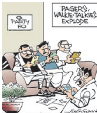
Are our mobiles safe?