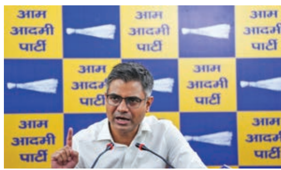
AAP MP Sandeep Pathak addresses a press conference in New Delhi on Thursday.