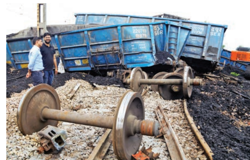
Officials stand near derailed wagons of a goods train in Mathura on Thursday. Twenty-five wagons of the train taking coal to the Suratgarh power plant derailed near Vrindavan on Wednesday, a senior official said.