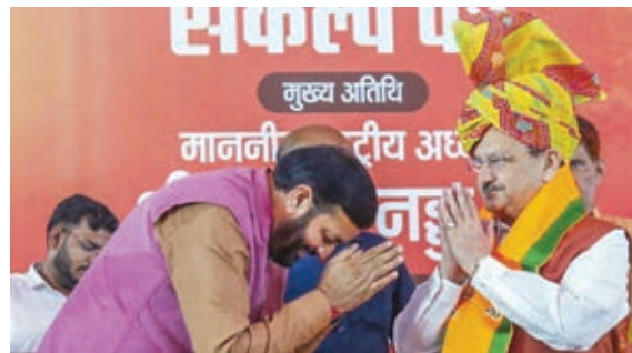
Union minister and BJP president J.P. Nadda being greeted by Haryana chief minister Nayab Singh Saini during the release of party's manifesto for Haryana Assembly elections in Rohtak on Thursday.

Mr Kharge had raised with Mr Modi the issue of "extremely objectionable" and violent statements by ruling alliance members targeting Mr Gandhi and urged him to discipline his leaders. He had also demanded strict legal action against those giving such statements so that Indian politics can be prevented from degenerating and nothing untoward happens.