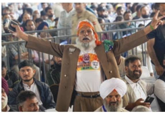
A BJP supporter during Prime Minister Narendra Modi's rally for Jammu & Kashmir Assembly elections in Srinagar on Thursday.

It asserted that the authorities' escalating repression of human rights after revocation of special autonomous status of the region has resulted in arbitrary detentions, passports being revoked, the creation of opaque "no flying lists".