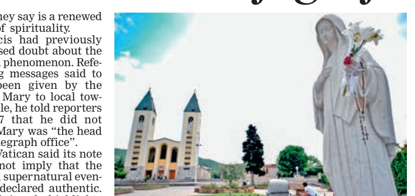
A statue depicting Virgin Mary in front of St Jacob church in Medjugorje, Bosnia.

Thursday's statement appeared to conclude decades of Vatican investigations into the alleged visitations, which were first reported by six children in 1981, in a scenario reminiscent of famous apparitions in the French town of Lourdes in the 19th century and more than 100 years ago in Fatima in Portugal. The Bosnian village has become a major pilgrimage site, attracting hundreds of thousands each year and giving many people what they say is a renewed sense of spirituality. Francis had previously expressed doubt about the alleged phenomenon. Referencing messages said to have been given by the Virgin Mary to local townspeople, he told reporters in 2017 that he did not think Mary was "the head of a telegraph office". The Vatican said its note "does not imply that the alleged supernatural events are declared authentic. Instead, it only highlights that the Holy Spirit is acting fruitfully."