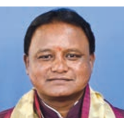
Mohan Charan Majhi Yojana — a women's welfare scheme, and a significant increase in the Minimum Support Price (MSP) for paddy to ₹3,100 per quintal.

During his address, Mr Majhi emphasised the government's commitment to fulfilling its electoral pledges and outlined several major initiatives launched within this short period. These include the reopening of the four gates of Lord Jagannath's Srimandir in Puri, the re-accessing of the Ratna Bhandar (treasury) of Srimandir after 40 years re-enumeration, the introduction of the Subhadra