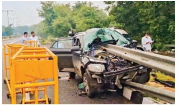
A damaged SUV after it crashed into a guard rail in New Delhi on Thursday.

Another officer said they were also investigating if there was any engineering fault on the road.