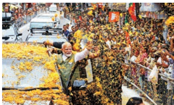
Prime Minister Narendra Modi during a roadshow for the Jammu and Kashmir elections at Katra in Reasi district on Thursday.

Prime Minister Narendra Modi, while striking a chord with the people of Jammu and Kashmir on Thursday, said that he and his party, the BJP, were working hard towards bridging the distances between them and Delhi and bring their hearts closer. "Hum Dil ki doori and Dilli se doori mita rahe hain" (we are removing the space between our hearts and from Delhi), he said, while addressing a rally here. He said that his government had already committed itself in Parliament to restoring J&K's statehood. "The BJP will fulfil this promise. The BJP implements fully what it says or promises. I, therefore, appeal to you to come out on September 25 to vote in its favour and break all previous records (of voter turnout)". After opening his speech with extending greetings to the people in Kashmiri, the PM said he had come to Srinagar with the message that his vision for J&K is to "speed up development works to take it to new heights of success". He said: "It is Modi's goal and promise as well to make J&K completely terror free, to defeat every conspiracy that is hatched against it and every power which lays a plan to damage it and make it a peaceful and prosperous region," he said. Accusing the "three