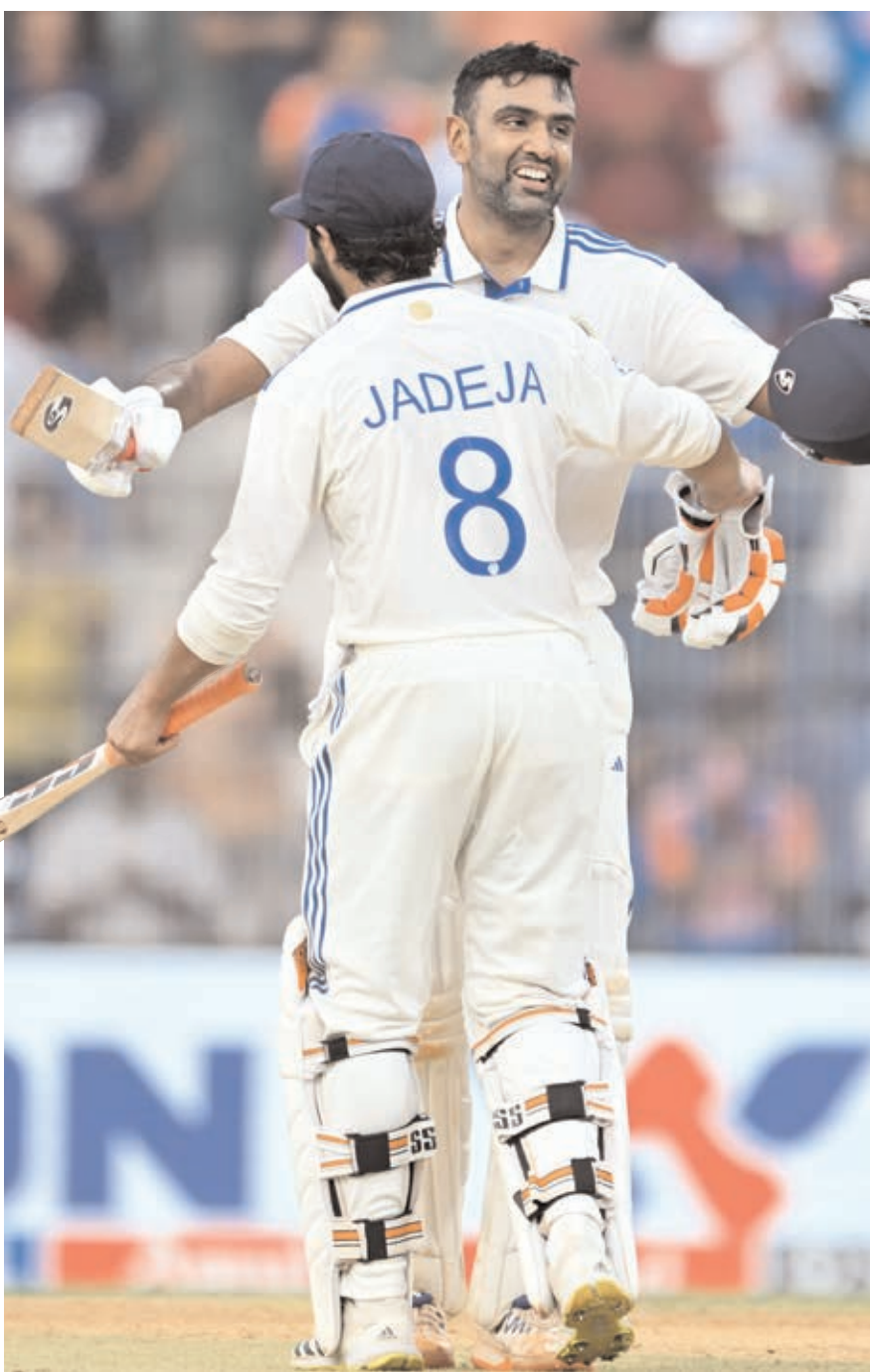
India's Ravichandran Ashwin celebrates his century with teammate Ravindra Jadeja on the first day of the first Test against Bangladesh at the M. A. Chidambaram Stadium in Chennai on Thursday.